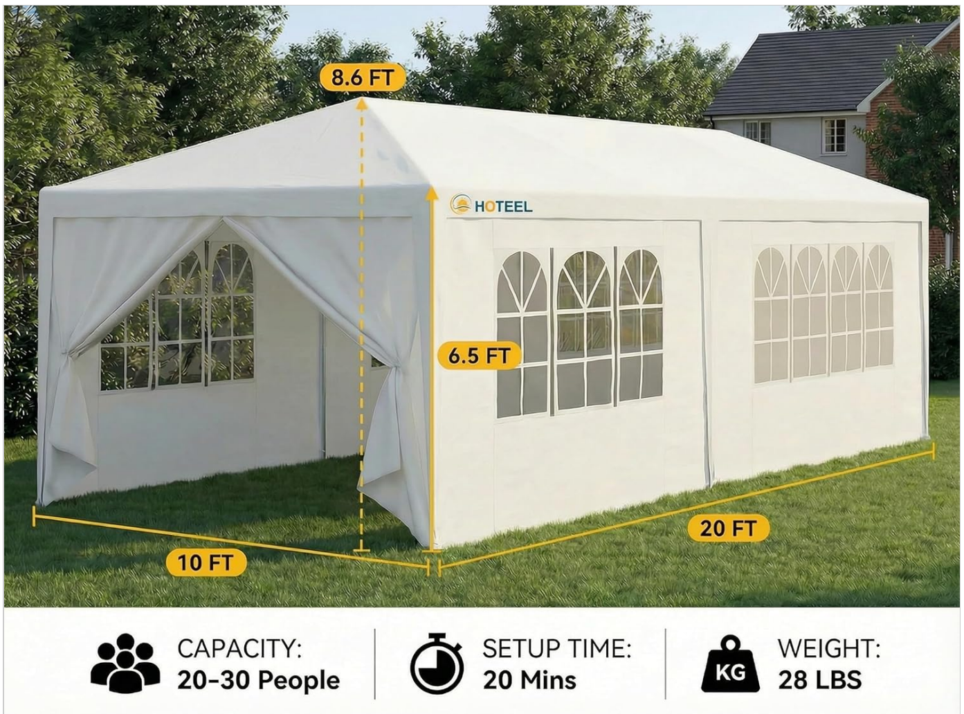
Image: Overview of the HOTEEL 10x20 Party Tent, showing its dimensions (10ft x 20ft, 8.6ft peak height, 6.5ft side height), capacity (20-30 people), estimated setup time (20 mins), and weight (28 lbs).