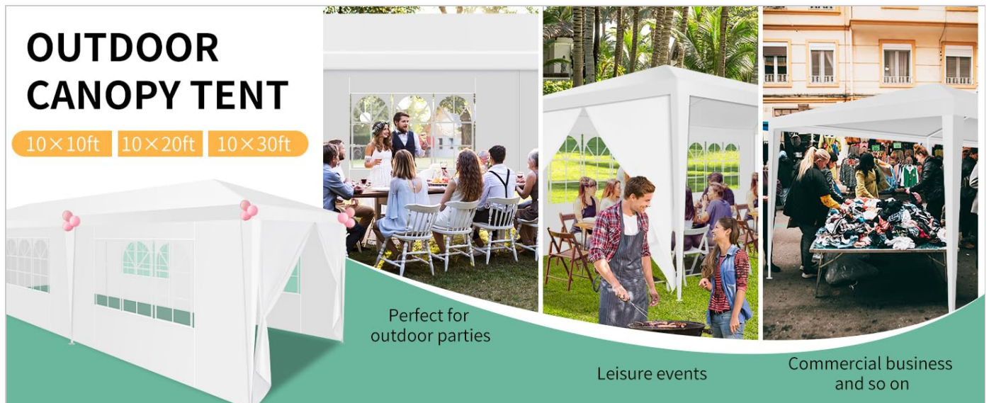
Image: HOTEEL 10x20 Party Tent showcasing its key features: easy setup, UV protection, and waterproof design.

This manual provides detailed instructions for the assembly, operation, and maintenance of your HOTEEL 10x20 Party Tent Outdoor Canopy. Please read all instructions carefully before setup and retain this manual for future reference.