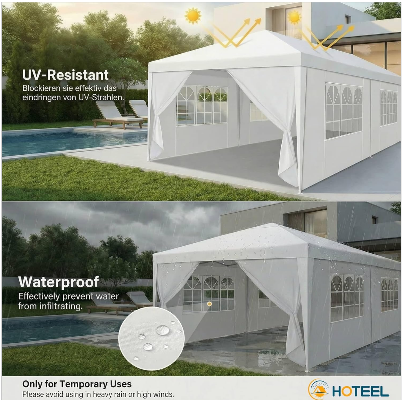
Image: The HOTEEL 10x20 Party Tent demonstrating its UV-resistant properties against sun exposure and its waterproof capability against rain, suitable for temporary outdoor use.