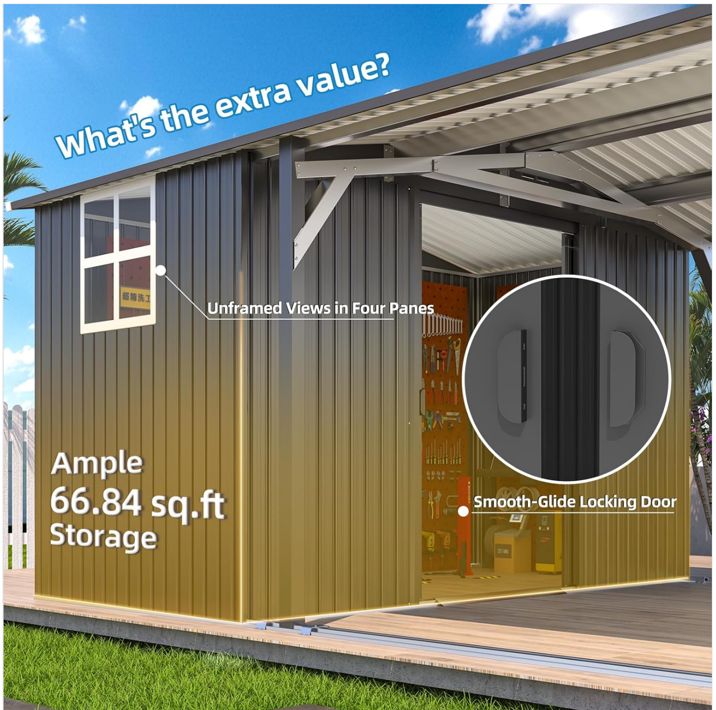
Image: A close-up view of the storage shed, highlighting its interior space and the smooth-glide locking door mechanism.