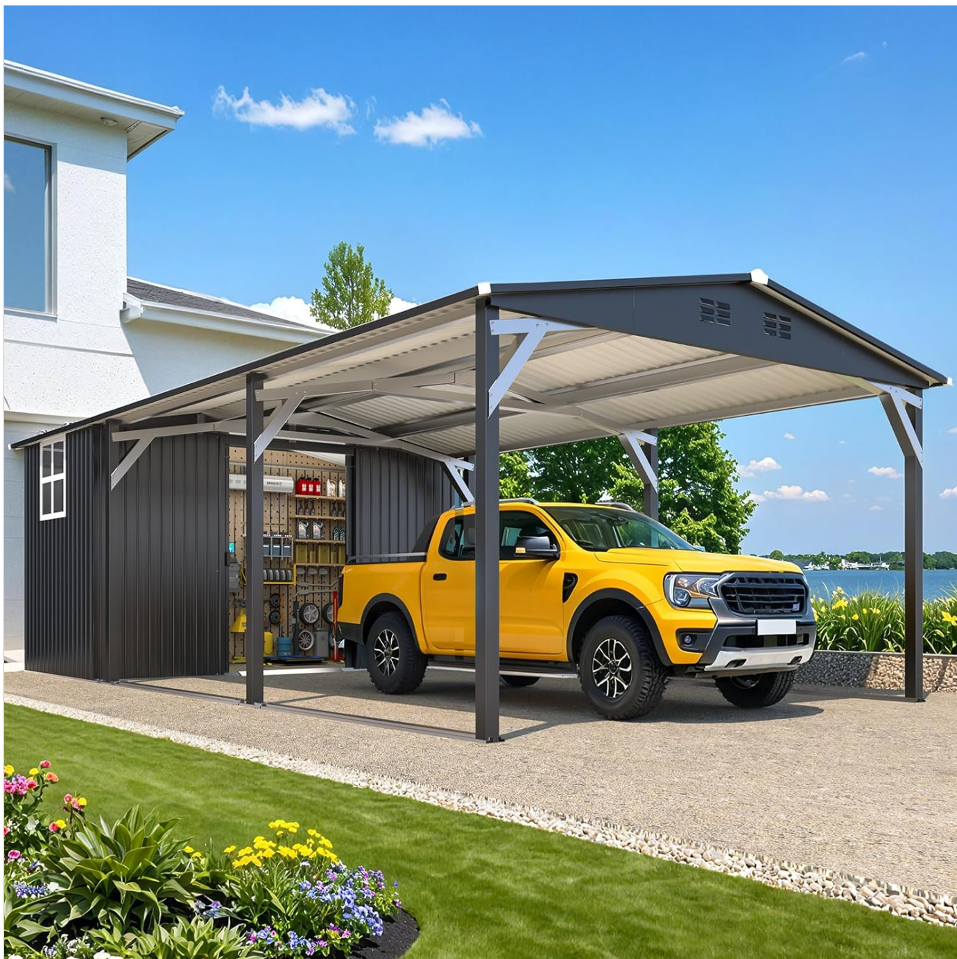
Image: An aerial view of the AECOJOY 11'x23' Metal Carport with Storage Shed, showcasing its overall design and size.