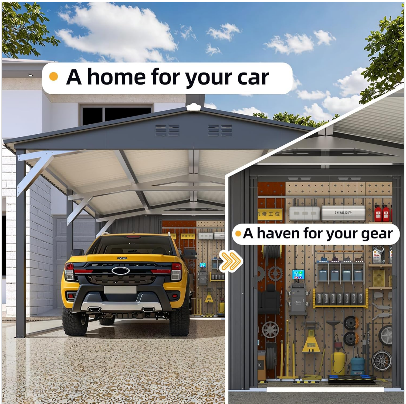
Image: The carport section sheltering a yellow pickup truck, with the integrated storage shed visible on the left, organized with tools and equipment.