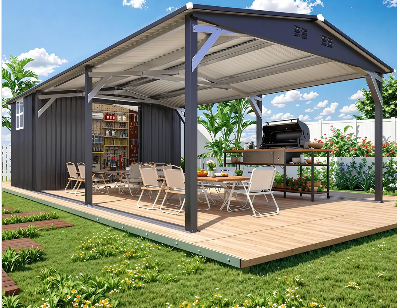
Image: The carport configured as an outdoor dining area with a table, chairs, and a grill, demonstrating its versatility as a gazebo.

More than a carport it's an outdoor retreat with storage space.