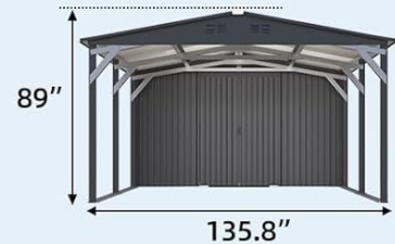
Image: A technical diagram illustrating the overall dimensions and key measurements of the carport and integrated storage shed.