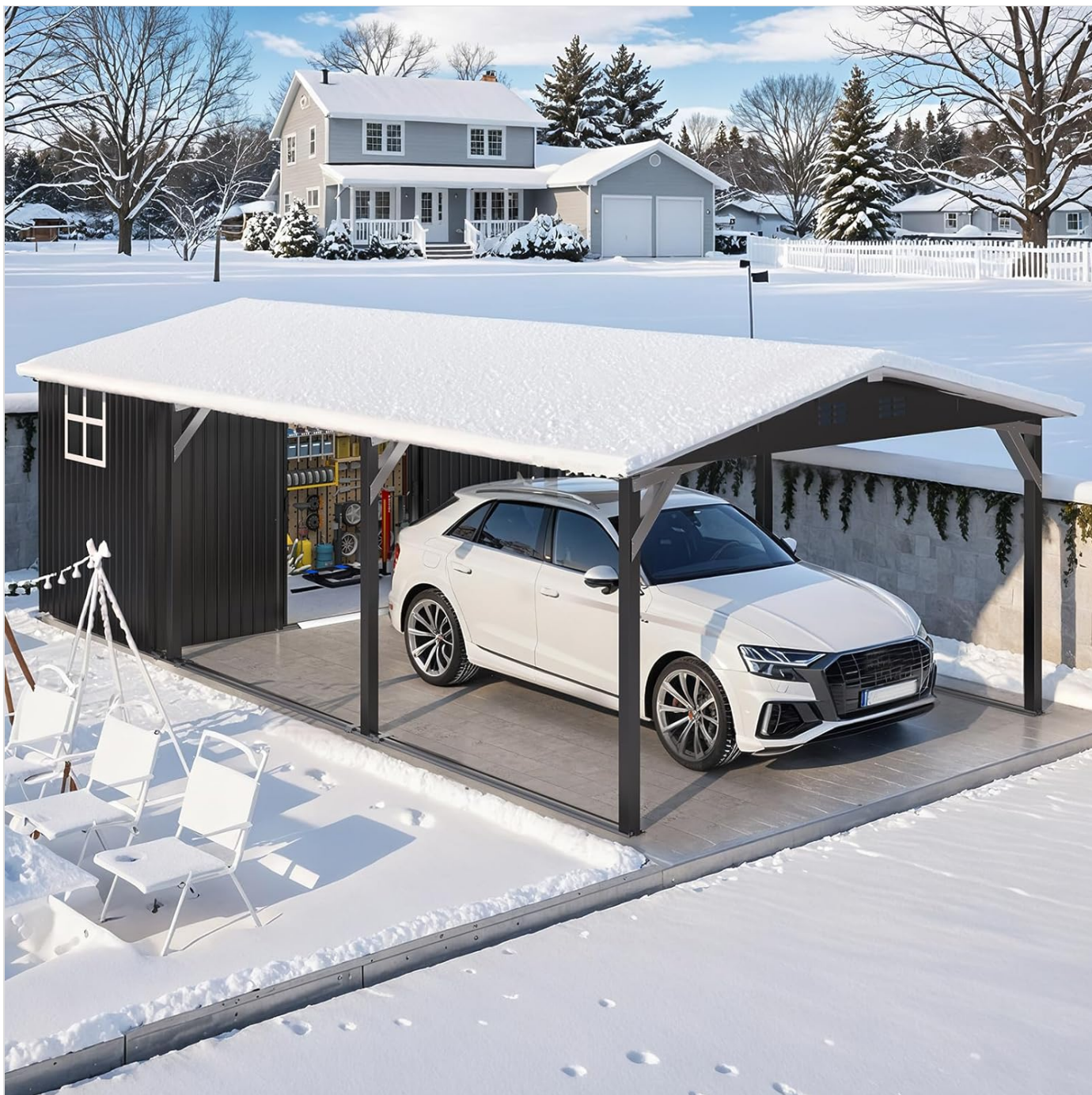
Image: The carport and shed covered in a layer of snow, illustrating the need for snow removal during winter conditions.