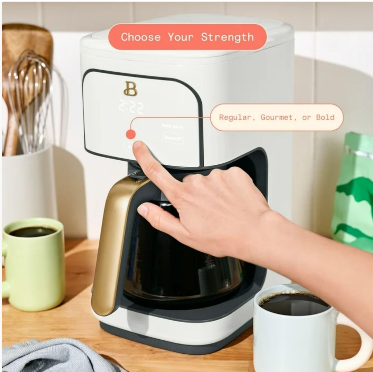
Image: A user's hand interacting with the control panel to select the desired brew strength, showing options for Regular, Gourmet, or Bold coffee.