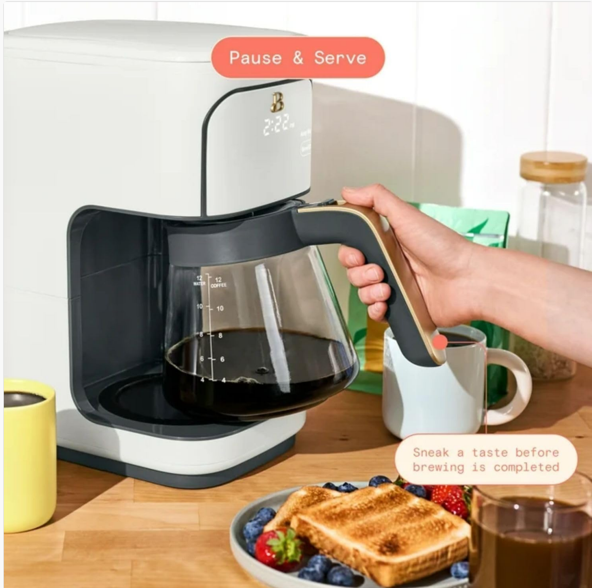
Image: A user demonstrating the Pause & Serve feature by temporarily removing the carafe during the brewing process to pour a cup of coffee.

This feature allows you to pour a cup of coffee before the entire brewing cycle is complete.