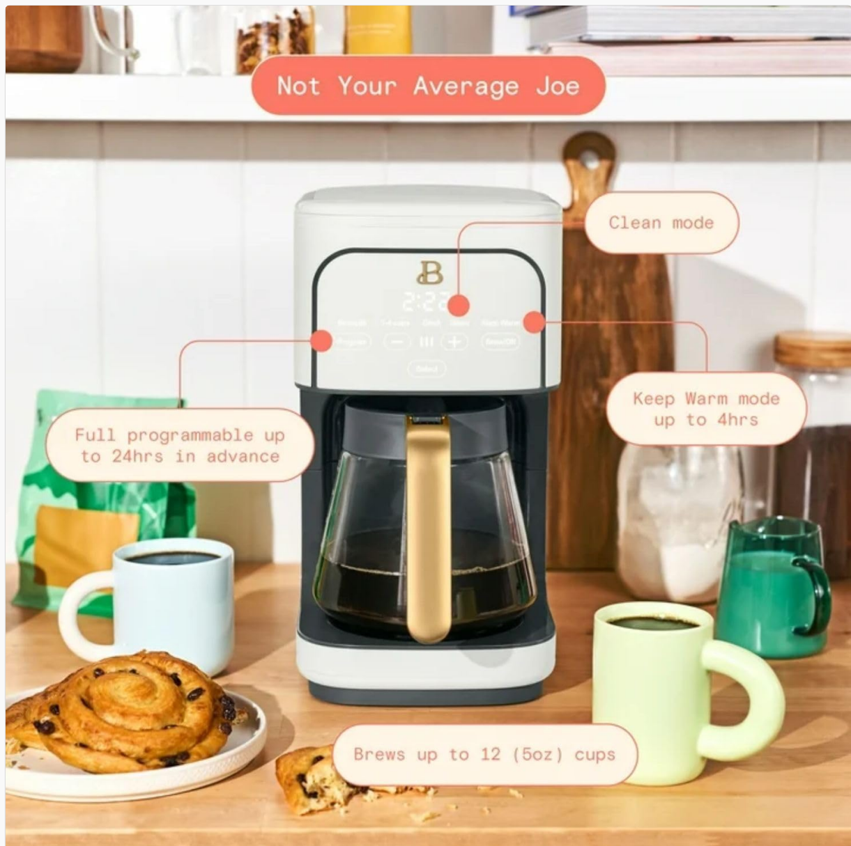
Image: An overview of the coffee maker, pointing out its main features such as the 24-hour programmable timer, adjustable brew strength settings (Regular, Gourmet, Bold), Keep Warm mode for up to 4 hours, Clean mode, and its 12-cup capacity.

Familiarize yourself with the components of your 12-Cup Programmable Coffee Maker.