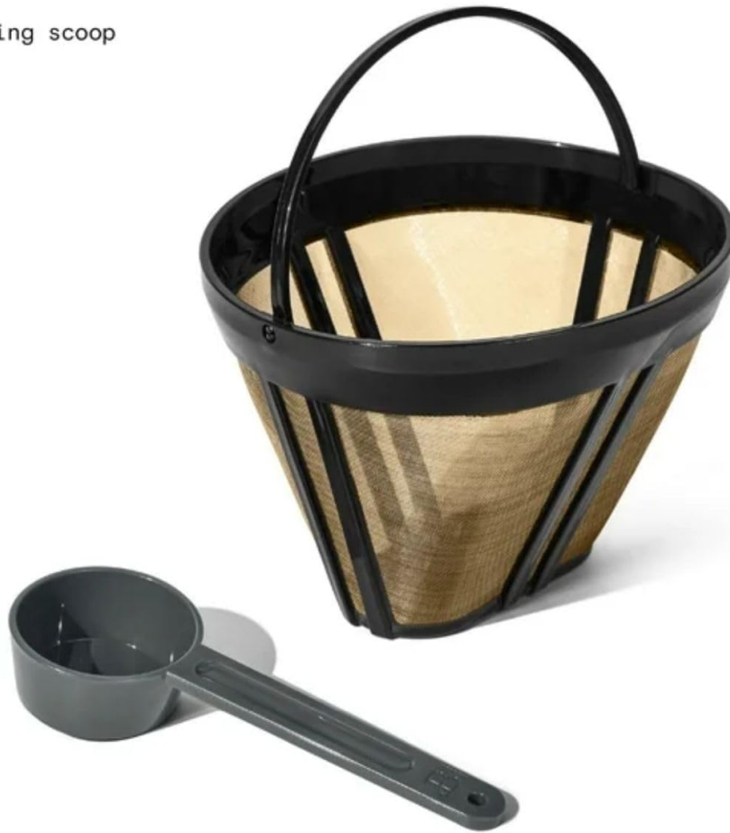
Image: The reusable gold-tone filter and the measuring scoop, which are included with the coffee maker for convenience and to reduce waste.