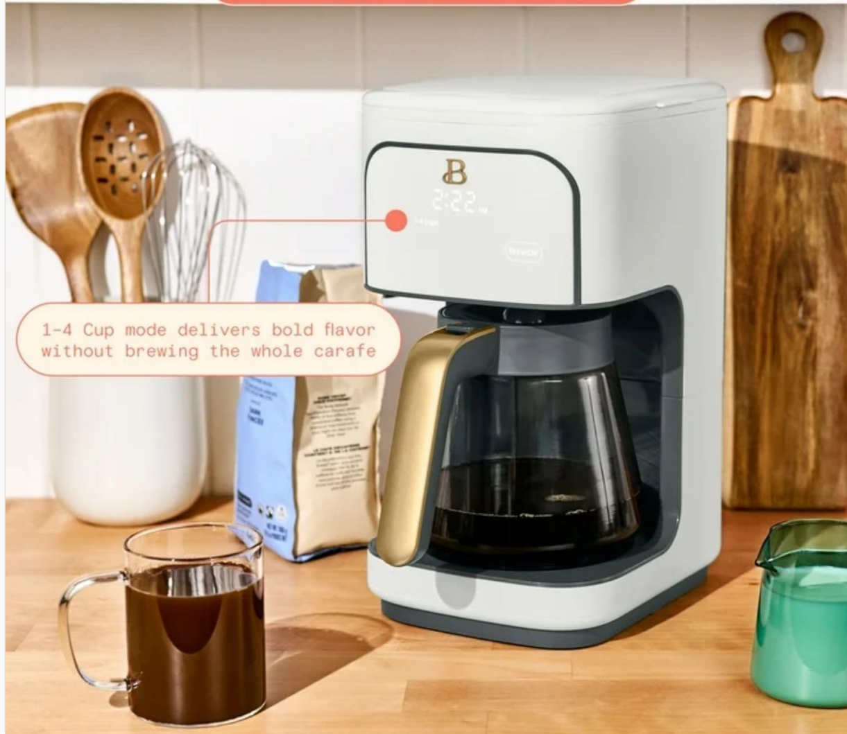
Image: The coffee maker's display indicating "1-4 cup mode," designed to deliver bold flavor even when brewing smaller quantities of coffee, avoiding the need to brew a full carafe.