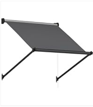
Image Description: An AECOJOY retractable awning installed on the exterior of a house, providing shade over a patio area.