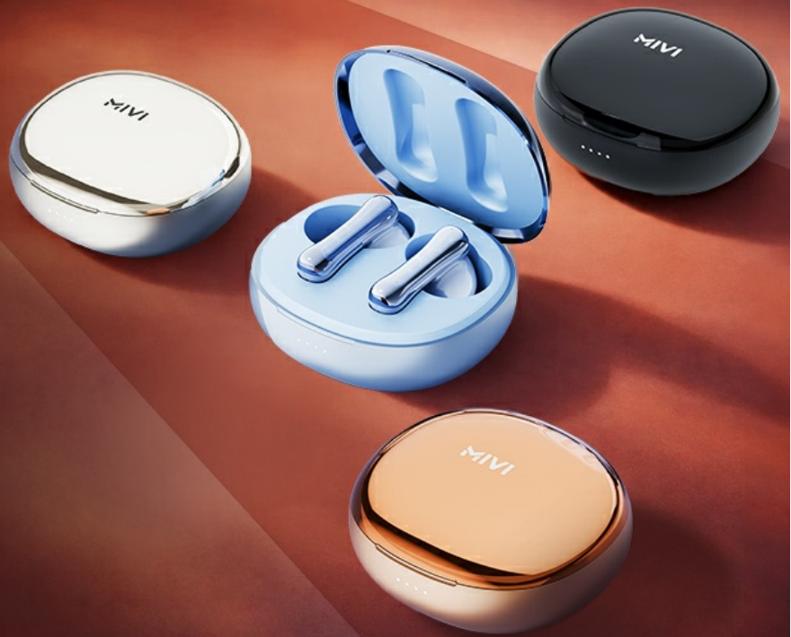
Image: Earbuds and charging case with a large '65 Hrs' graphic, representing total playtime.

Step out in style with a pristine mirror-glass finish in three stunning shades.