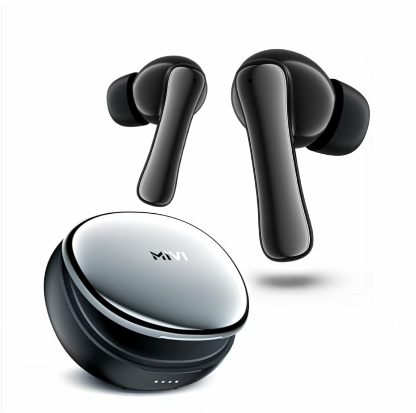
Image: Mivi SuperPods Harmony TWS Earbuds in their charging case, ready for use.