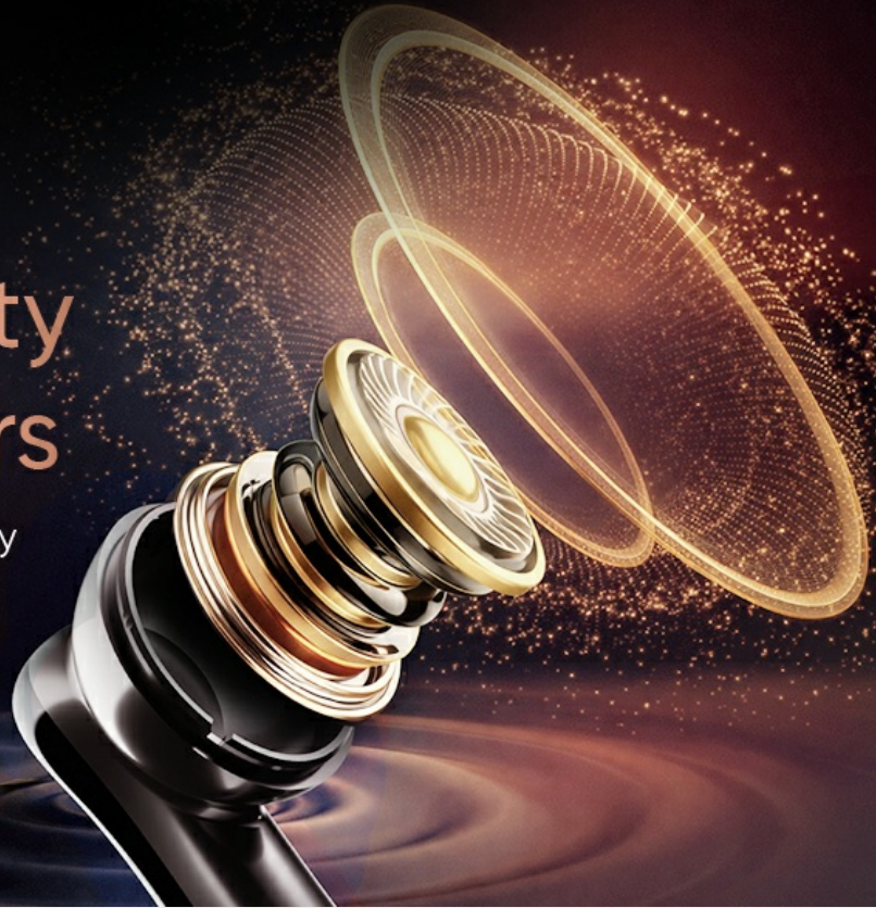
Image: Close-up illustration of the 13mm high-fidelity bass drivers.

From mellow tracks to heavy drops, every beat lands with rich depth, driven by precision-tuned 13mm dynamic bass drivers.