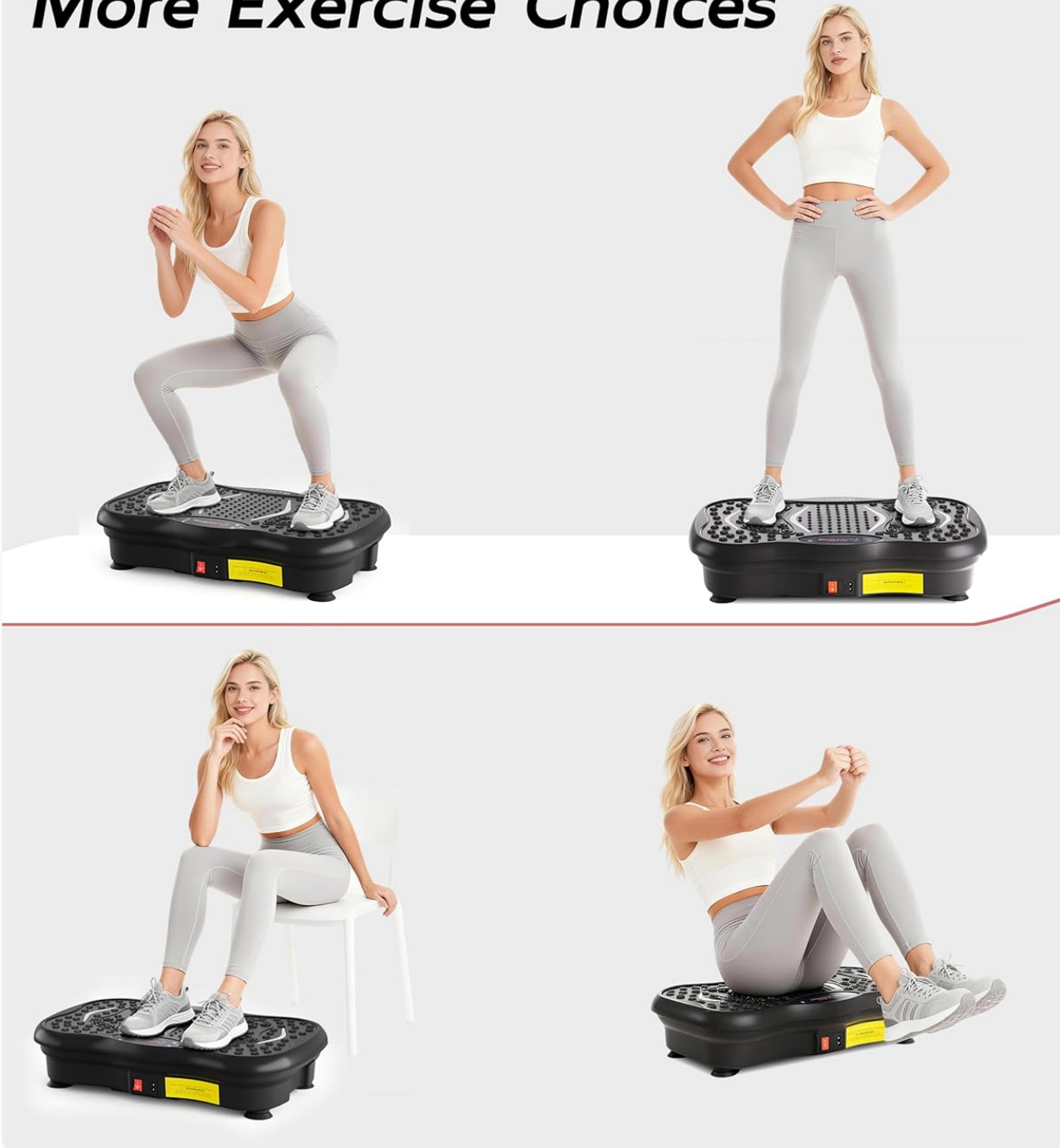
Figure 5: Various exercise positions on the vibration plate.