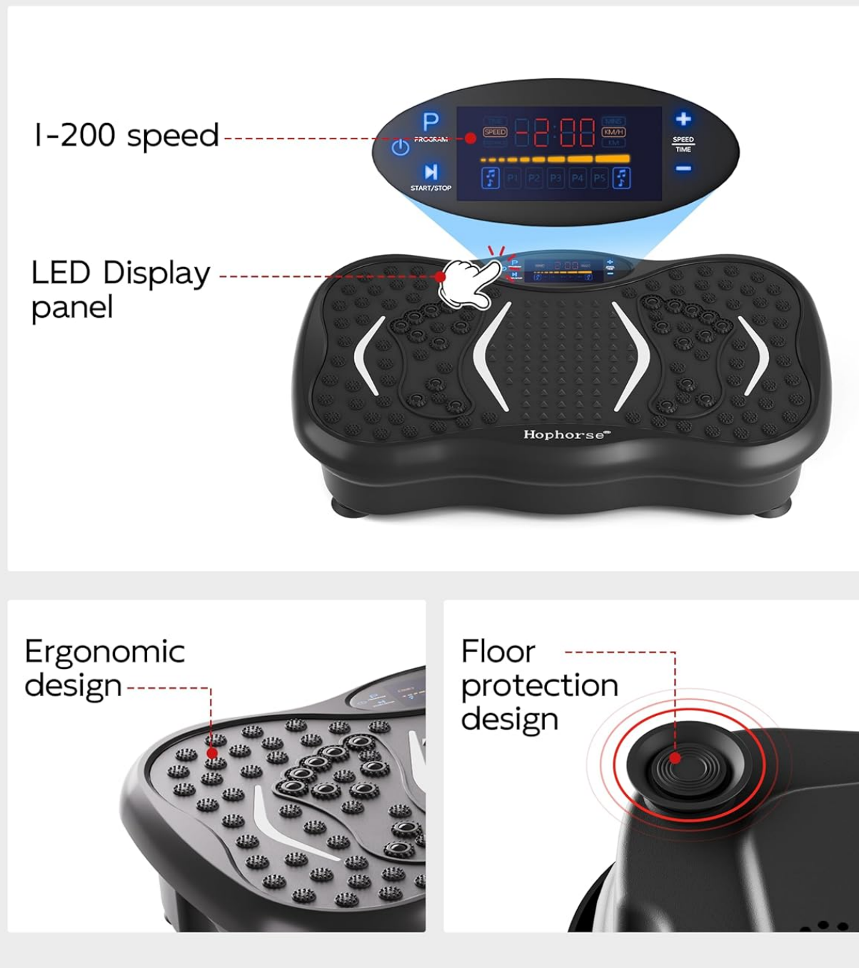
Figure 7: Easy storage options for the compact vibration plate.