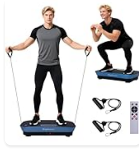
Figure 4: Packing List for the Hophorse Vibration Plate Machine.