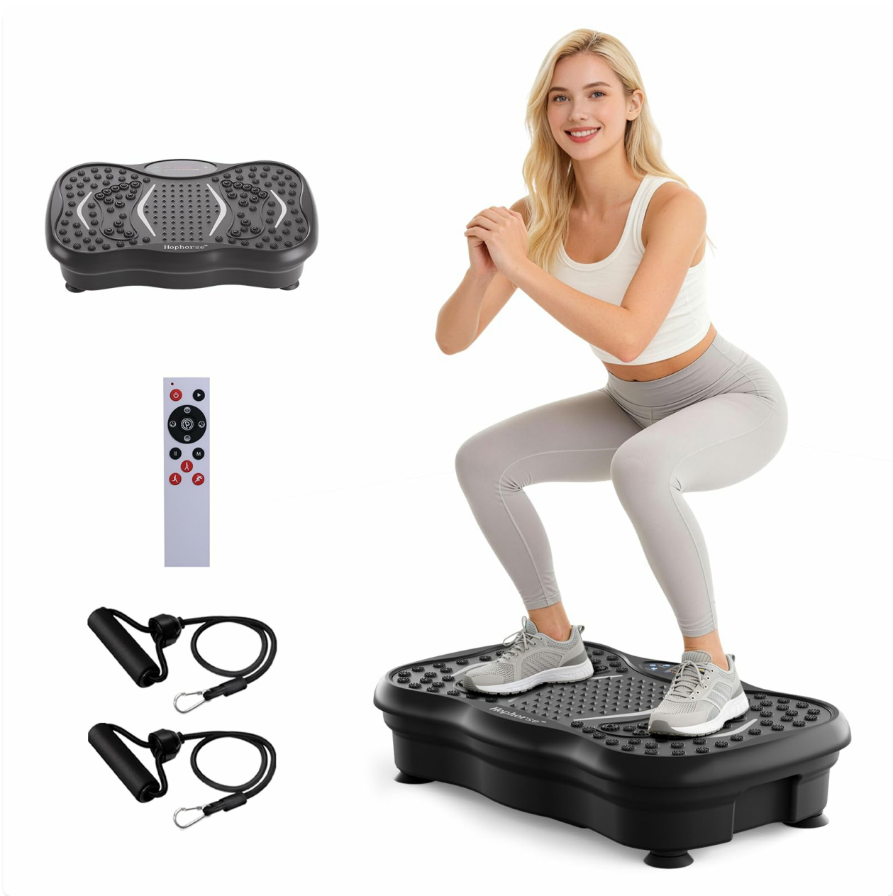
Figure 1: Hophorse Vibration Plate Machine in use.

This vibration plate is suitable for various users, including those focusing on lymphatic drainage, muscle recovery, improving circulation, and enhancing bone density. Its compact design allows for convenient use in various home or office settings.