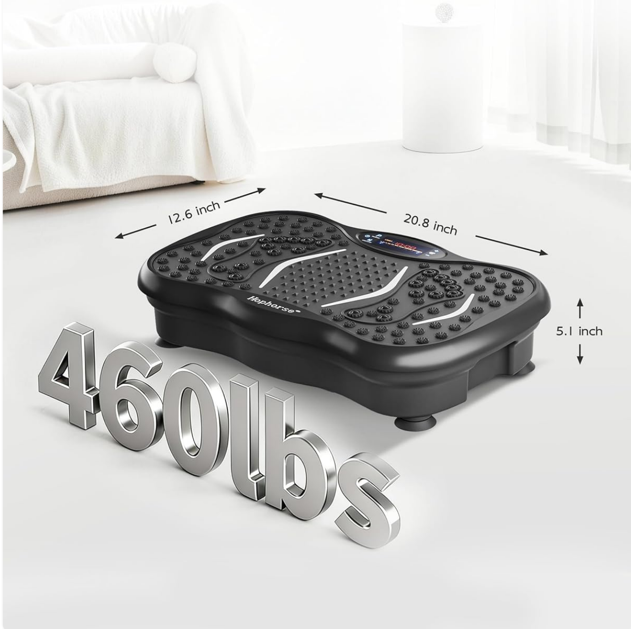
Figure 3: The machine's robust construction supports up to 460 lbs.

Wide 20.8inch base for enhanced stability