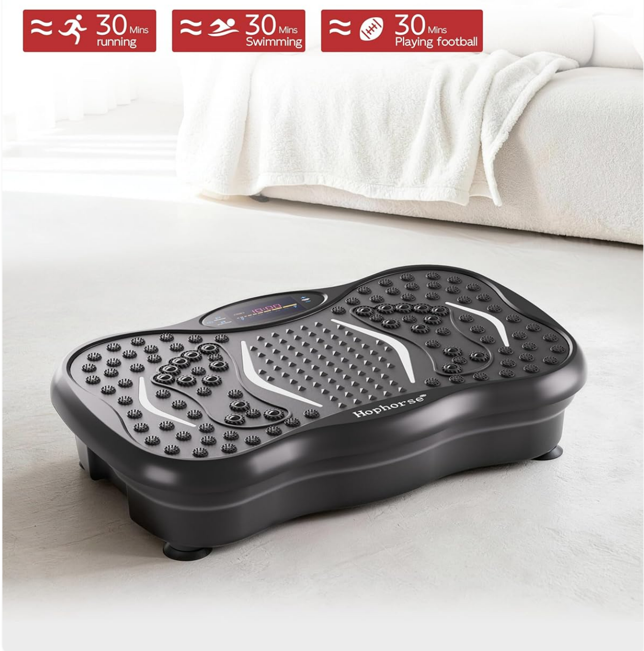
Figure 2: Detailed view of the control panel and ergonomic design.