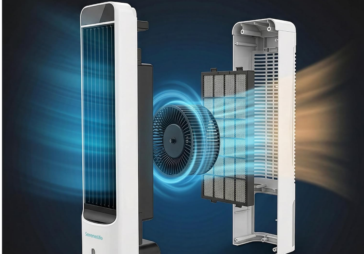
Image: An internal view of the air cooler, illustrating its energy-smart cooling power with an 80W low power motor and energy-saving design, featuring the fan and filter system.