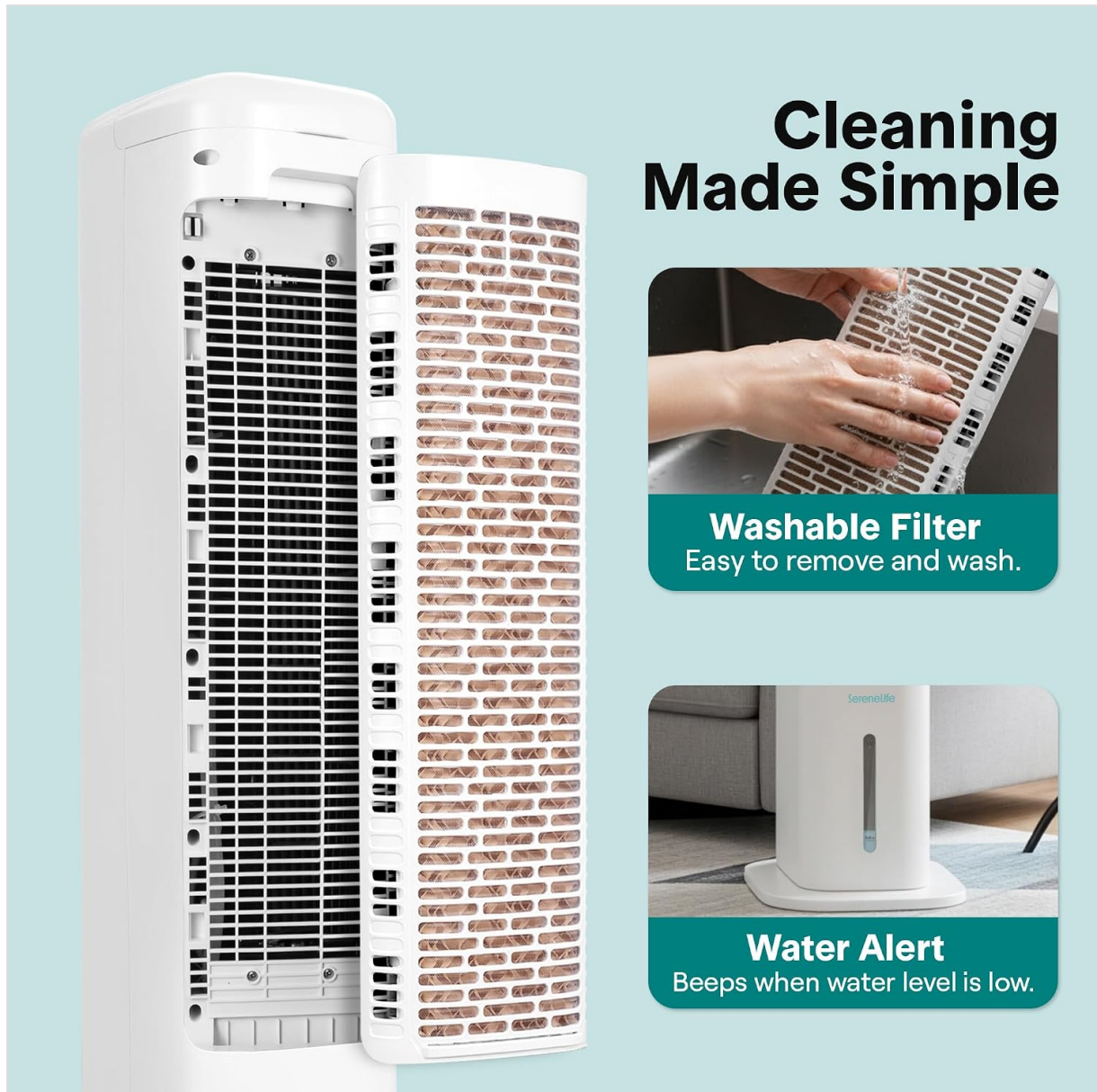
Image: Demonstrates the ease of cleaning with a removable, washable filter. Also shows the water alert feature, which beeps when the water level is low, ensuring timely refills.