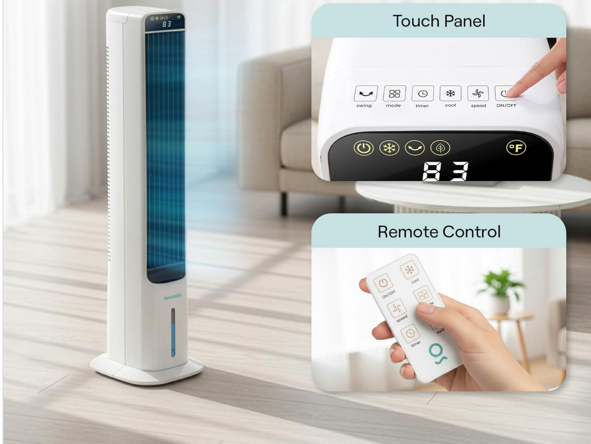
Image: The air cooler's dual control convenience, featuring a detailed view of the top-mounted touch panel and the handheld remote control, both offering access to all functions.