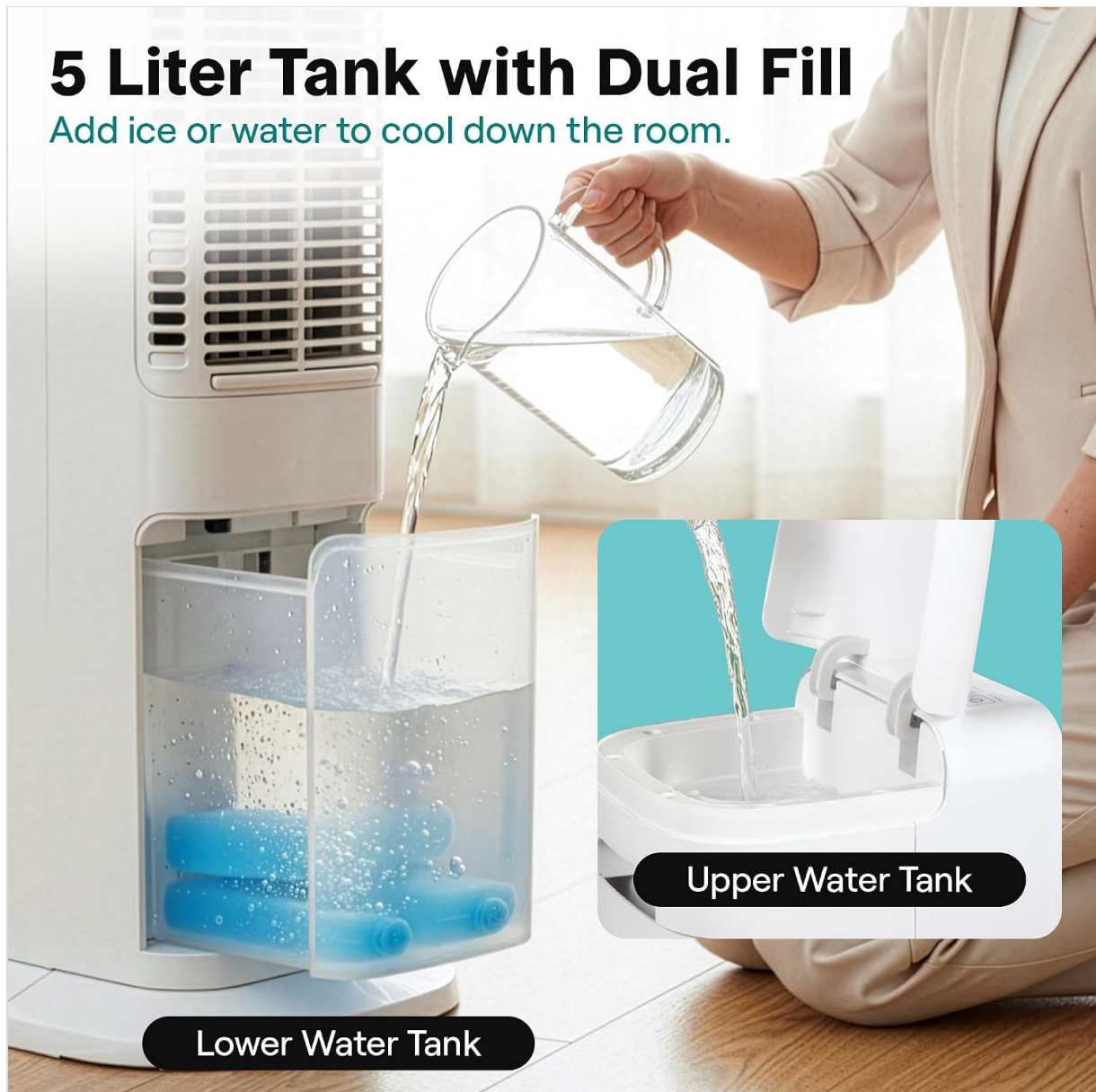
Image: Illustration of the 5-liter water tank and its dual-fill design. Water can be added directly to the upper tank or by removing and filling the lower tank, which also accommodates the included ice packs.