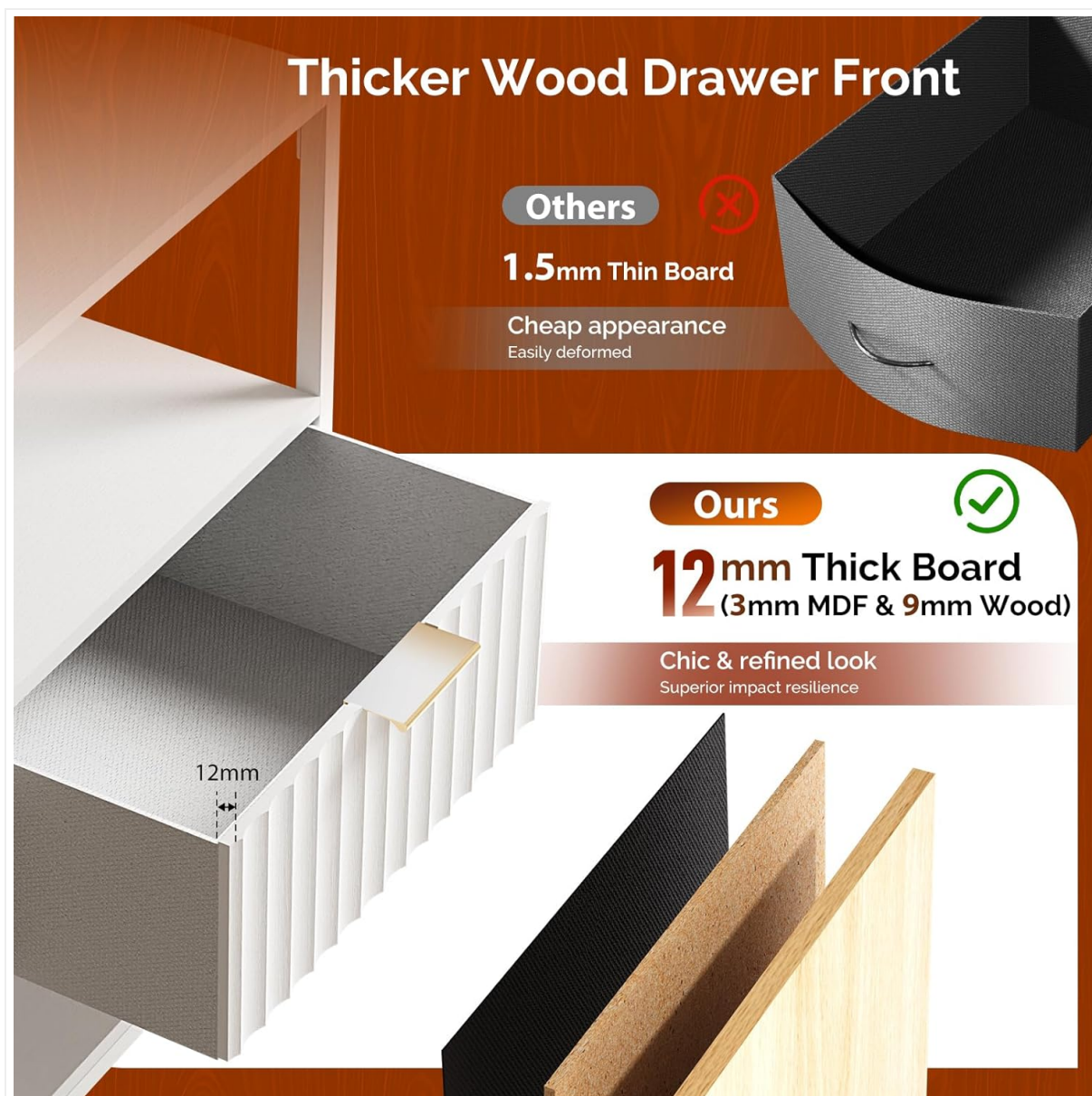
Image 5.3: The nightstand with a drawer partially open, illustrating its storage capacity.