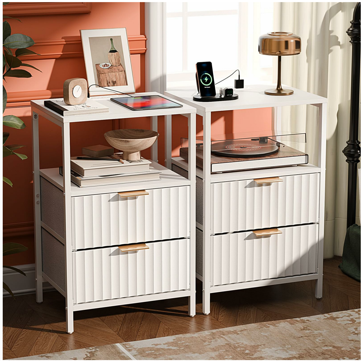
Image 1.1: VINGLI N02FW2D White Nightstand with Charging Station, showcasing its design and features.

Your browser does not support the video tag.