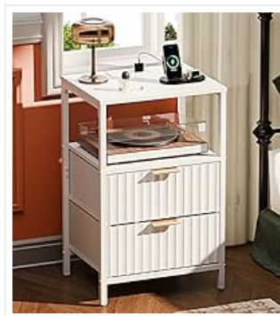
Image 5.2: Detailed view of the USB, Type-C, and AC outlets on the charging station.