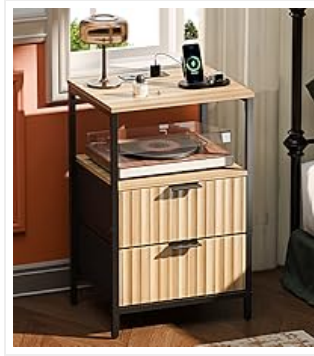
Image 6.1: Close-up of the tabletop surface, illustrating its waterproof finish for easy cleaning.