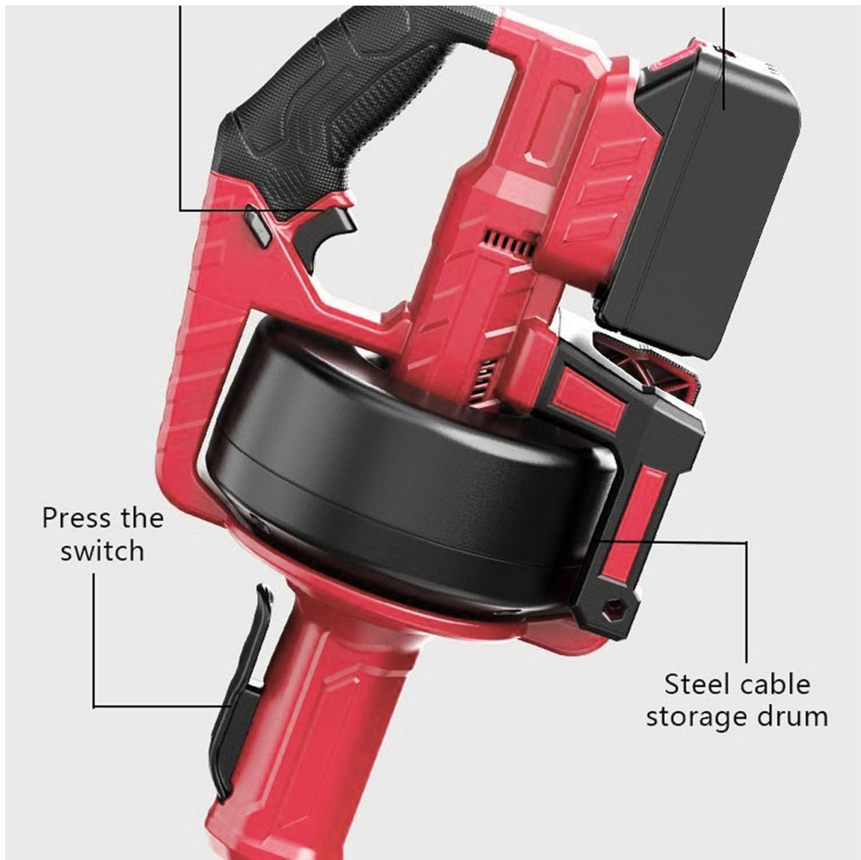
Figure 4.1: Main components of the drain auger, showing the battery slot, trigger, and steel cable storage drum.