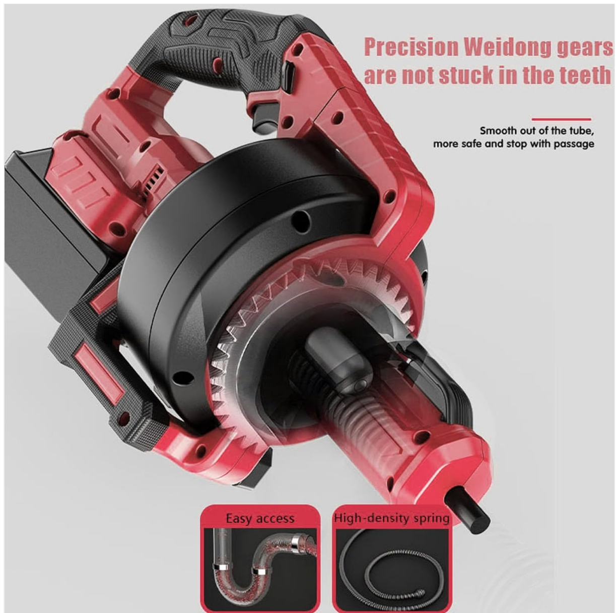
Figure 4.3: Illustration of internal mechanisms and cable flexibility for navigating P-traps.