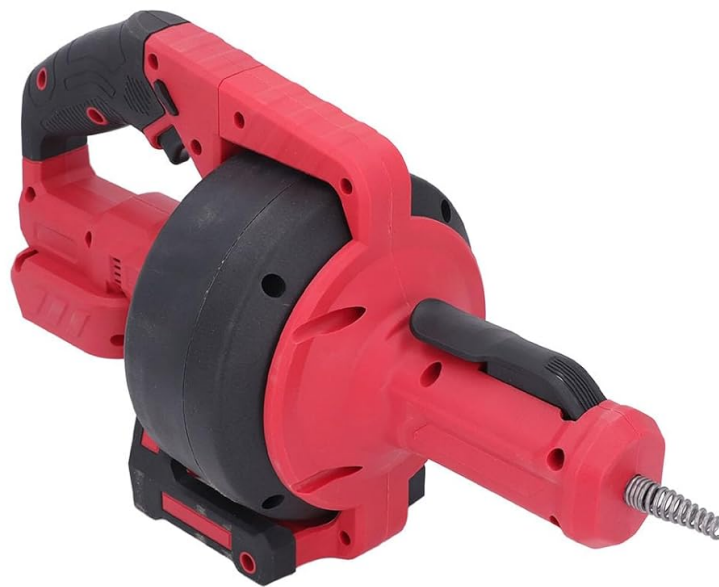
Figure 6.2: Close-up of the drain auger being used for pipe cleaning.