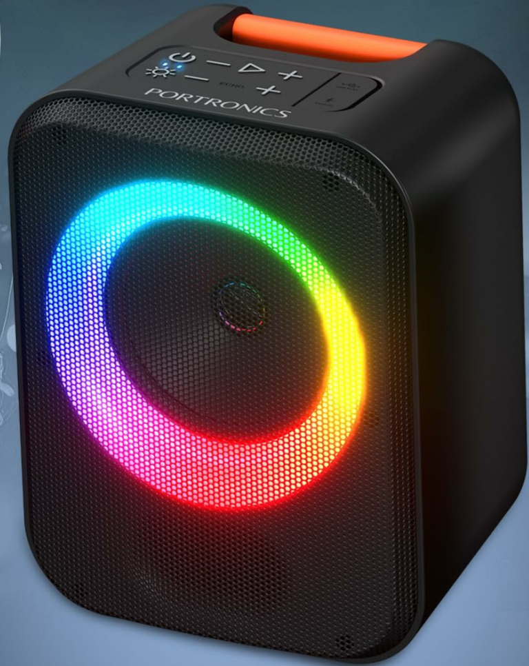
The Portronics Dash speaker featuring its compact design, RGB LED ring, and integrated handle.