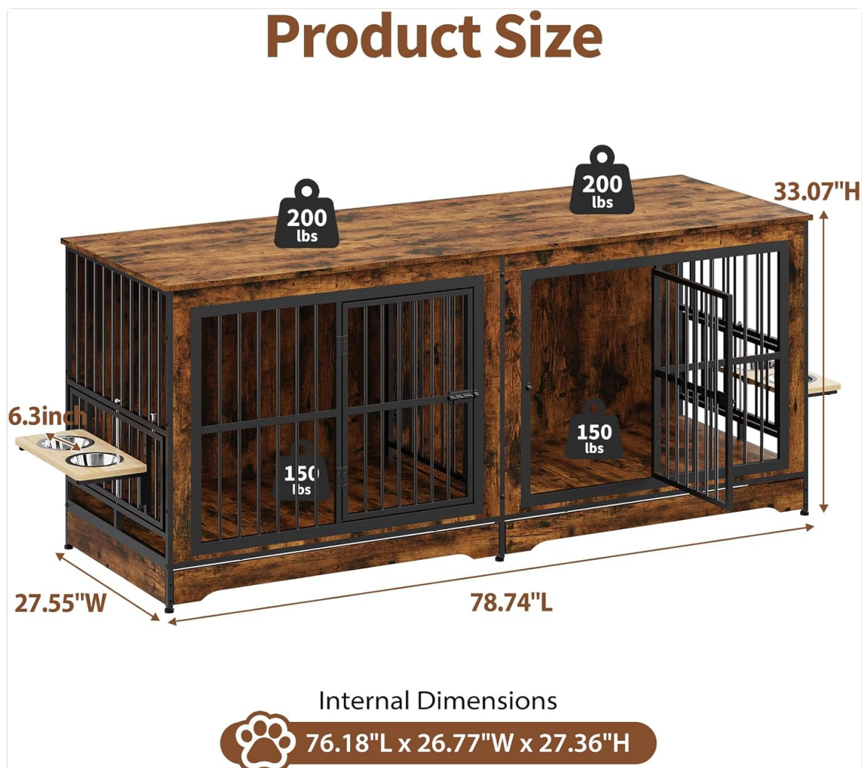
Figure 1: Product Dimensions and Weight Capacities. This image displays the overall dimensions of the assembled crate furniture and highlights the weight limits for the top surface (200 lbs) and the internal frame (150 lbs).

Assembly typically requires two adults and may take several hours. Follow the included printed assembly instructions for detailed, step-by-step guidance. The following images illustrate key features and components during assembly.