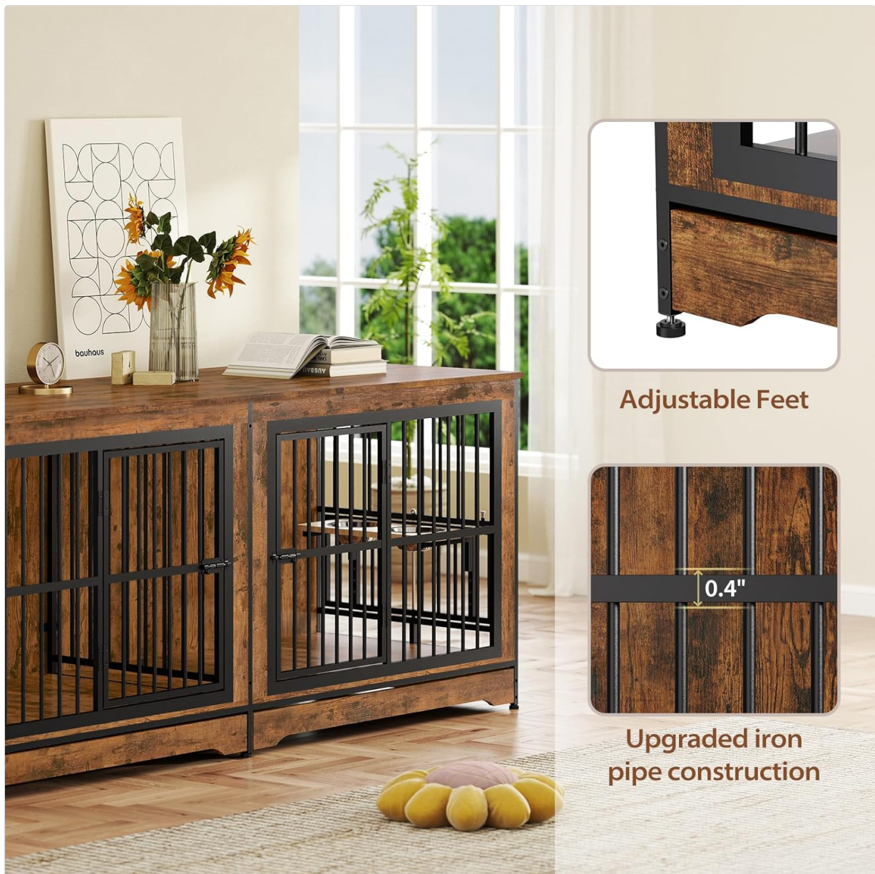
Figure 4: Adjustable Feet and Construction Details. This image provides a close-up of one of the adjustable feet, designed for stability on uneven surfaces, and showcases the robust 0.4-inch thick iron pipe construction.