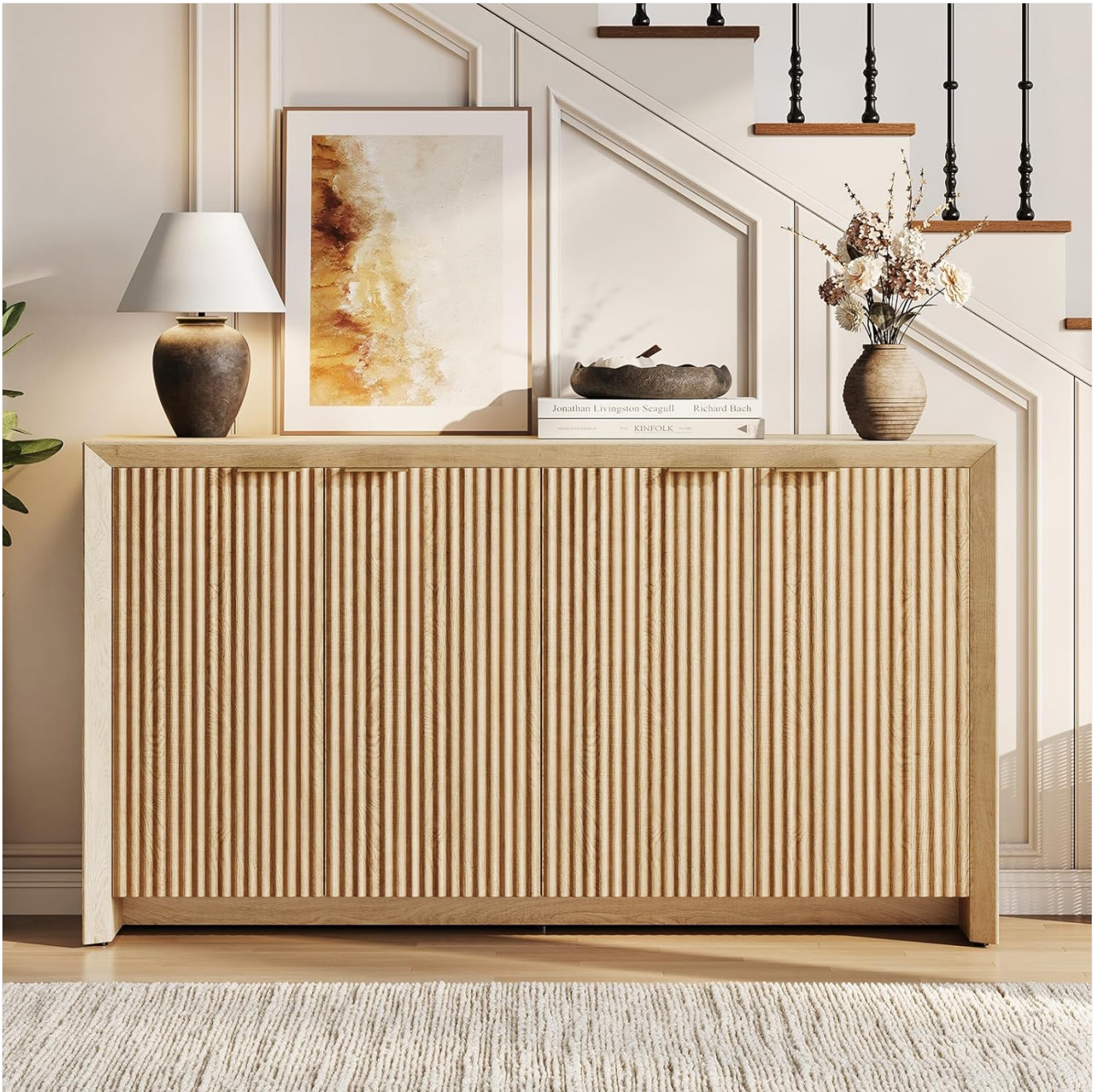
Image Description: A close-up view highlighting the modern waveform fluted panel design of the cabinet doors.