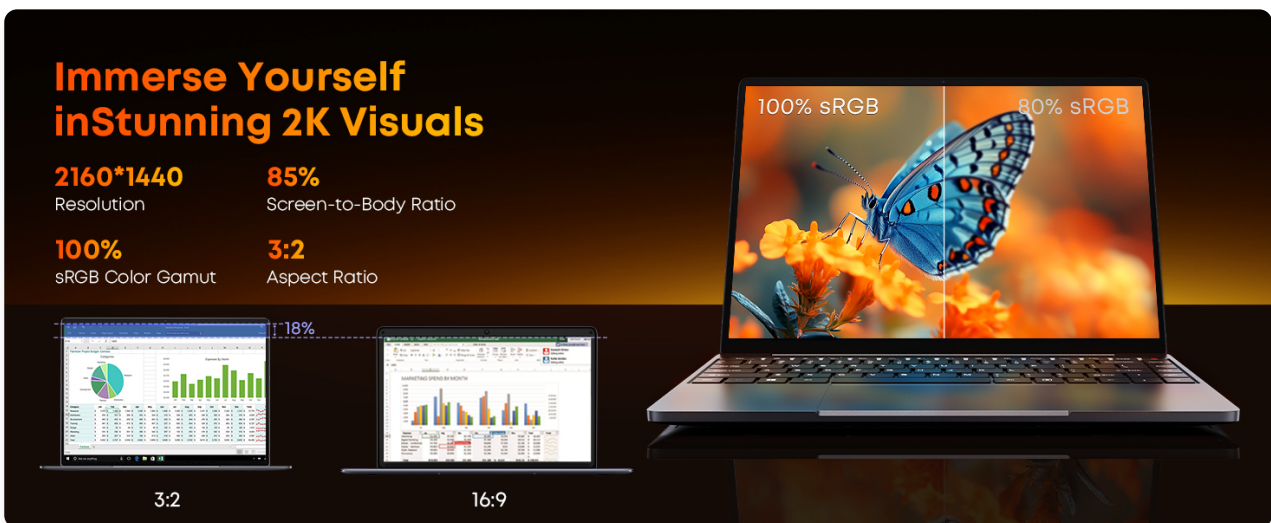
Image: The laptop's 14-inch 2K IPS display showcasing vibrant colors and a comparison of 3:2 and 16:9 aspect ratios.