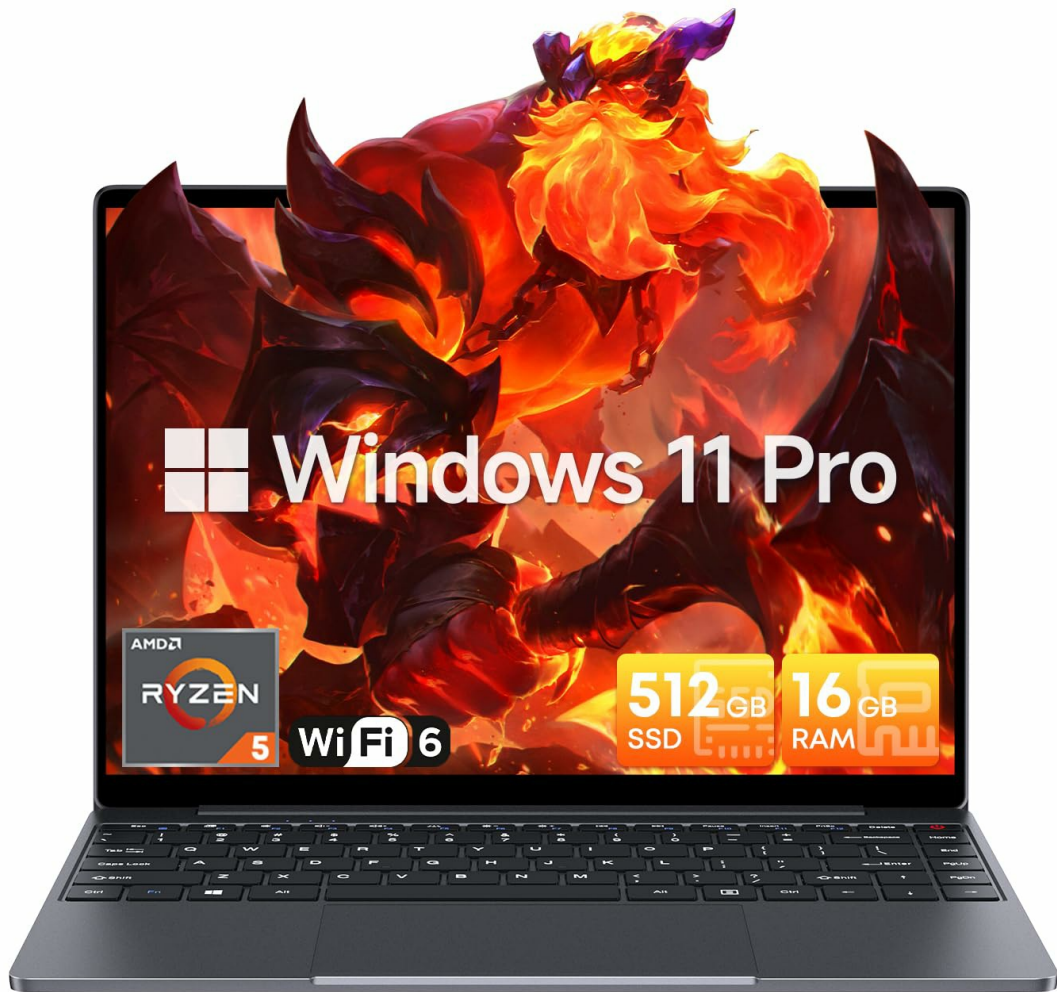
Image: The CHUWI CoreBook X laptop open on a desk, ready for use.