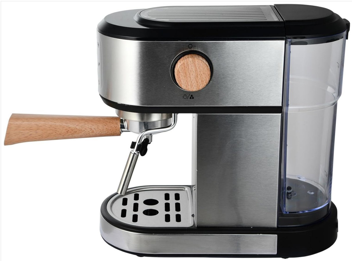
Figure 1: Front view of the Bergner LOVERS Espresso Coffee Maker, showcasing its stainless steel finish, control knob, portafilter, and transparent water tank.