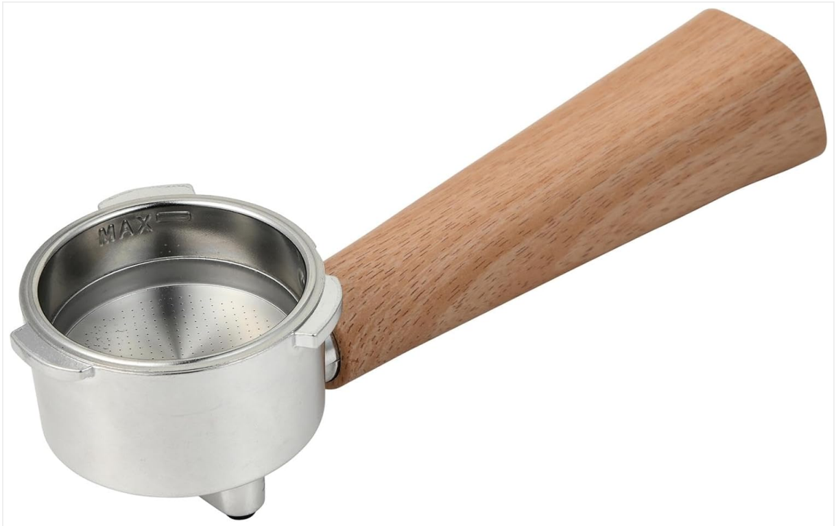
Figure 3: The portafilter with a wooden handle and an inserted stainless steel filter basket, ready for coffee grounds.