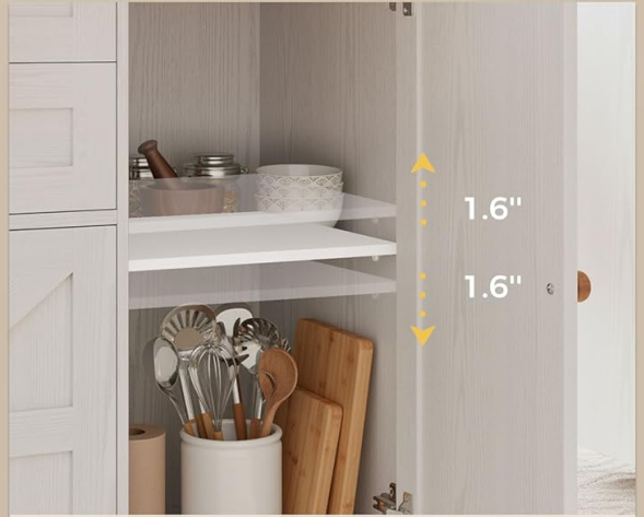
Side Cabinet with Adjustable Shelf