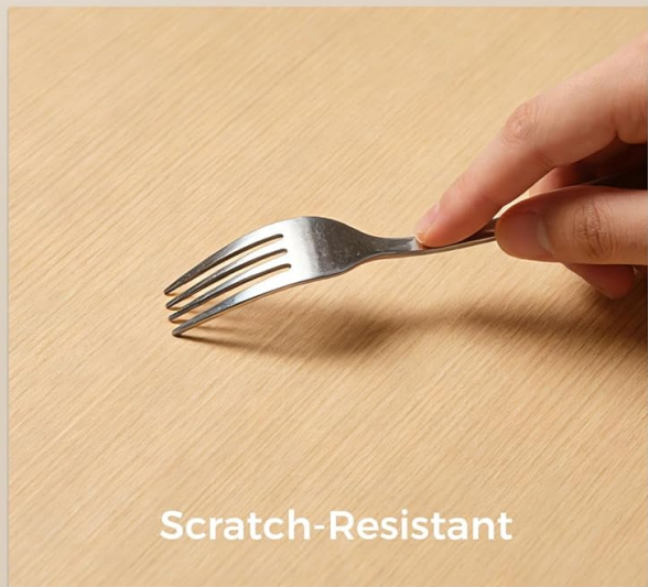
Image: Close-up showing the easy-to-clean and scratch-resistant surface of the tabletop.