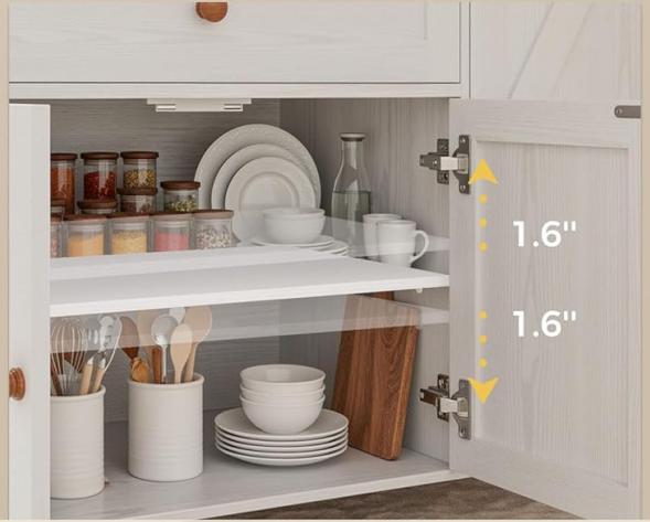
Storage Cabinet with Adjustable Shelf