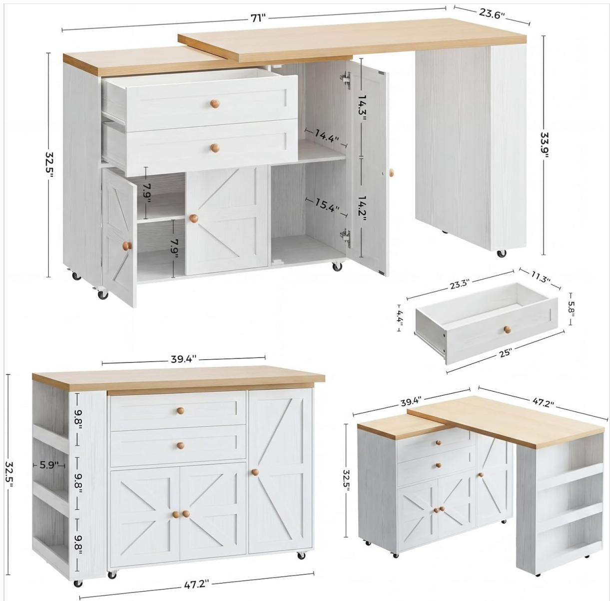
Image: Detailed dimensions and component breakdown of the kitchen island.