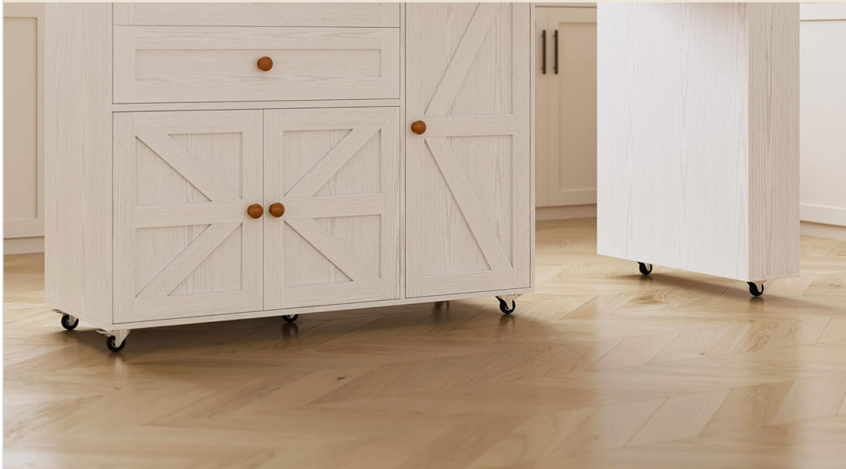
Image: Illustration of the 360° rotating and lockable wheels for convenient and flexible movement.