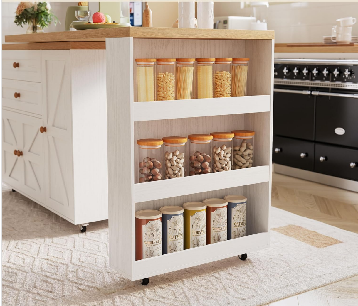
Image: The additional 3-tier side open storage shelf for spices and other items.

Can hold spice bottles, beverage bottles, snack , etc.