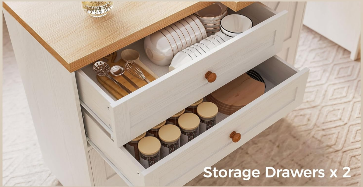
Storage Drawers x 2