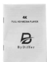
1 x User Manual

Image: Overview of the media player's connection ports.