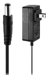
1 x DC Adapter