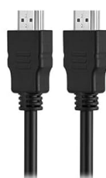
1 x HDMI Cable