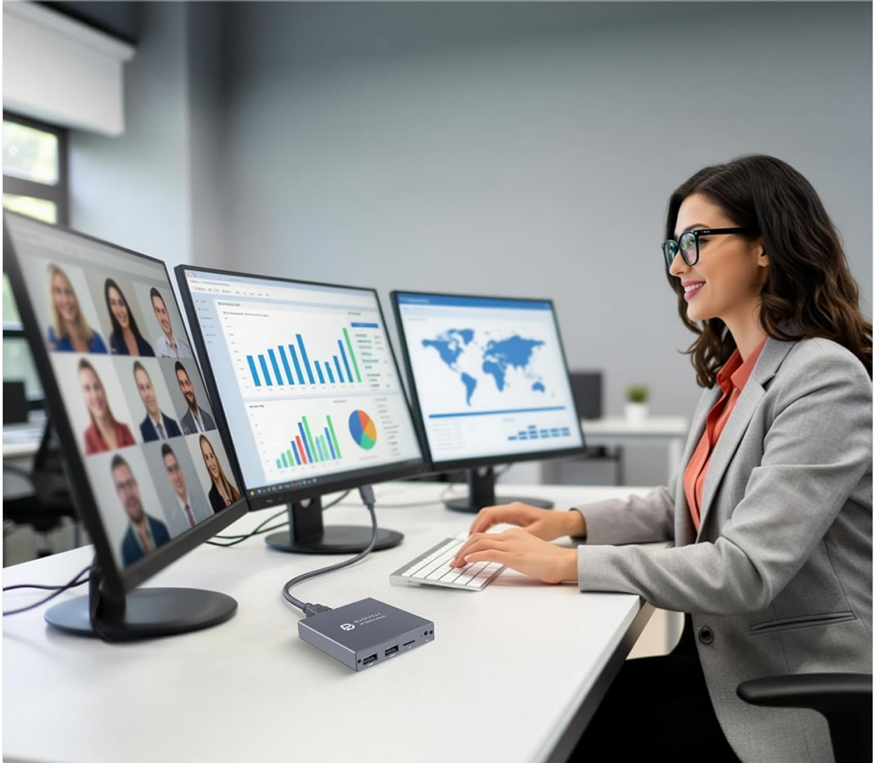
Image: The media player connected to a display, showing its capability to play various media types.