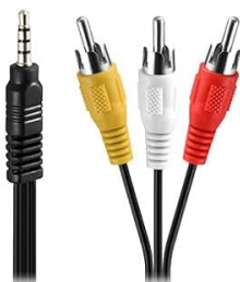
1 x RCA Cable