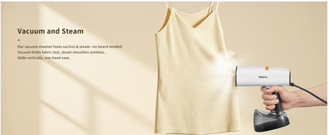
Image: The Reemix Vacuum Steamer in use, illustrating its combined vacuum and steam function for wrinkle removal.

Our vacuum steamer fuses suction & steam—no board needed! Vacuum holds fabric taut, steam smoothes wrinkles. Glide vertically, one-hand ease.