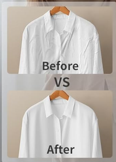
Image: A visual comparison of a wrinkled shirt (Before) and a smoothed shirt (After) using the Reemix Vacuum Steamer.