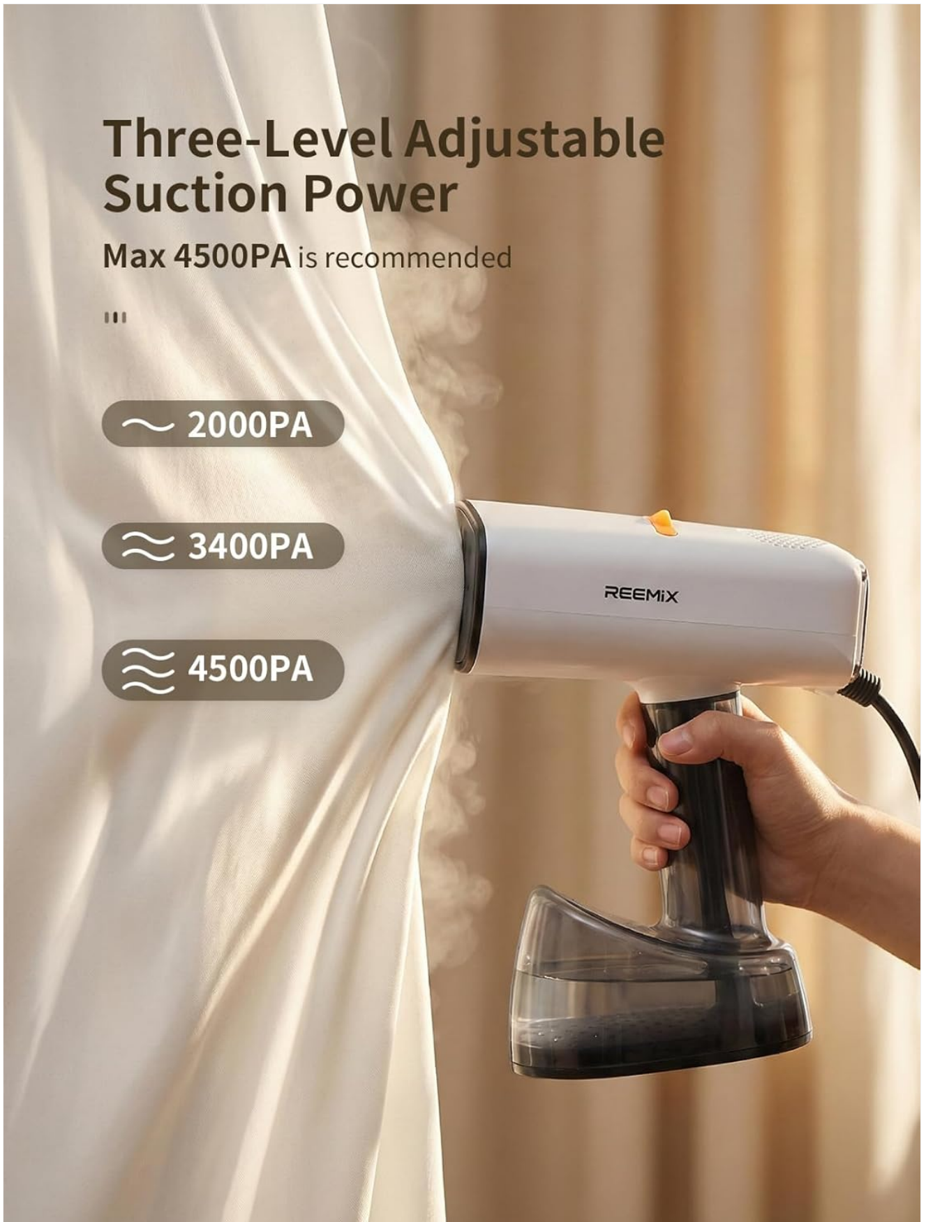
Image: The Reemix Vacuum Steamer highlighting its three-level adjustable suction power, ranging from 2000Pa to 4500Pa.