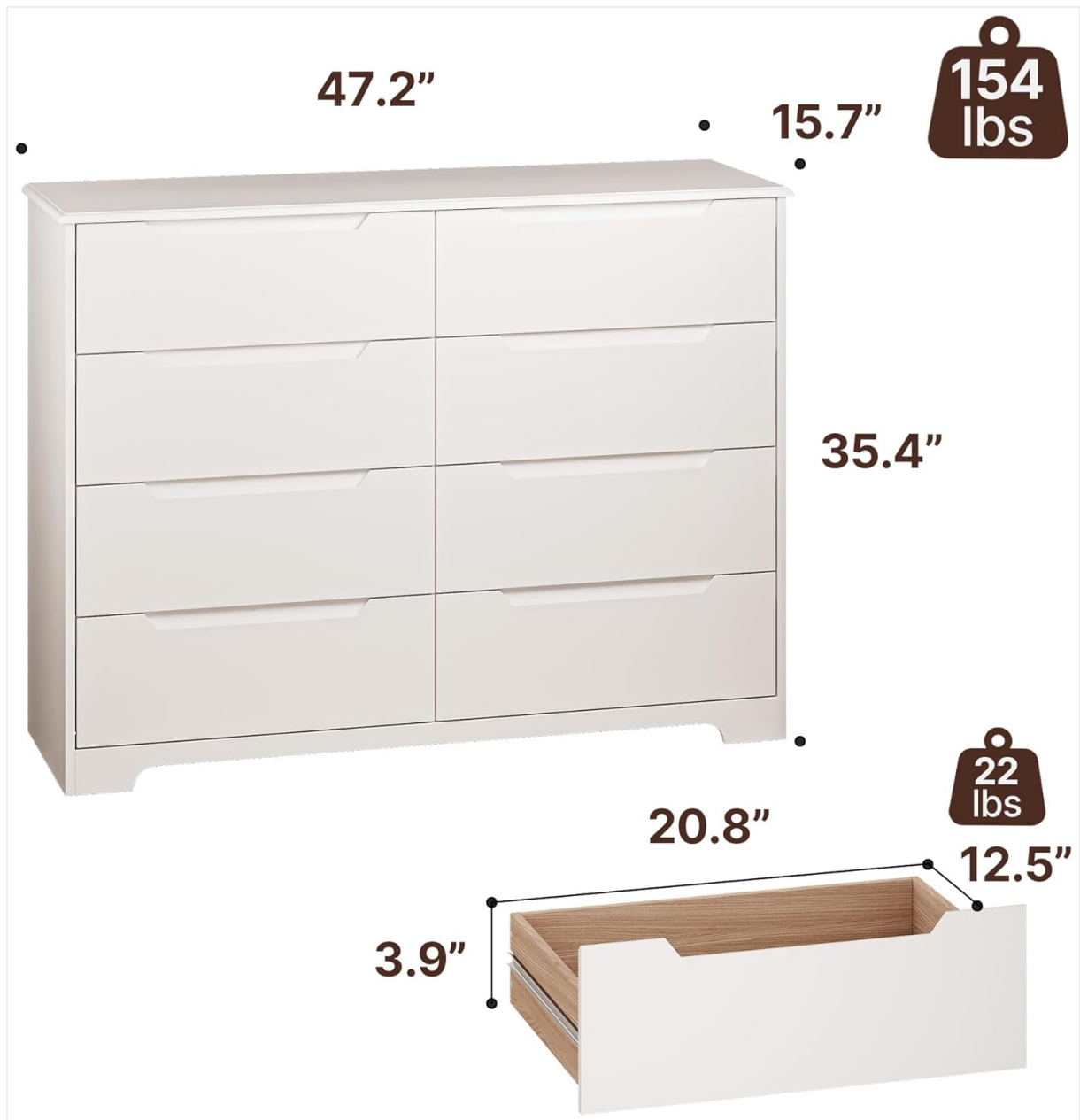
Image: Product Dimensions. This diagram illustrates the overall dimensions of the dresser and the internal dimensions of a single drawer, along with weight capacities for the tabletop and drawers.