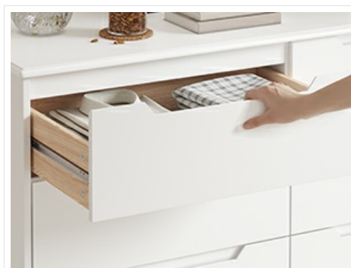
Image: Smooth Sliding Drawers. This image highlights the smooth gliding mechanism of the dresser drawers.

Image: Spacious Tabletop & Smooth Sliding Drawers. This image shows the ample surface area of the dresser top and demonstrates the smooth operation of a partially opened drawer.