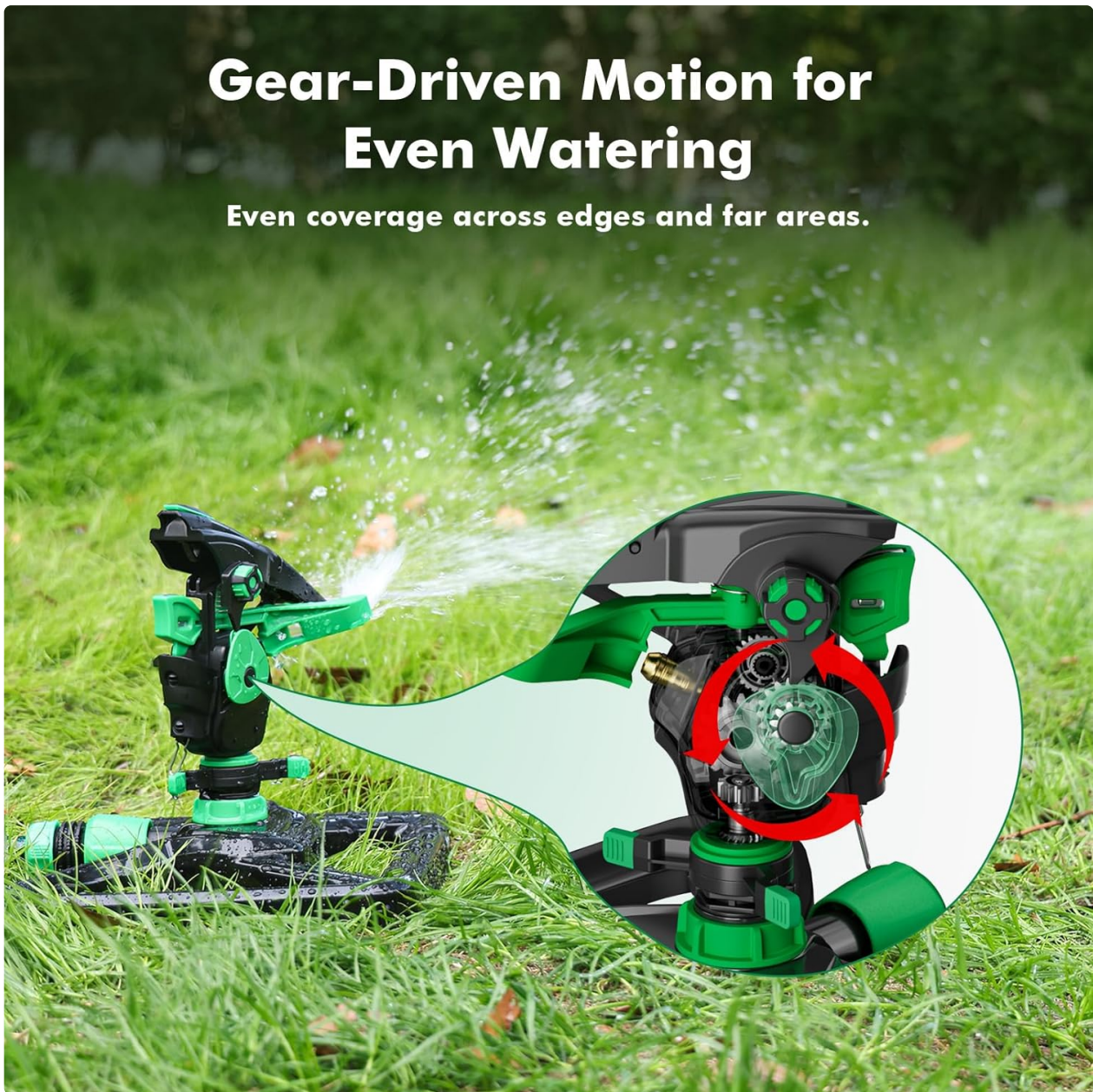
Image: The RESTMO Pulsating Sprinkler in operation, showcasing its gear-driven motion for even water distribution across the lawn.