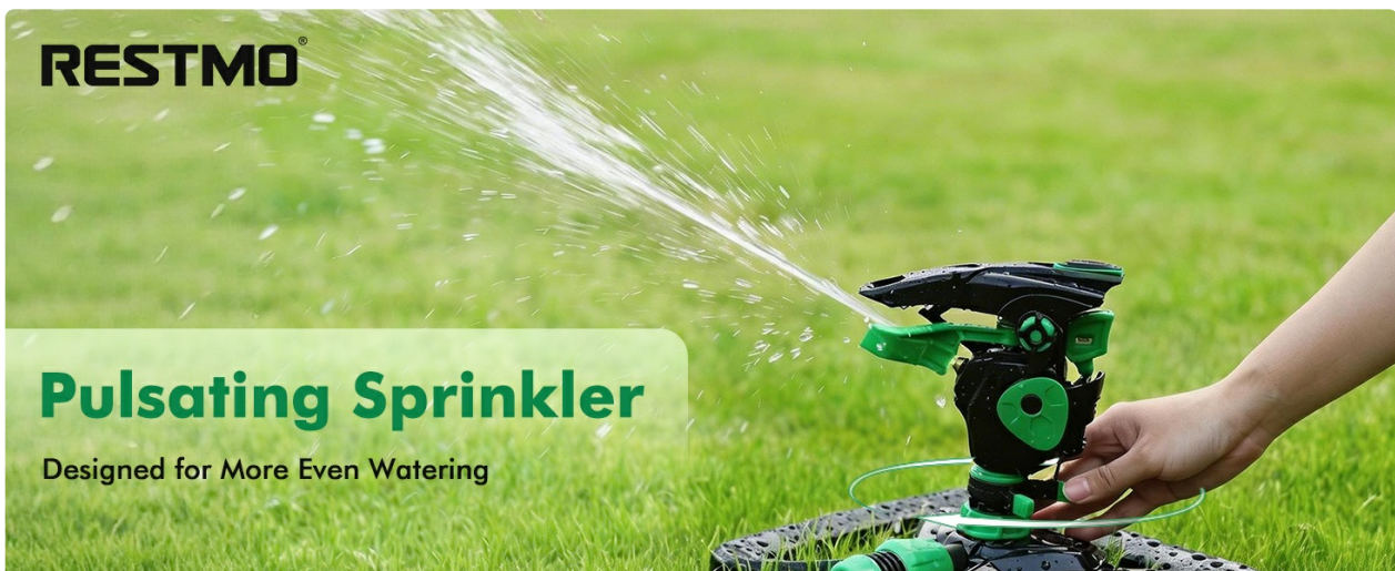
Image: RESTMO Pulsating Sprinkler demonstrating 360-degree rotation and even watering coverage.

This manual provides detailed instructions for the safe and efficient use of your RESTMO Heavy Duty Pulsating Sprinkler, Model O-LS-13-GN. This high-performance sprinkler is designed for watering large lawns, gardens, and yards, offering extensive coverage and precise control. Please read this manual thoroughly before initial setup and operation to ensure optimal performance and longevity of your product.