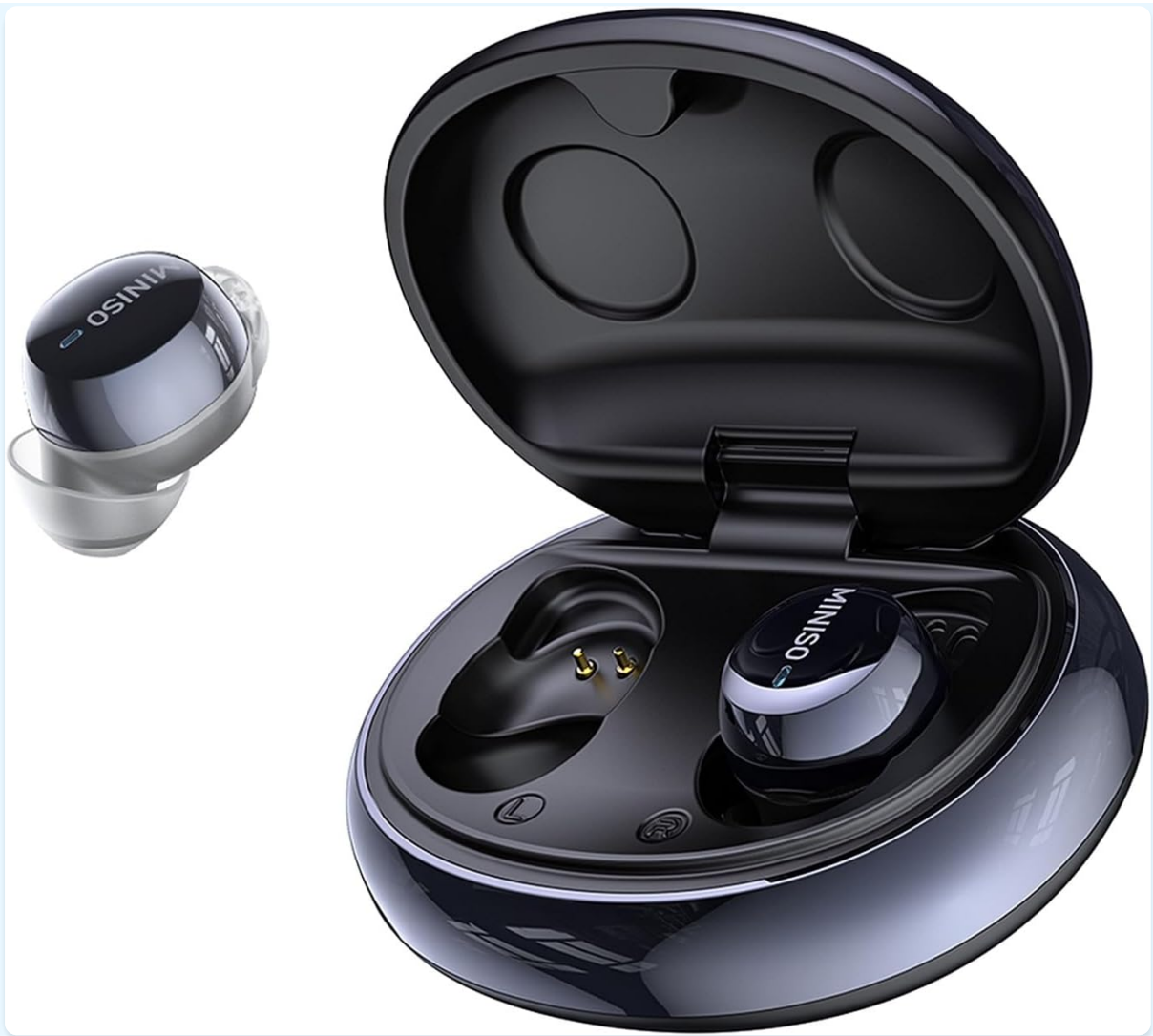
Figure 1.1: MINISO MS216 Sleep Earbuds and Charging Case.