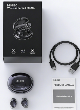
Figure 8.1: Product packaging and included manual.