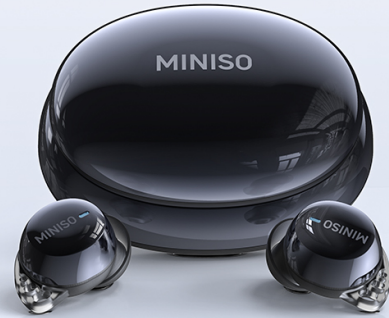
Figure 2.1: Ergonomic design and lightweight construction for comfortable sleep.