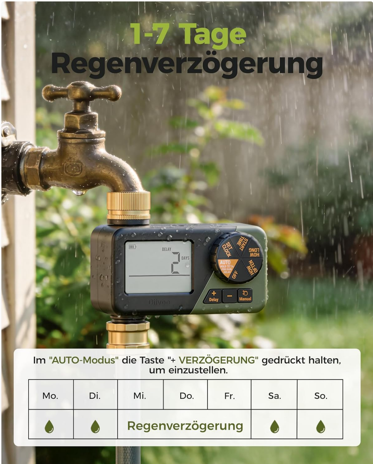
Image: The timer's display showing a 2-day rain delay activated, with raindrops visible on the screen, indicating the function is active.