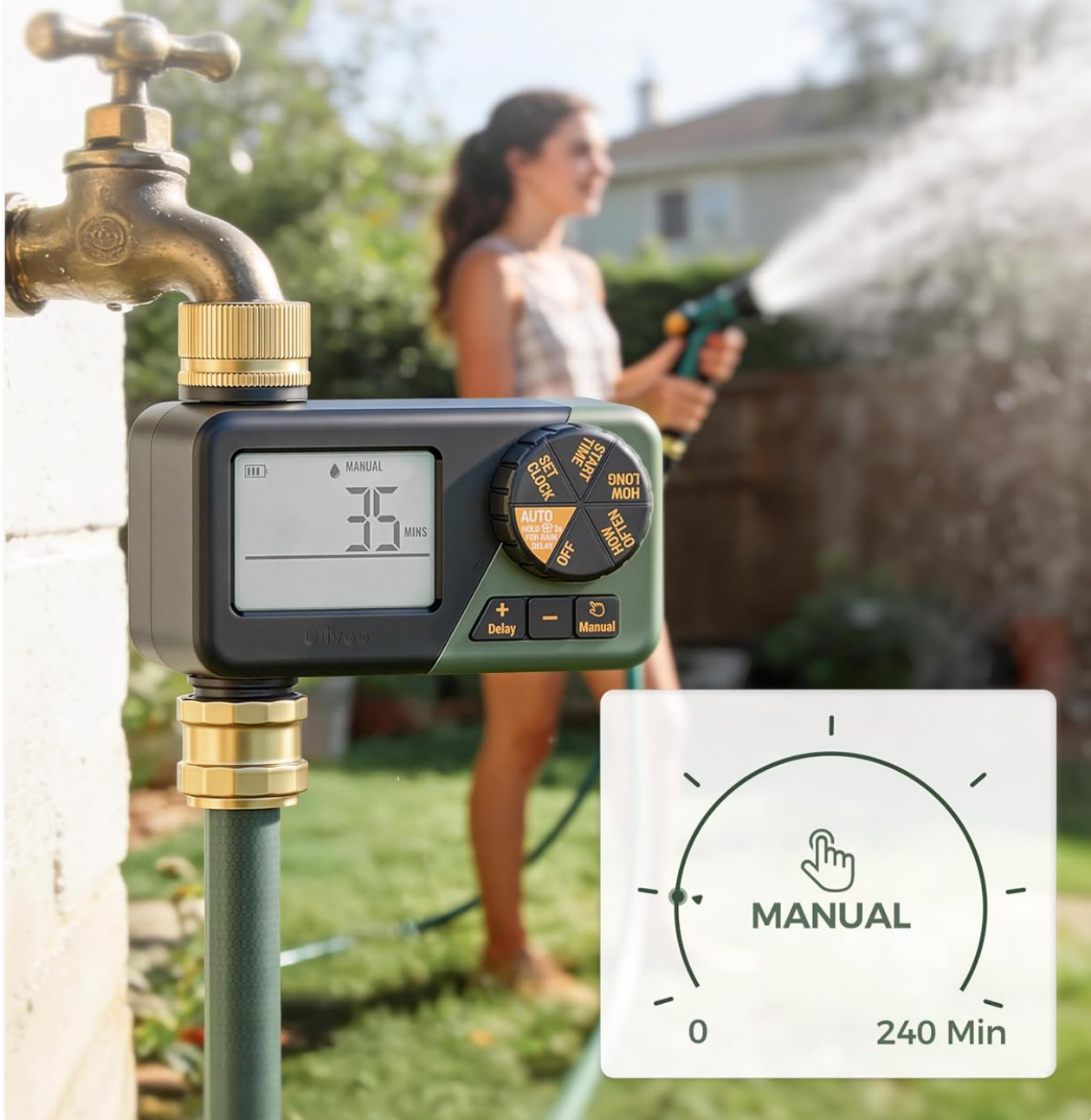
Image: The timer's display showing the manual watering setting, with a person watering a garden in the background.

Without interrupting the preset watering program