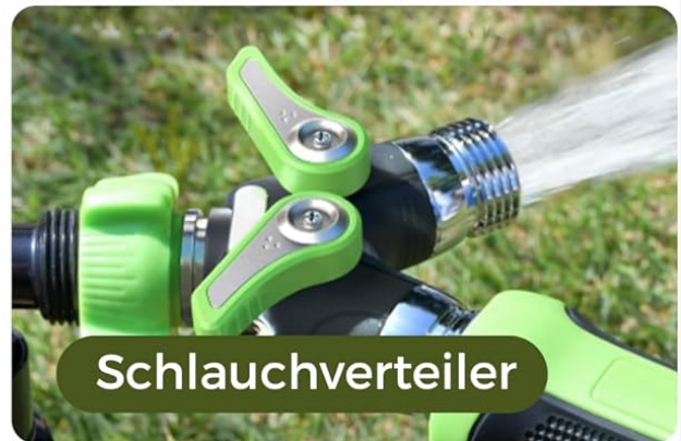
Image: Various applications of the Diivoo watering timer, including use with lawn sprinklers, drip irrigation systems, and garden hoses.