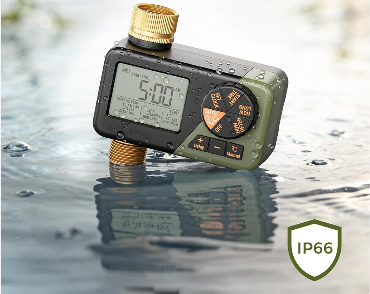
Image: The Diivoo Automatic Watering Timer, showcasing its large LCD display and robust construction.

Voll funktionsfähig nach 24 Stunden in 15 cm Tiefe