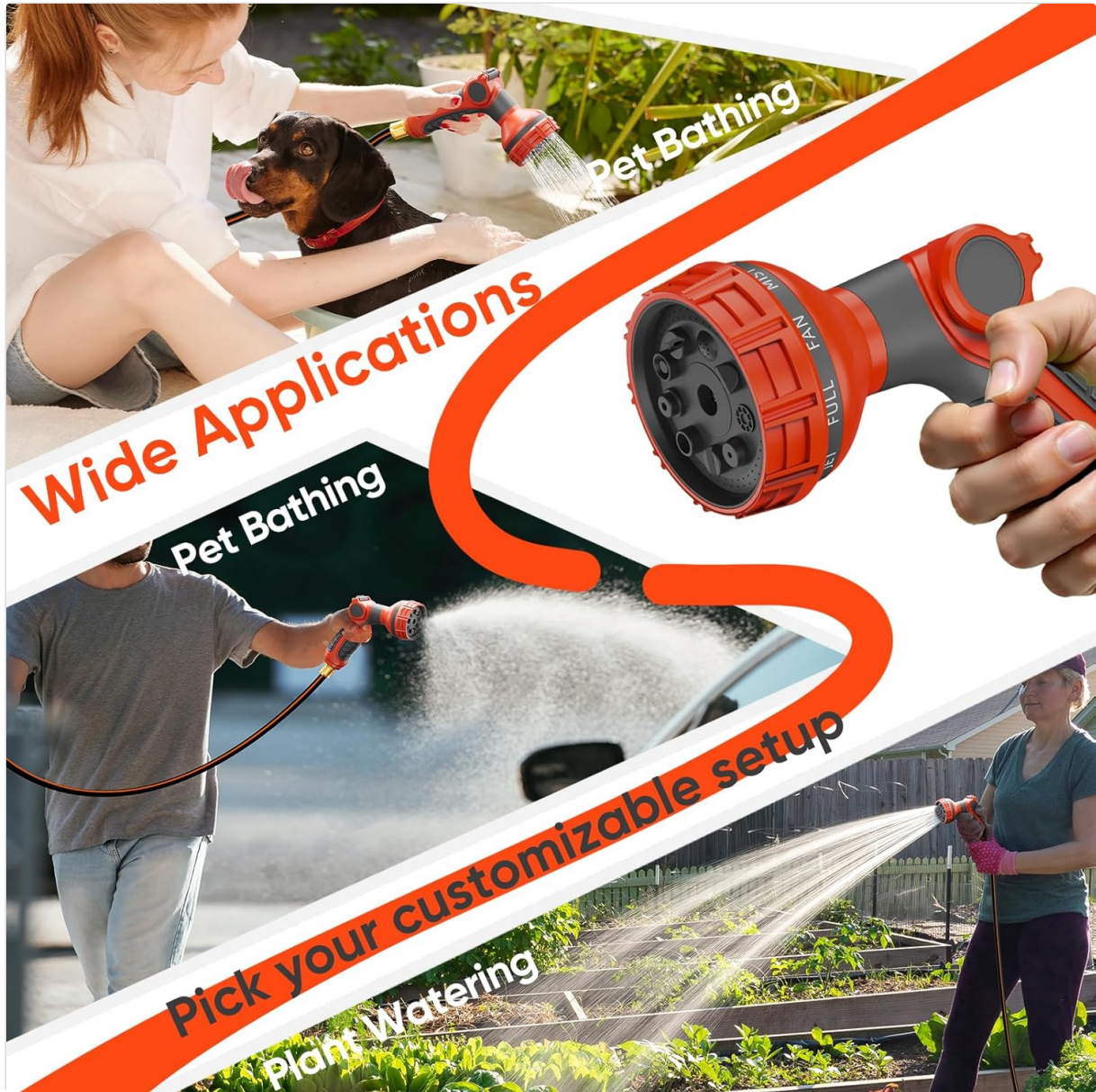
Image: A collage demonstrating the wide range of applications for the hose reel, including pet bathing, car washing, and plant watering, showcasing its versatility.