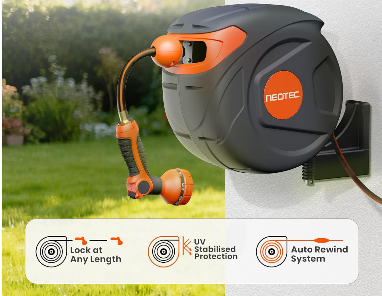
Image: The NEOTEC Retractable Garden Hose Reel, highlighting its key features: the ability to lock the hose at any desired length, UV stabilized protection for durability, and an automatic rewind system for easy storage.