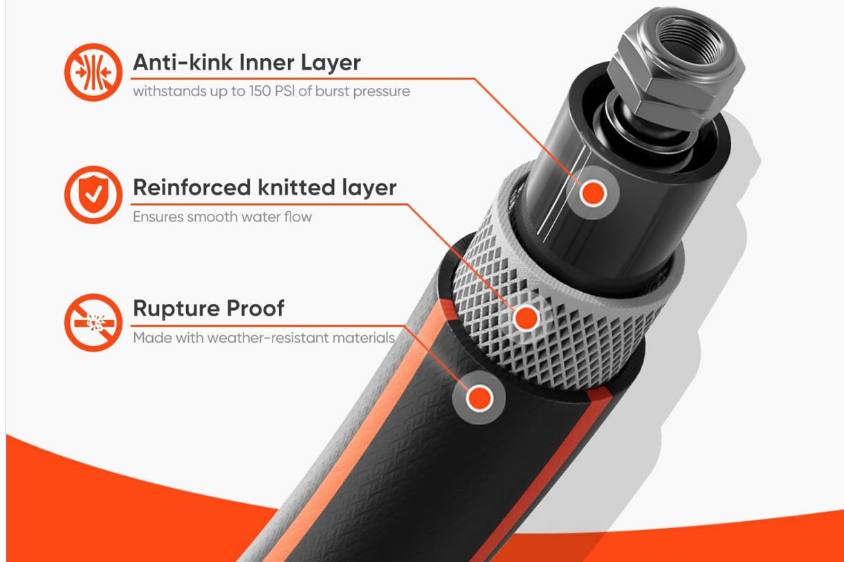
Image: A detailed diagram highlighting the triple-layer construction of the hose, featuring an anti-kink inner layer, a reinforced knitted layer for smooth water flow, and a rupture-proof outer layer made from weather-resistant materials, designed to withstand sun, rain, and frost.