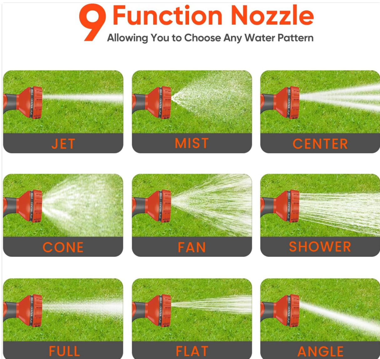
Image: A visual representation of the 9 different spray patterns available on the nozzle, including Jet, Mist, Center, Cone, Fan, Shower, Full, Flat, and Angle, allowing users to select the appropriate water flow for various tasks.

The included spray nozzle offers 9 distinct patterns for various watering tasks: