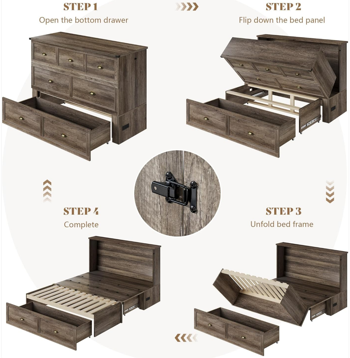
Figure 4: Visual guide for transforming the cabinet into a bed.