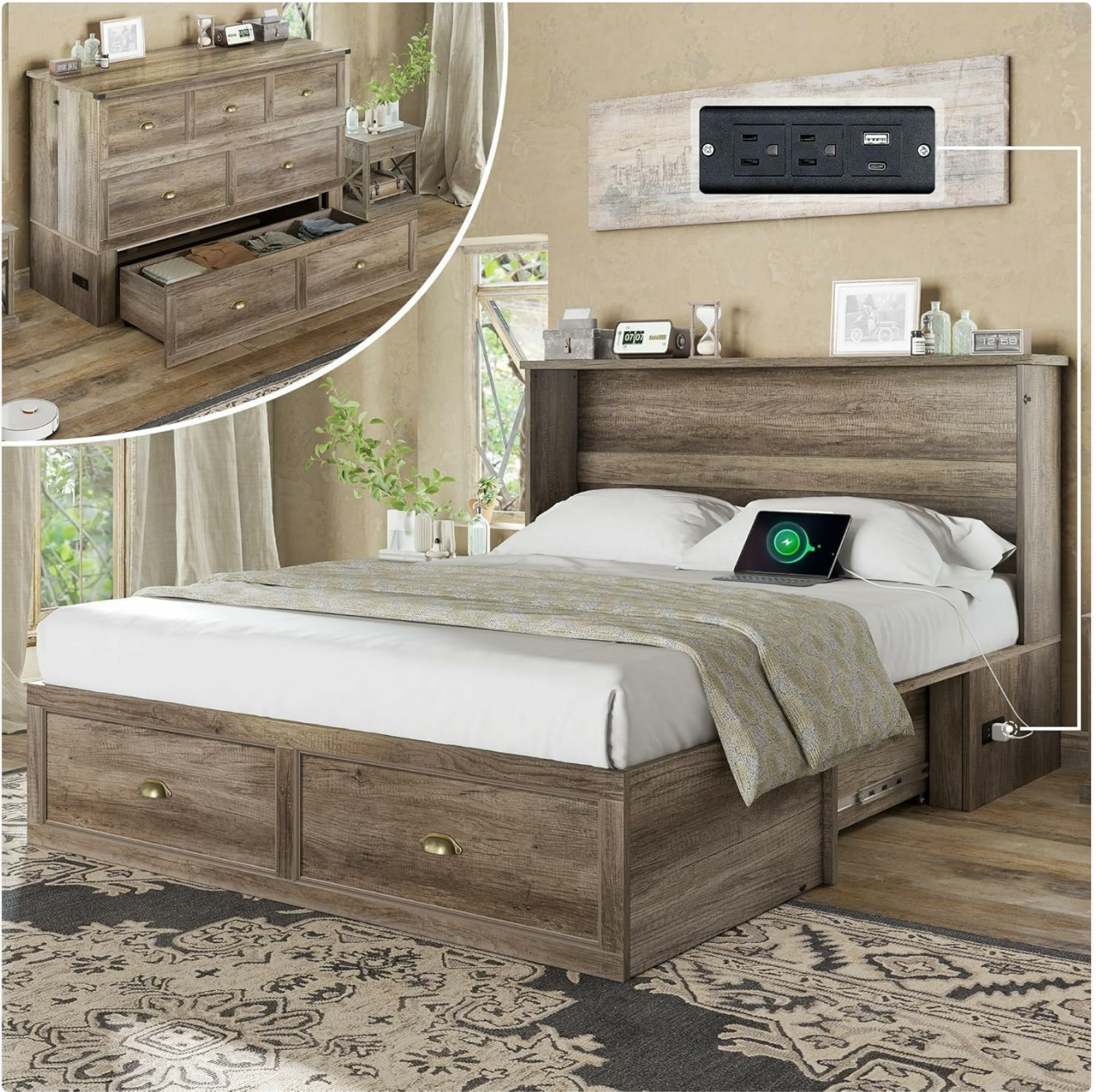
Figure 1: AMERLIFE Full Size Murphy Bed in Grey Oak, configured as a bed.