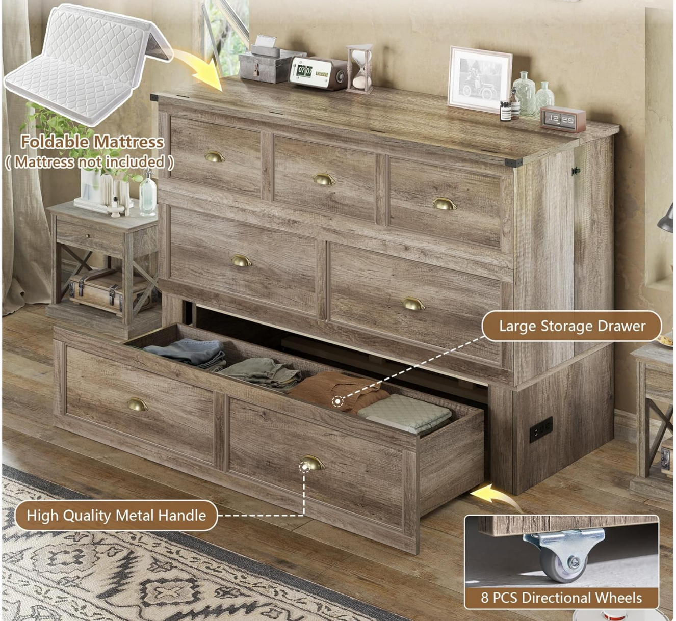
Figure 7: Spacious storage drawer for bedding and other items.