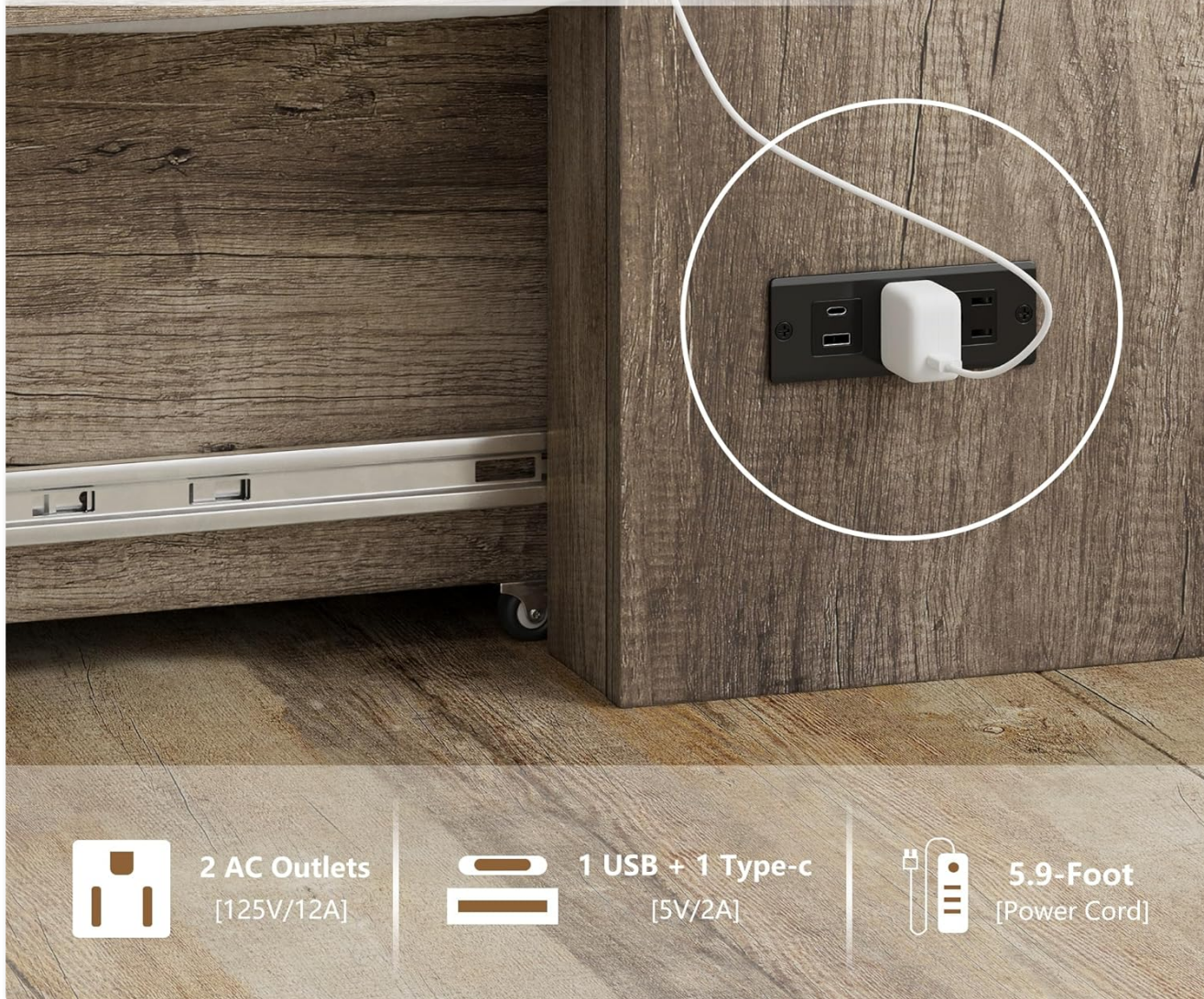
Figure 6: Built-in charging station with various ports.