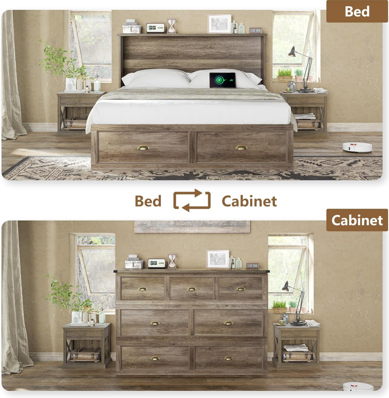
Figure 5: The AMERLIFE Murphy Bed in both bed and cabinet configurations.