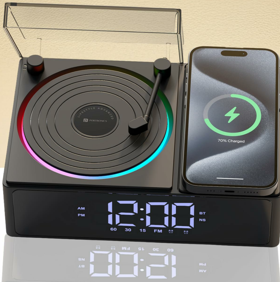
Image: The Portronics Soundflow device with its RGB LED lights illuminated, showcasing the ambient lighting feature.