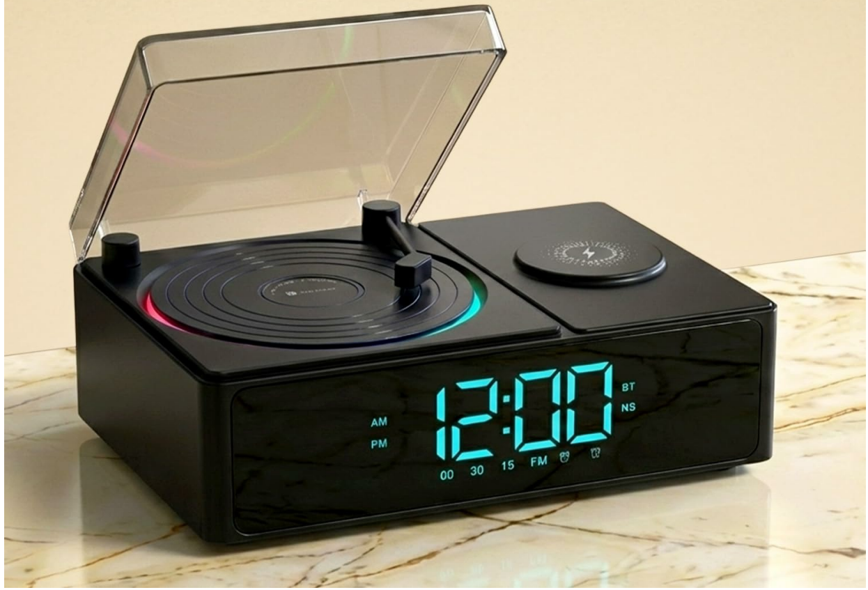
Image: The Portronics Soundflow device showcasing its 5W Bluetooth speaker functionality, with a vintage-inspired design.