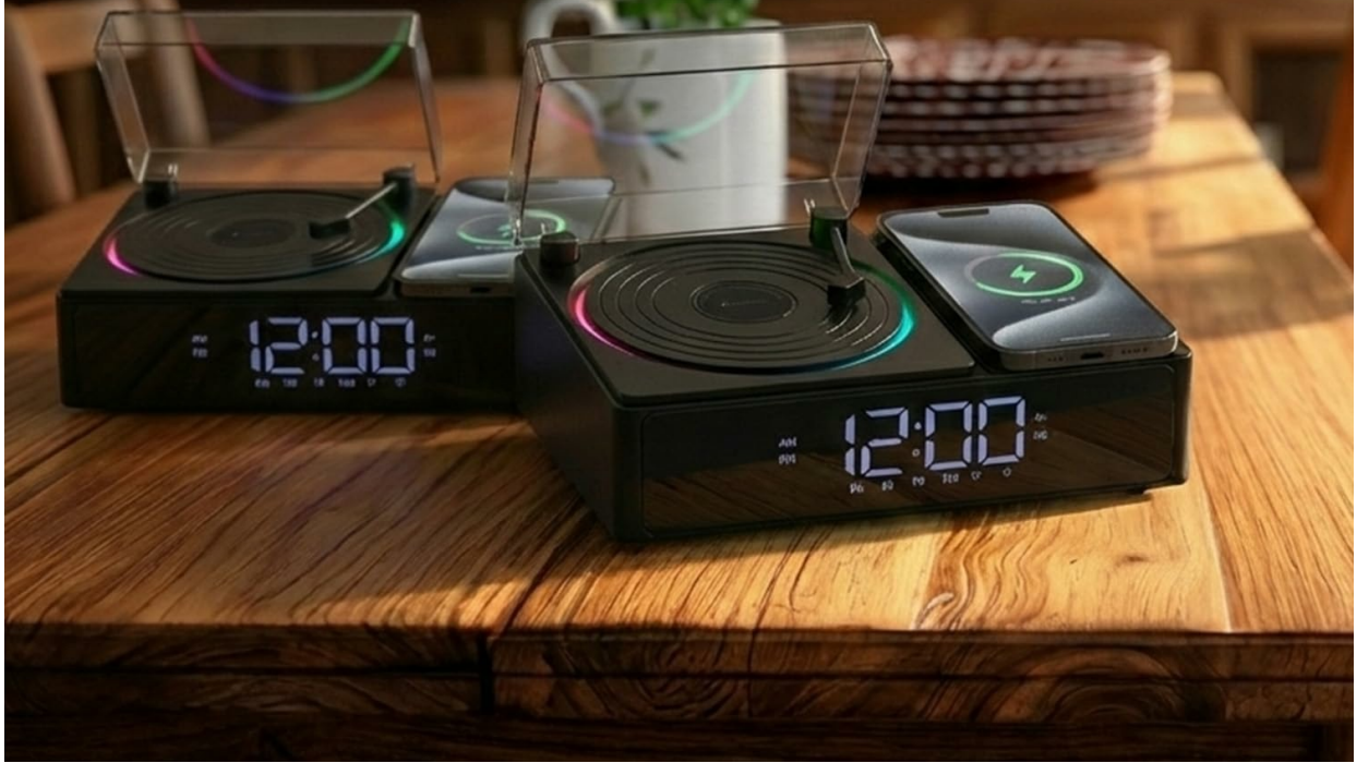
Image: Two Portronics Soundflow devices shown together, illustrating the TWS (True Wireless Stereo) mode for synchronized audio playback.