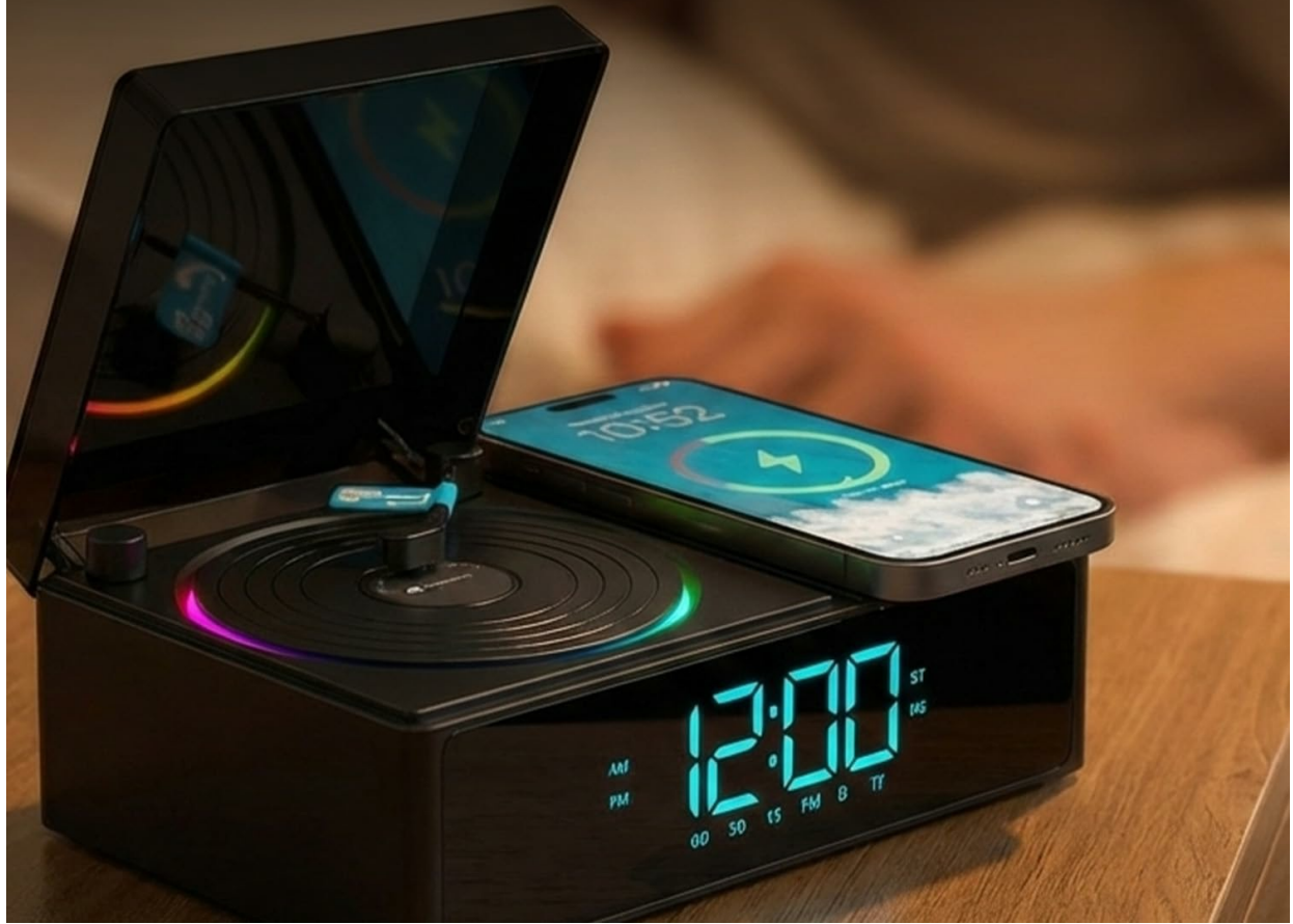
Image: The Portronics Soundflow displaying the digital clock, indicating its 12/24H format and alarm clock features.