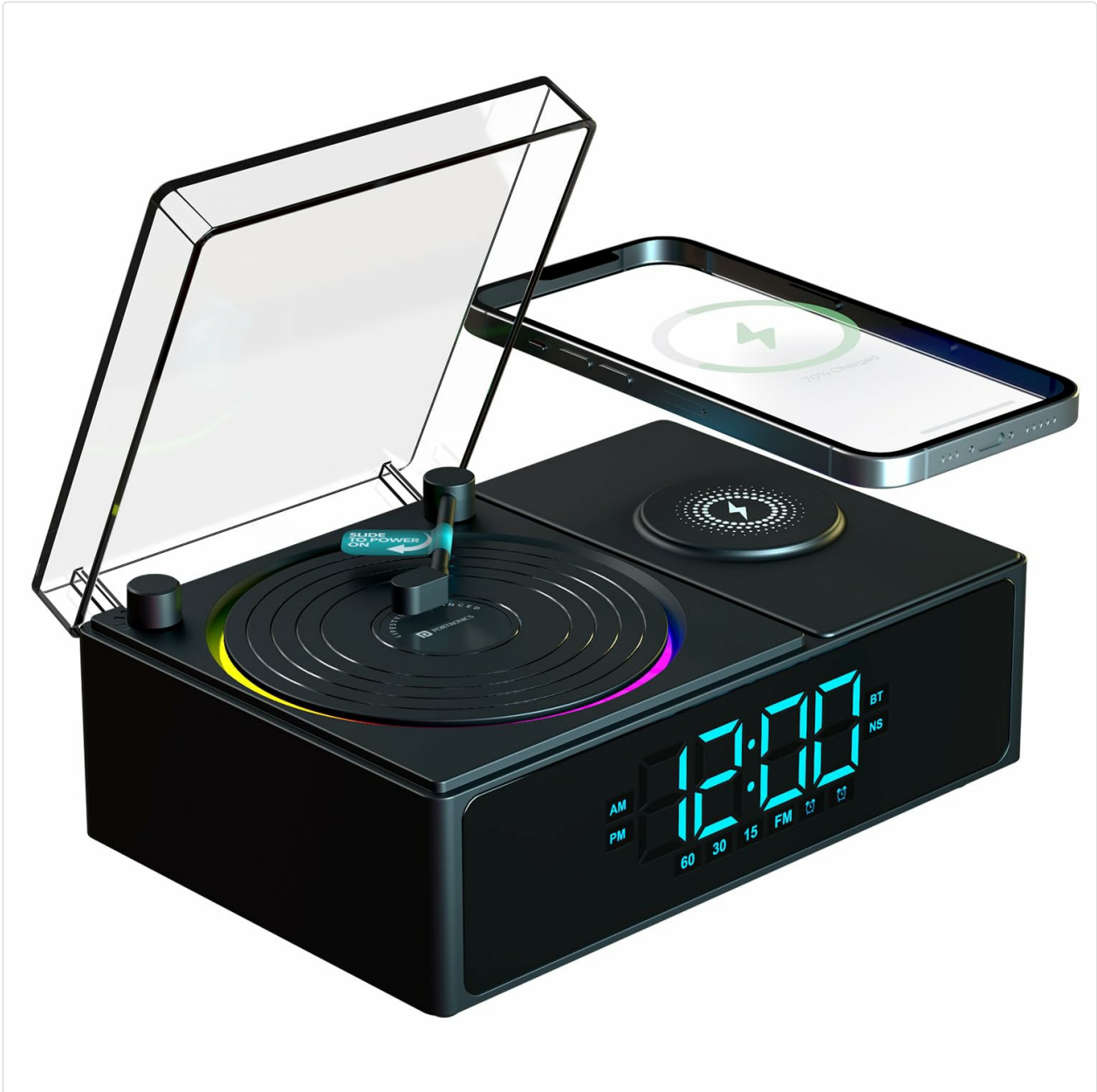
Image: Portronics Soundflow device displaying the digital clock and showing a phone wirelessly charging on the pad.

Connect the provided Type-C charging cable to the Soundflow device and a suitable power adapter. For wireless charging functionality, a 25W power adapter is required. Ensure the device is connected to power for all features to operate efficiently, especially wireless charging.