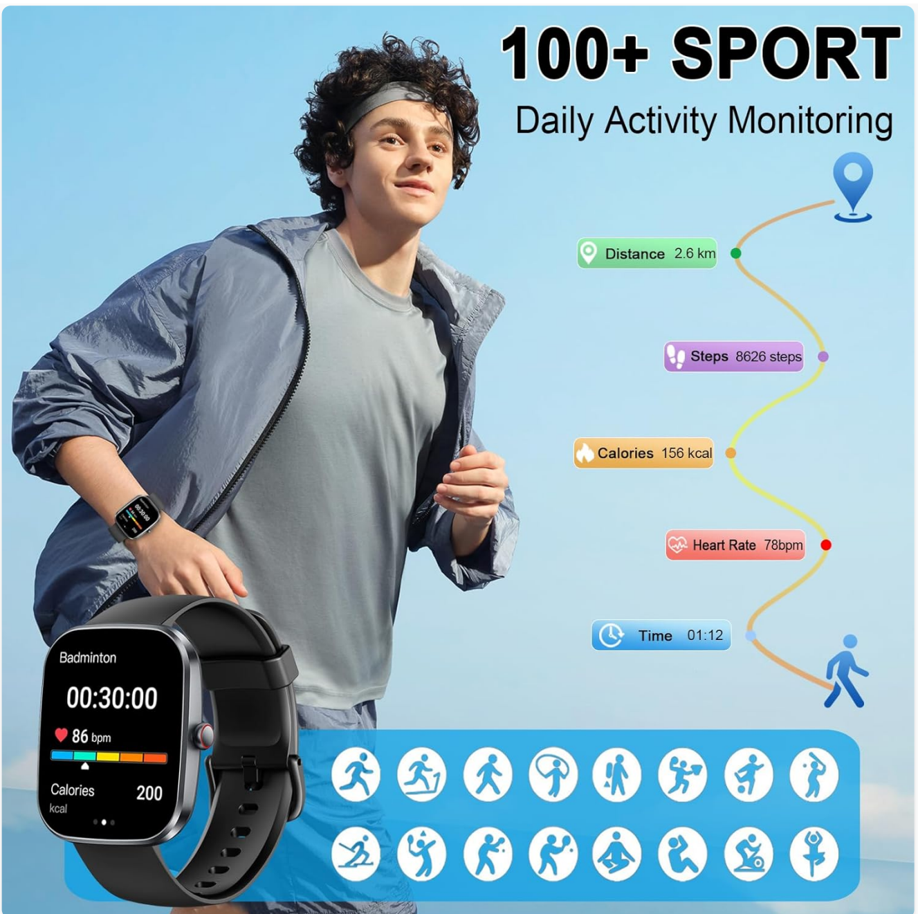
Figure 6: Sport modes and activity tracking.