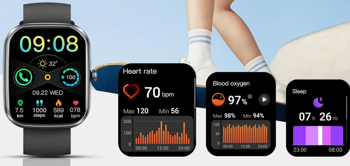
Figure 3: Bluetooth call interface on the smartwatch.

Your browser does not support the video tag.