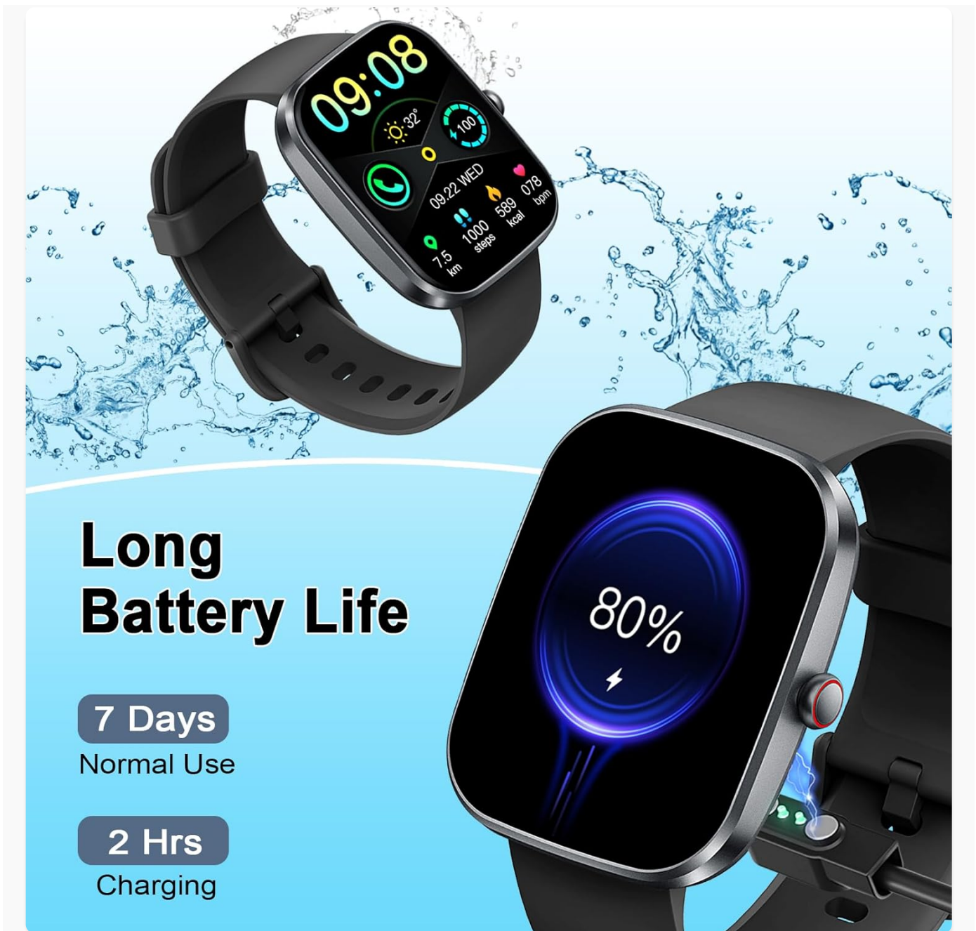
Figure 5: Health tracking features on the smartwatch.