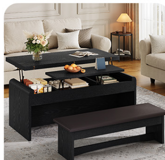
Dual-Sided Liftable Tabletops