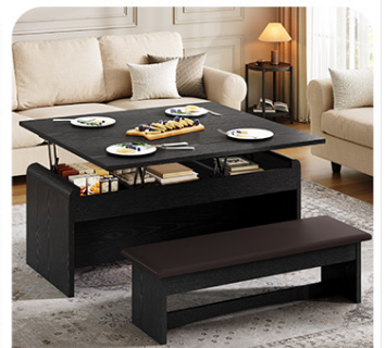
Fully Extended Top as Dining Table

The table offers versatile configurations, including regular coffee table, one-sided lift, dual-sided lift, and fully extended dining table.