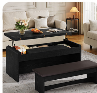
One-Sided Liftable Tabletop