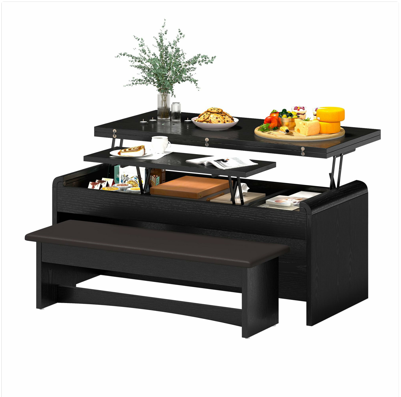
The Homiflex Coffee Table with Lift Top and Storage, shown with an accompanying bench in a living room environment.