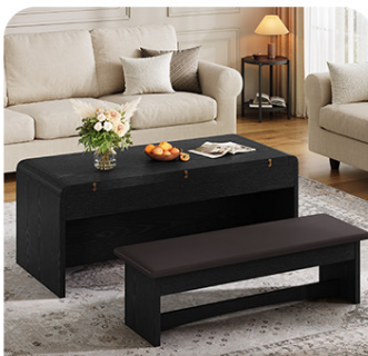
Regular Coffee Table