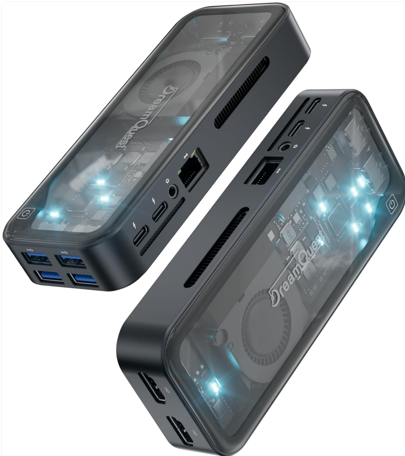
Image: The DreamQuest Mini PC's key features, including Windows 11 Pro pre-installation, Intel Alder Lake N95 CPU, 12GB DDR5 memory, 512GB M.2 SSD, WiFi 6, Bluetooth 5.3, Gigabit Ethernet, Intel UHD Graphics, and 4K HD support.

The Mini PC comes with Windows 11 Pro pre-installed, offering advanced features for productivity and security. It also supports other operating systems like Linux and Ubuntu, and features such as PXE boot, Wake On LAN, RTC Wake, and Auto Power On can be configured in the BIOS.