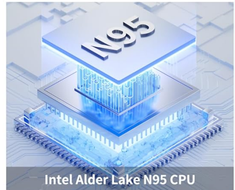
Intel Alder Lake N95 CPU