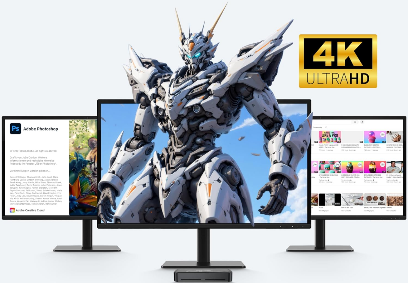
Image: The DreamQuest Mini PC demonstrating its capability to support a triple-screen display setup with 4K resolution.

Experience entertainment, creativity, and productivity with three seamless UHD displays.