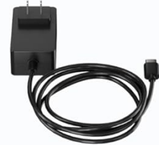
US Plug Charger

Image: A detailed view of the DreamQuest Mini PC's connectivity ports, including dual HDMI, multiple USB 3.2, dual full-function USB-C, and a Gigabit Ethernet port.