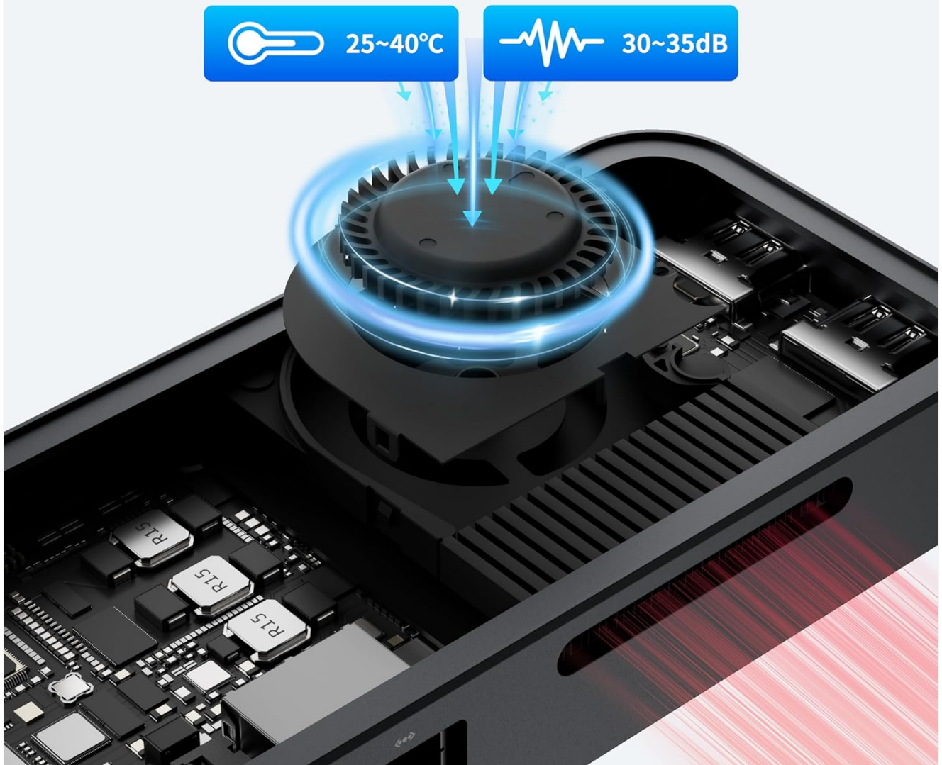
Image: An internal diagram of the DreamQuest Mini PC illustrating its smart fan cooling system, which operates quietly between 30-35dB and maintains CPU temperature between 25-40°C.

Built-in smart fan, intelligently identifies CPU temperature and switches the fan