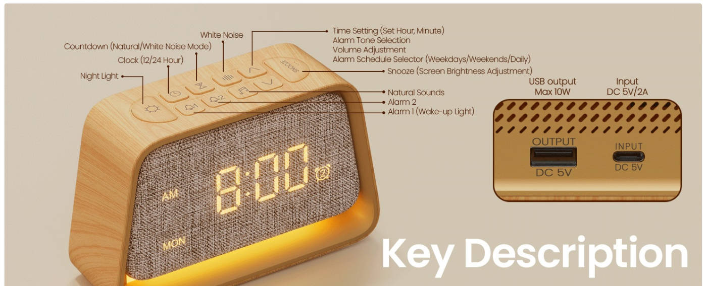
Image: Diagram illustrating the control buttons and ports on the blonbar AJ380 alarm clock, including the DC 5V input and USB output for charging.