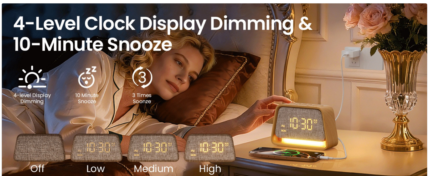
Image: Demonstrates the 4-level clock display dimming and 10-minute snooze function, with a woman reaching for the clock.

When an alarm sounds, press the SNOOZE button to temporarily silence the alarm for 10 minutes. You can typically use the snooze function multiple times.