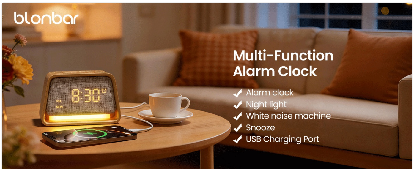
Image: The blonbar AJ380 Multifunction Alarm Clock, highlighting its all-in-one features including USB charging, dual alarms, white noise, natural sounds, countdown timer, 12/24H format, and wake-up light. The clock is shown on a bedside table, charging a smartphone.

The blonbar AJ380 Multifunction Alarm Clock is designed to simplify your bedside experience by combining an alarm clock, night light, and sound machine into one elegant device. Its modern design with a wood grain finish makes it a suitable addition to any bedroom or child's room. This manual provides detailed instructions for setting up and operating your device.