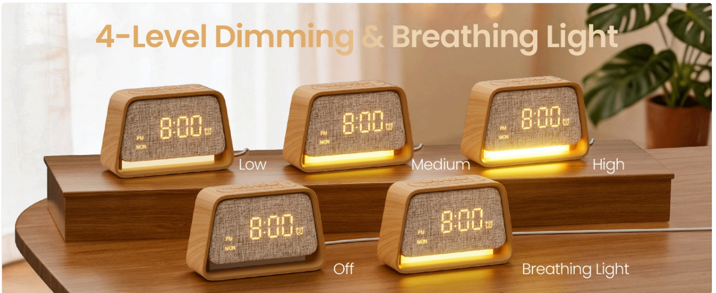
Image: Demonstrates the 4-level dimming and breathing light feature of the alarm clock, showing various brightness settings from off to high and a breathing light effect.