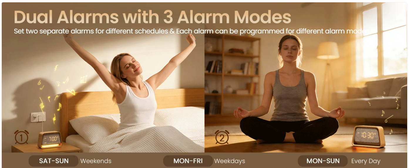
Image: Illustration of the dual alarm feature with three modes: Weekends, Weekdays, and Every Day, showing different morning routines.