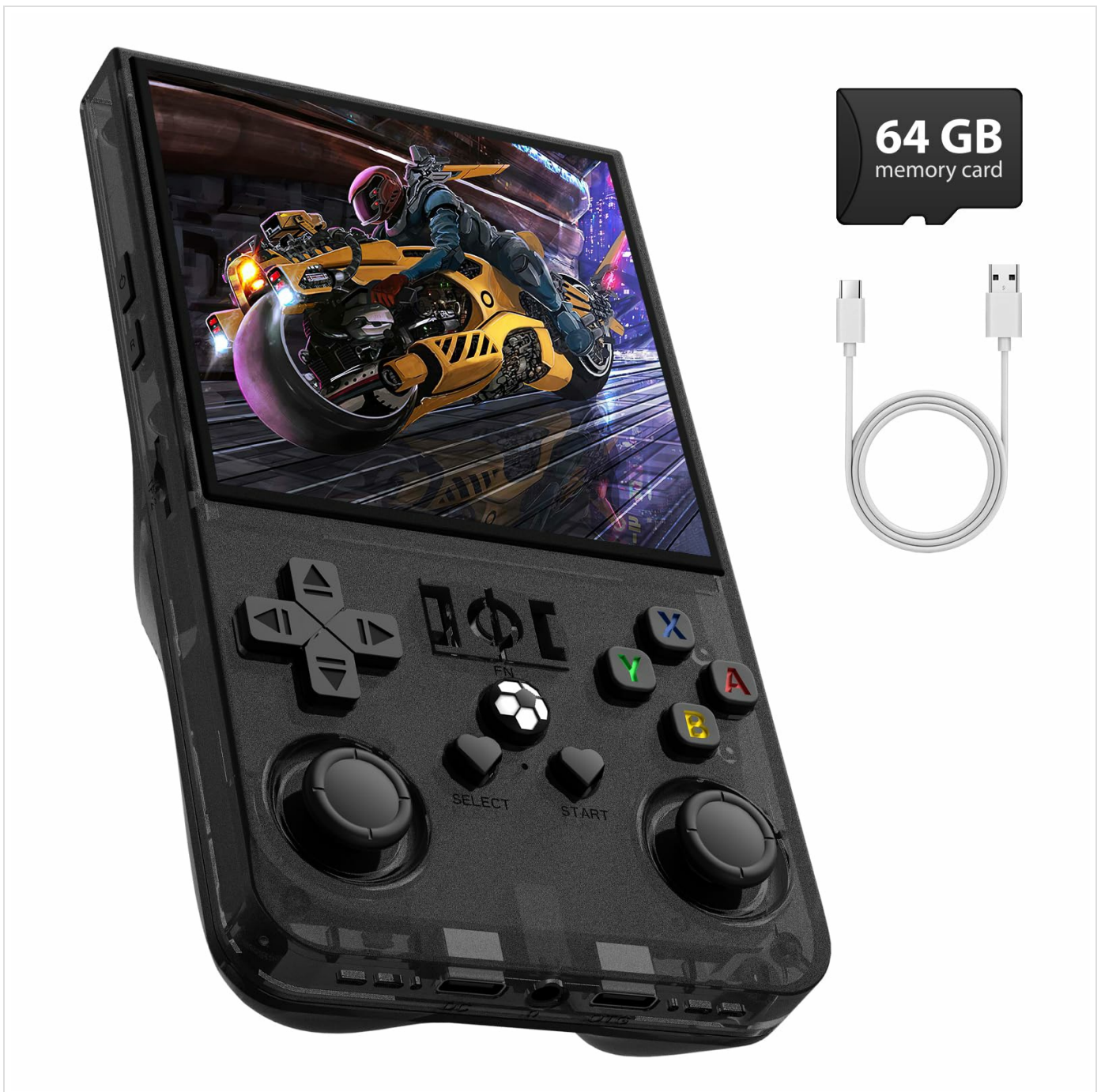
Image: The R36MAX Retro Gaming Console, black model.