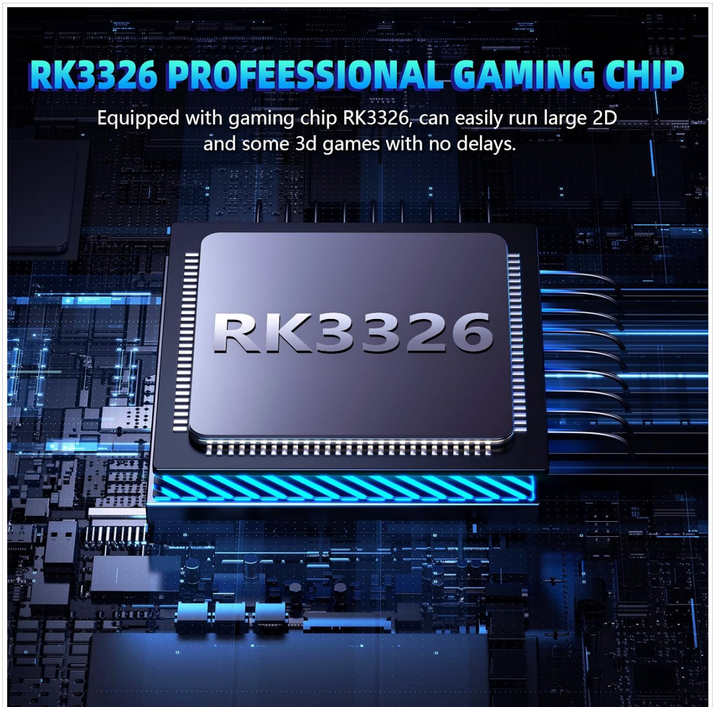
Image: Illustration of the RK3326 professional gaming chip, highlighting its role in smooth 2D and 3D game performance.