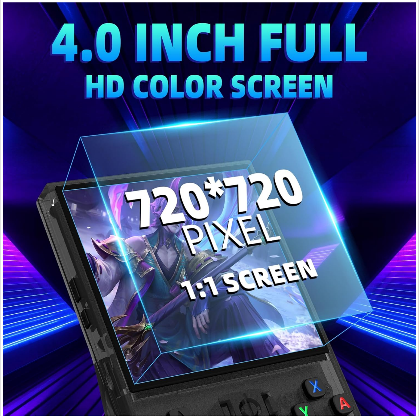
Image: Close-up of the R36MAX console's 4.0-inch HD color screen, showing 720x720 pixel resolution.