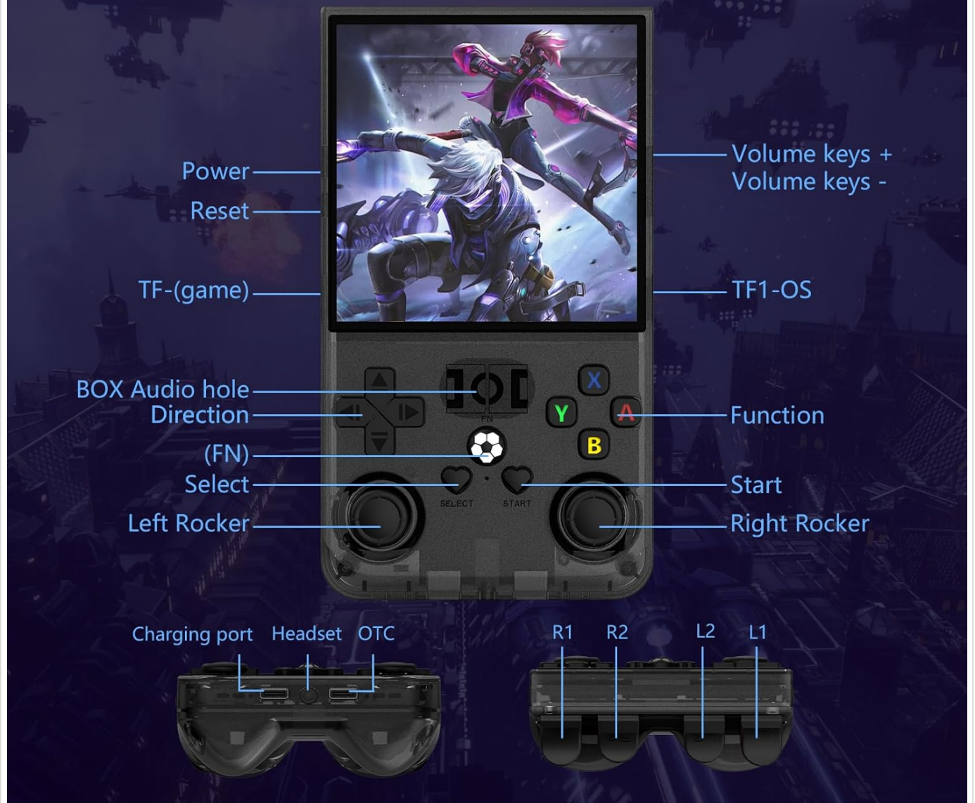
Image: Diagram illustrating the function keys and ports on the R36MAX console, including Power, Reset, TF card slots, Volume keys, Directional pad, ABXY buttons, Select, Start, Left/Right Rockers, Charging port, Headset jack, and shoulder buttons (R1, R2, L1, L2).