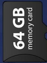
64GB TF card *1