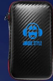
Gift Box *1