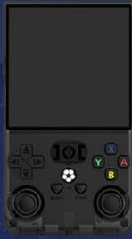
Handheld game console *1