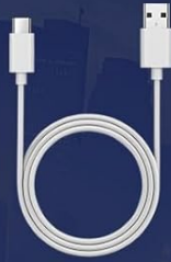
Type C cable *1