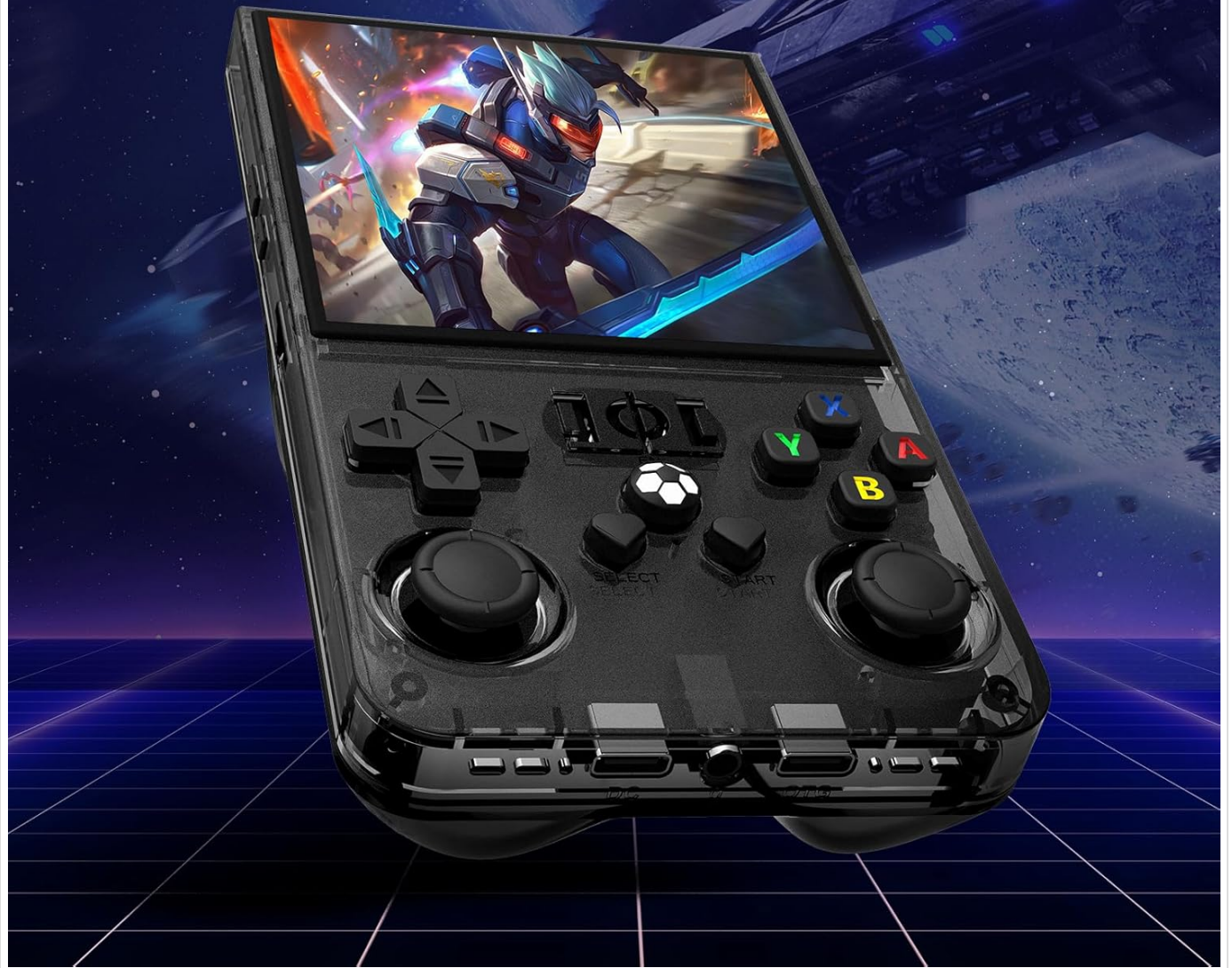
Image: The R36MAX console highlighting the included 64GB TF card.