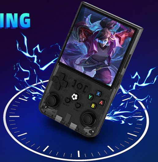
Image: Illustration showing the R36MAX console being charged via a Type-C cable, highlighting the 4000mAh battery capacity.

USB c Charge cable Fast charging Input Power: MAX 5V 1.5-2A Charging