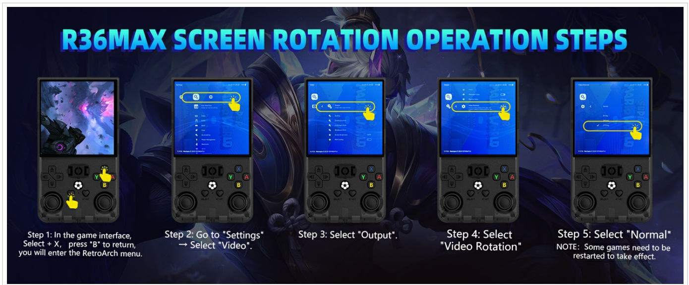
Image: Step-by-step visual guide for adjusting screen rotation on the R36MAX console, showing menu navigation within RetroArch.