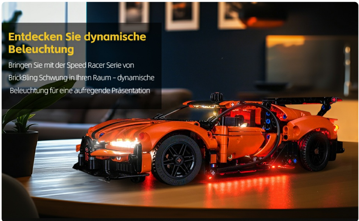
Image: Discover Dynamic Lighting: The BrickBling Speed Racer series brings dynamic lighting for an exciting presentation, as shown with the illuminated model on display.

Bringen Sie mit der Speed Racer Serie von BrickBling Schwung in Ihren Raum – dynamische Beleuchtung für eine aufregende Präsentation