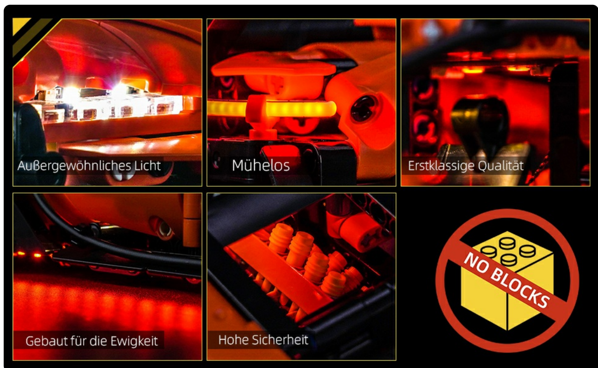
Image: Close-up views of the lighting components, emphasizing exceptional light, effortless integration, first-class quality, durability, and high safety standards.