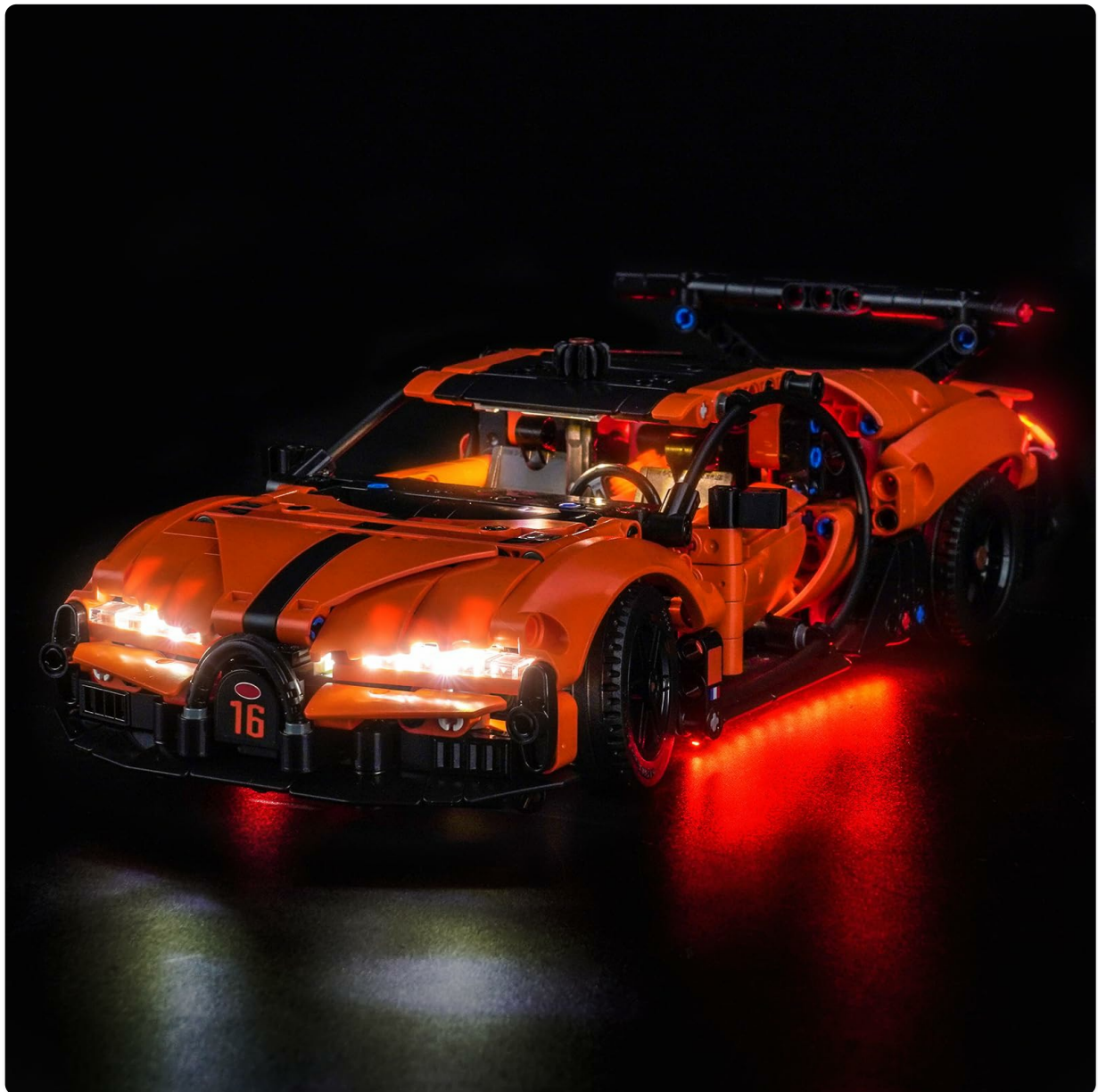
Image: The BrickBling LED Lighting Kit installed on the Lego Bugatti Chiron Pur Sport Hypercar, showcasing its illuminated features in a dark environment.

Please read these instructions carefully before installation to ensure a smooth and safe setup process. The Lego model itself is not included with this lighting kit.