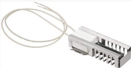
Figure 3.3: Angled View. An angled perspective of the igniter, illustrating its compact design and the two connection wires, ready for installation.