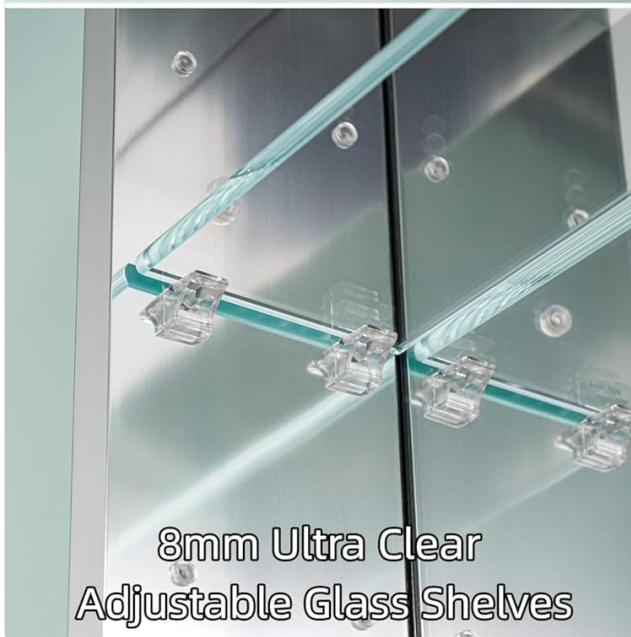
8mm Ultra Clear Adjustable Glass Shelves