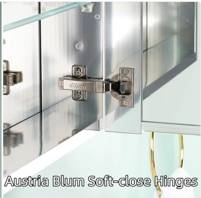
Austria Blum Soft-close Hinges