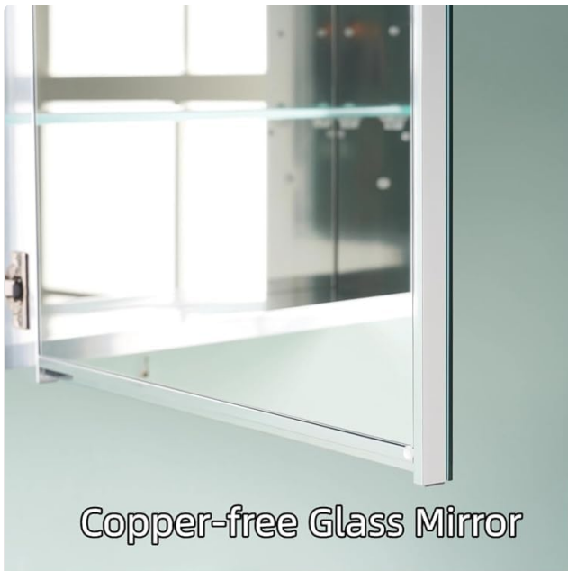
Copper-free Glass Mirror