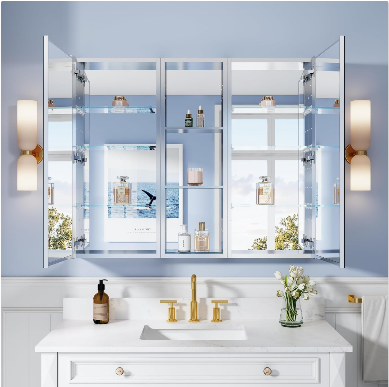
Figure 8: Removable side mirrored panels for easy cleaning.