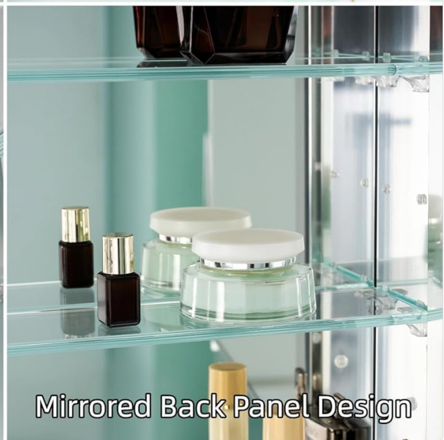
Mirrored Back Panel Design