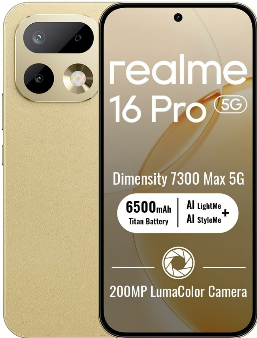
Image: The realme 16 Pro 5G smartphone, showcasing its sleek design and camera module.