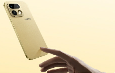
Image: The realme 16 Pro 5G camera system, showcasing its 200MP main camera and 50MP front camera, with details on LumaColor IMAGE processing for skin tone, light, shadow, portrait, and background optimization.

The all-flat form is crafted for comfort and clarity. The matte-finish middle frame adds a silky, refined grip, elegant in hand, timeless in style.