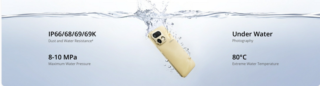
Image: The realme 16 Pro 5G submerged in water, illustrating its IP69 Pro-level Water Resistance, capable of withstanding 8-10 MPa maximum water pressure and 80°C extreme water temperature.

Meets the industry's highest standards for water resistance protection, providing comprehensive, maximum-level defense.