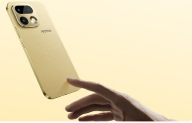
Image: Detailed view of the realme 16 Pro 5G camera system, emphasizing the 200MP main camera and 50MP selfie camera capabilities.

The all-flat form is crafted for comfort and clarity. The matte-finish middle frame adds a silky, refined grip, elegant in hand, timeless in style.