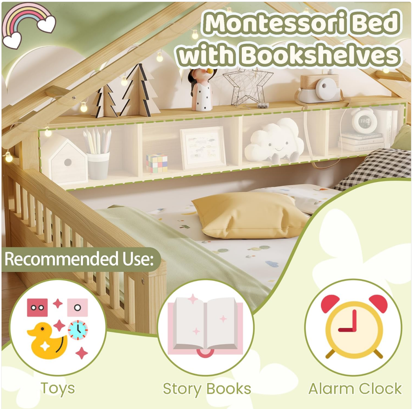
Image: A detailed view of the Montessori bed's bookshelves, demonstrating their use for storing toys, storybooks, and an alarm clock.