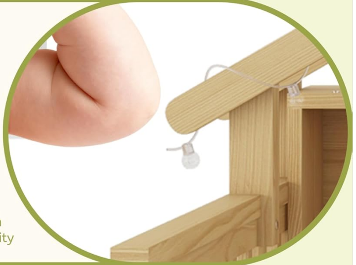
Image: Detail of the bed's safety features, including the 2.76-inch wide gap between rails to prevent finger entrapment and curved corners for anti-collision protection.