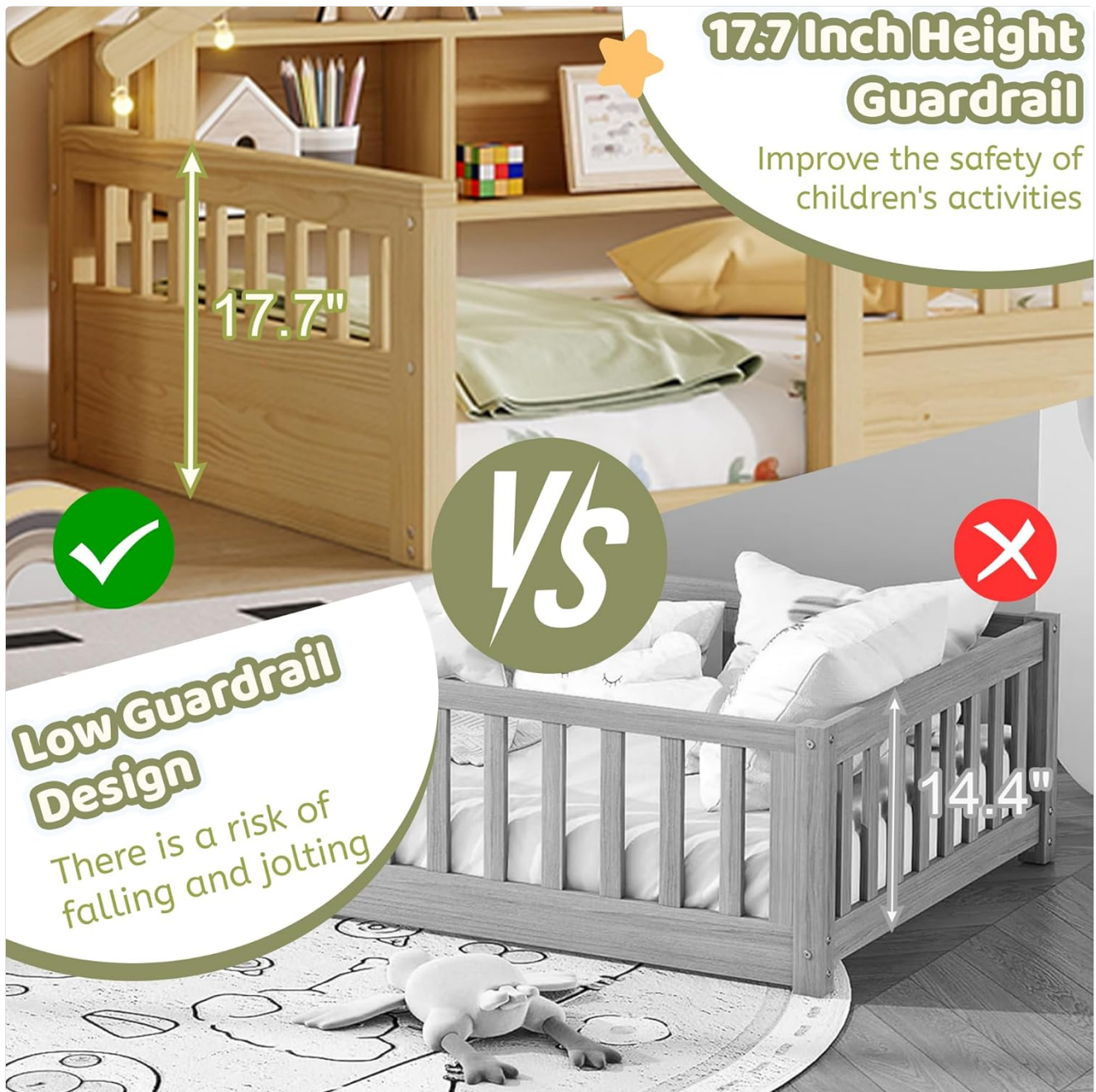
Image: Visual comparison highlighting the 17.7-inch height of the bed's guardrails, designed for enhanced safety compared to lower guardrail designs.