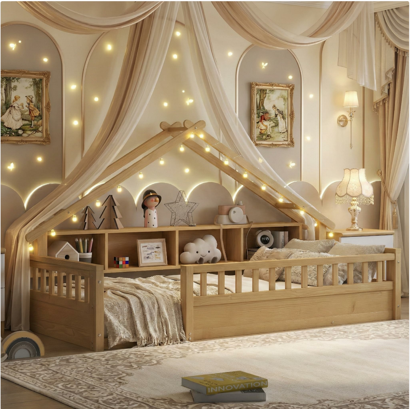
Image: The fully assembled Mirightone Twin XL Floor Bed, showcasing its roof shape, integrated LED lights, and functional storage bookshelves.

It is recommended to have two adults for assembly.