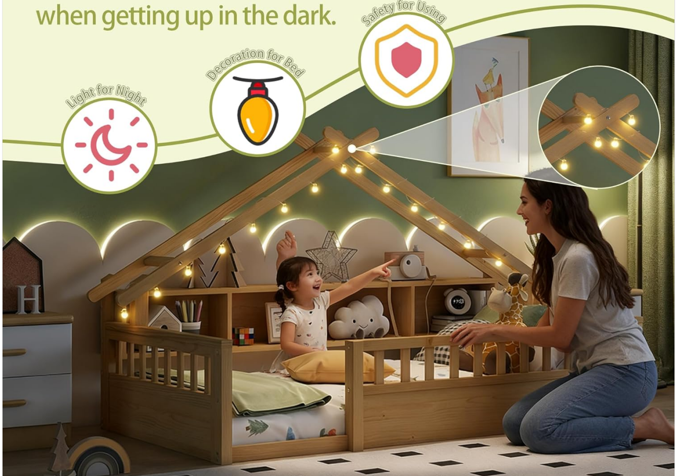
Image: A child enjoying the bed with the integrated LED light bulbs, illustrating how they create a cozy and dreamy atmosphere for bedtime.