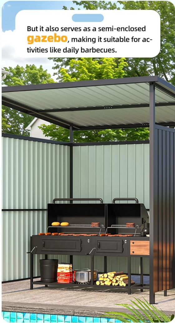
Figure 5: Demonstrating the dual functionality of the gazebo for both storage and grilling.

But it also serves as a semi-enclosed gazebo , making it suitable for activities like daily barbecues.