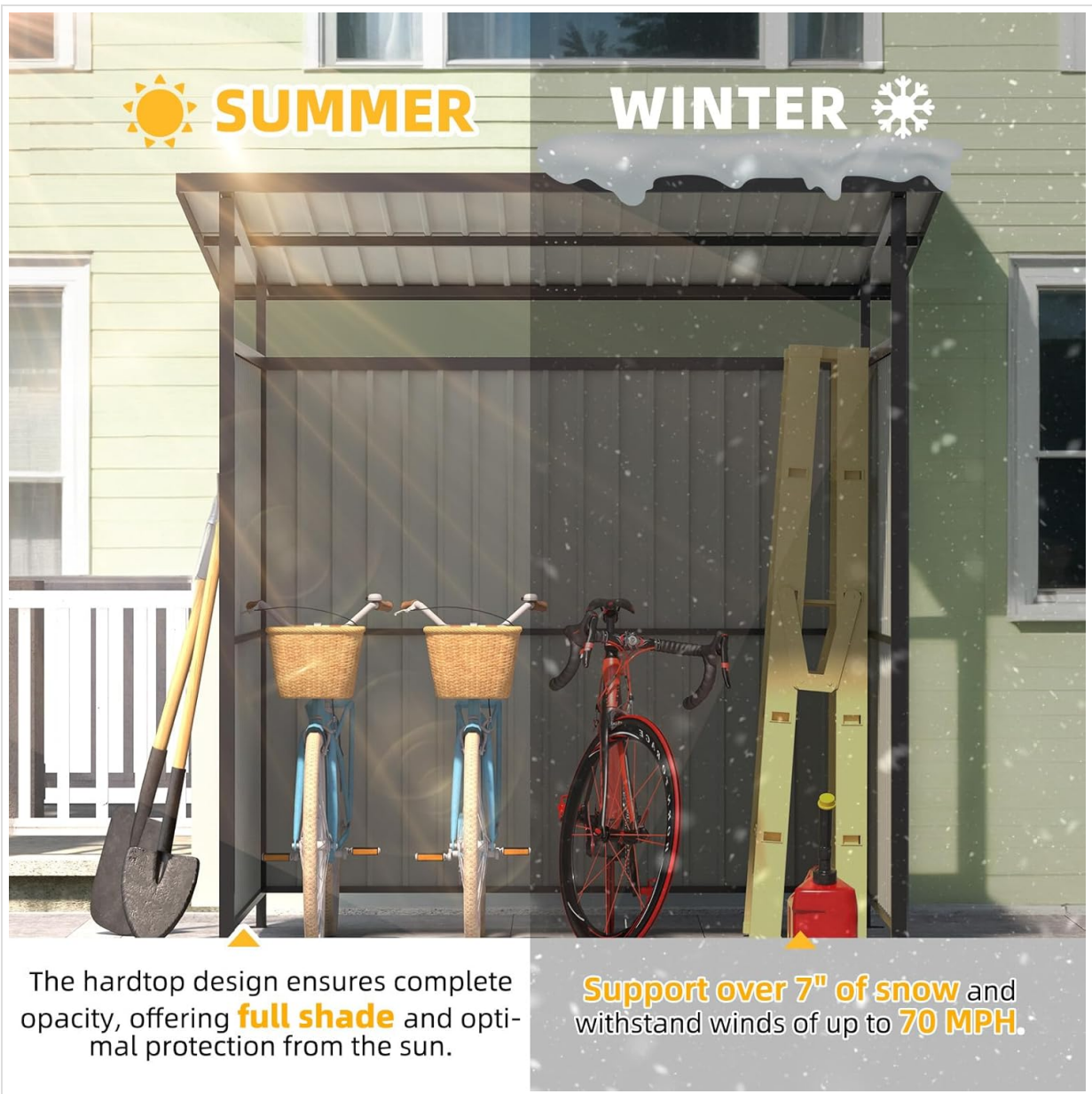
Figure 3: Visual representation of the gazebo's ability to provide shade in summer and withstand snow in winter.