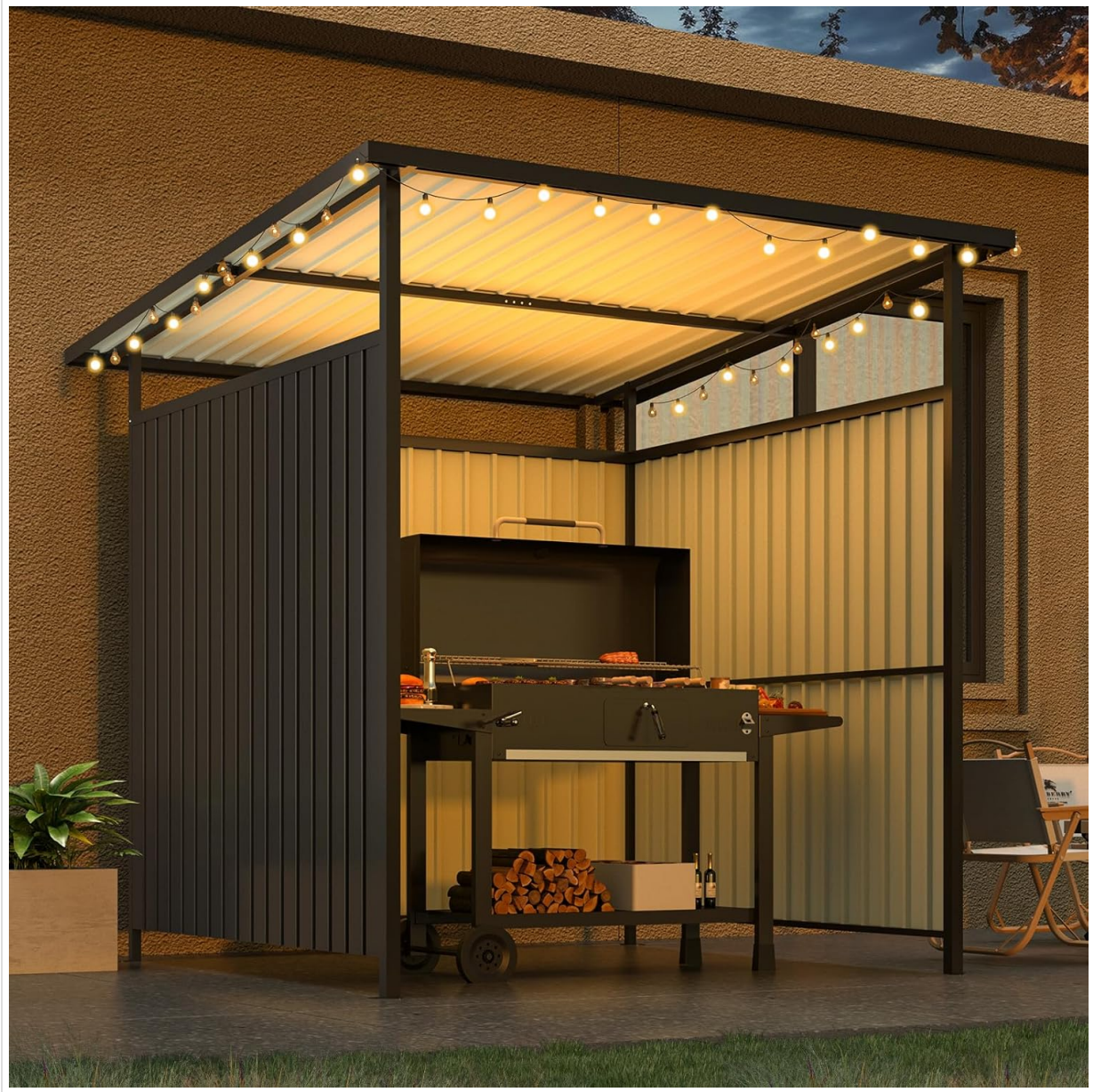
Figure 1: The YODOLLA Grill Gazebo illuminated at night, providing a comfortable space for outdoor cooking.