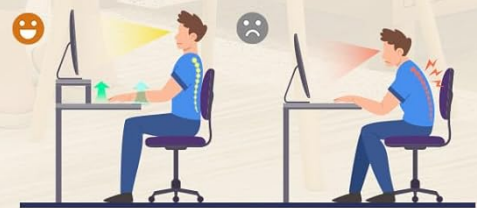
Image 5.4: The full-size monitor stand in use, demonstrating how it helps maintain correct posture and reduces neck strain.

Keep Your Posture Correct And Reduce Neck Strain