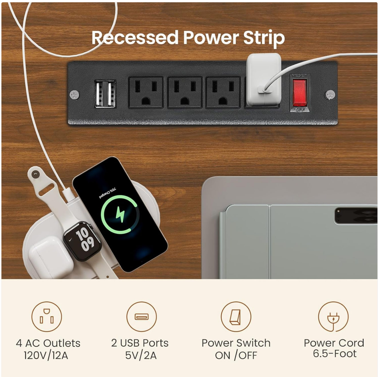
Image 5.2: Detail of the built-in power outlet, showing the AC sockets, USB ports, and power switch.