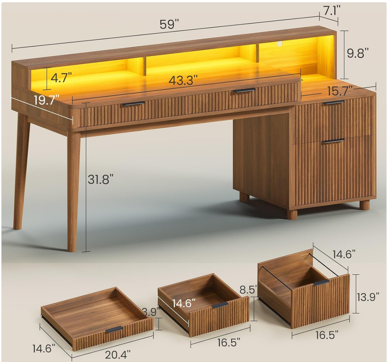
Image 8.1: Dimensional drawing of the SEDETA Office Desk, showing key measurements.