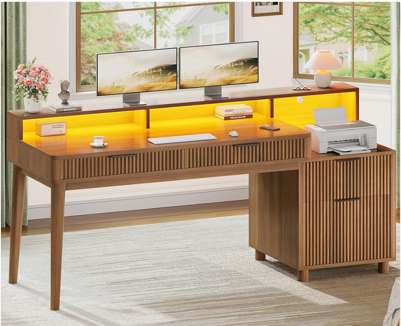
Image 1.1: The SEDETA 59-inch Modern Office Desk, showcasing its overall design and features.