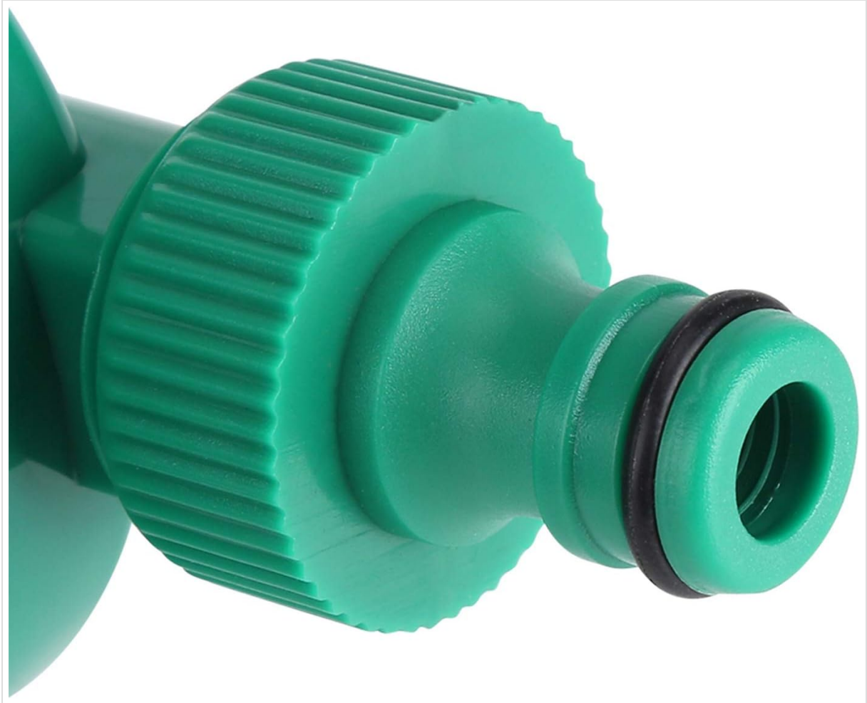
A close-up view of the Yosoo Irrigation Timer's hose connector, showing the threaded inlet for attaching to a faucet and the outlet for connecting a garden hose or irrigation system.