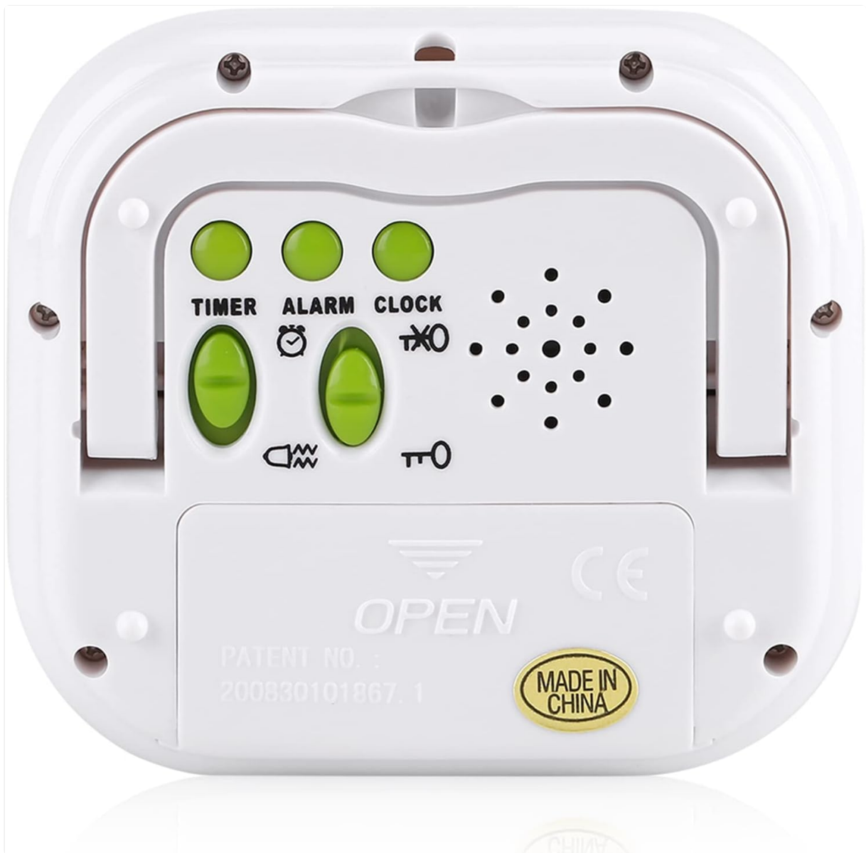
Image: Rear view of the Yosoo Digital Alarm Clock showing the control switches and battery compartment. The switches are labeled TIMER , ALARM , and CLOCK , along with a vibration/music option switch and a lock button.