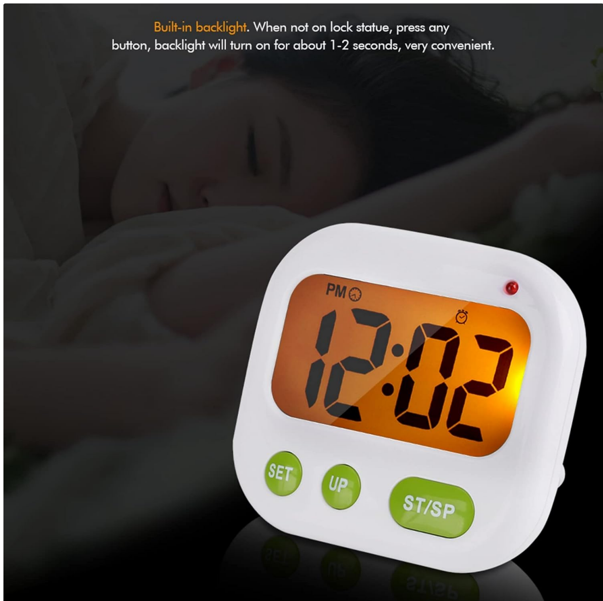
Image: Yosoo Digital Alarm Clock with its orange backlight activated, showing the time 12:02 PM. The backlight illuminates the display for 1-2 seconds.

The clock features a built-in orange backlight for easy viewing in low light conditions.