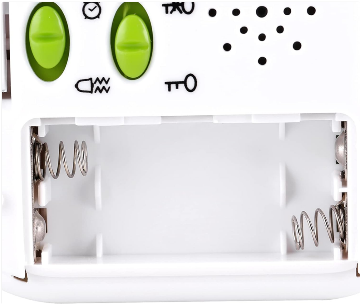
Image: Open battery compartment of the Yosoo Digital Alarm Clock, showing the two AAA battery slots with spring contacts.