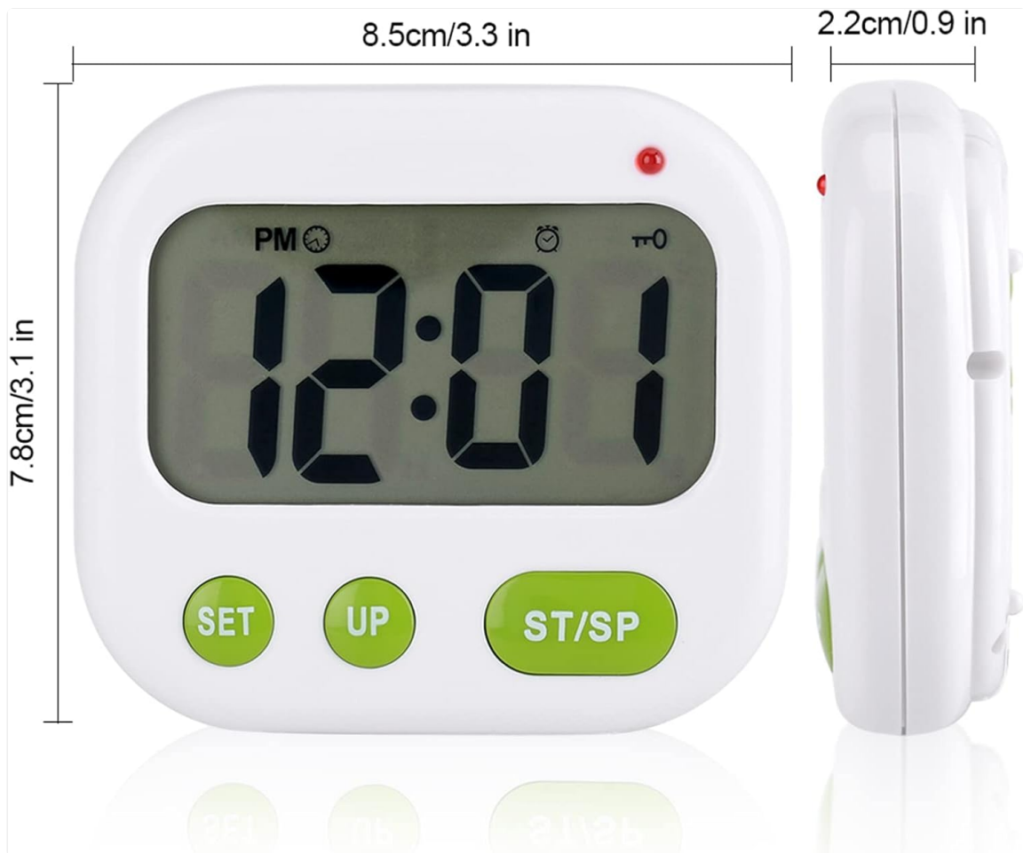
Image: Dimensions of the Yosoo Digital Alarm Clock: 8.5cm (3.3in) wide, 7.8cm (3.1in) high, and 2.2cm (0.9in) deep. This image provides a visual reference for the product's size.