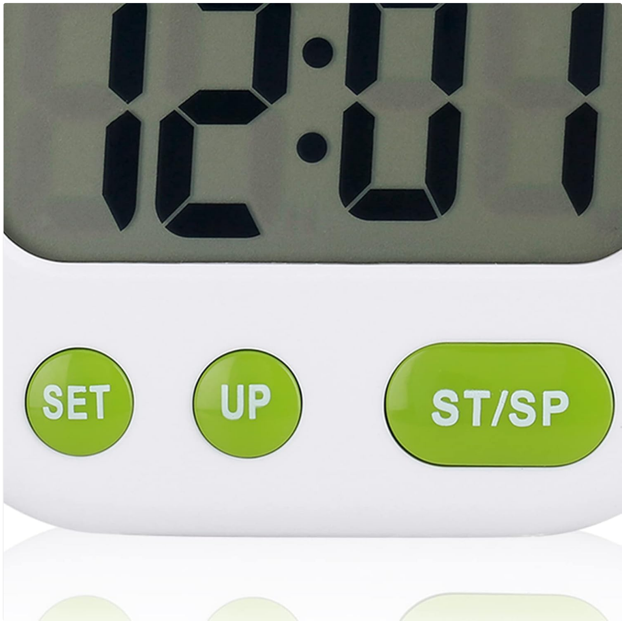
Image: Close-up of the Yosoo Digital Alarm Clock's front buttons: SET, UP, and ST/SP. These buttons are used for setting time, alarms, and timer functions.