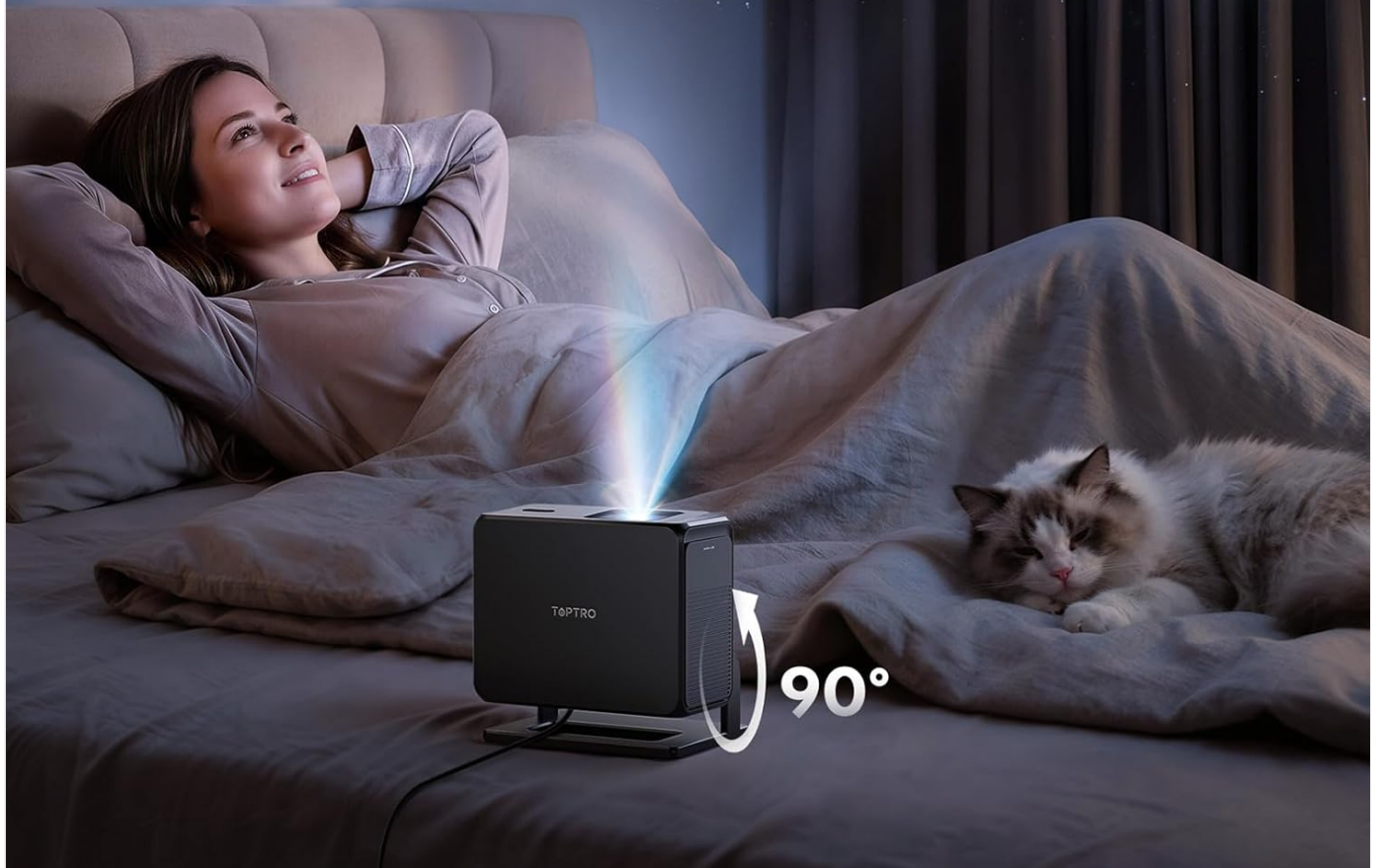
Figure 3: A person relaxing in bed while the TOPTRO TP3 projector projects an image onto the bedroom ceiling, demonstrating its flexible 90-degree projection capability.

D'un Simple Retournement de Votre Objectif