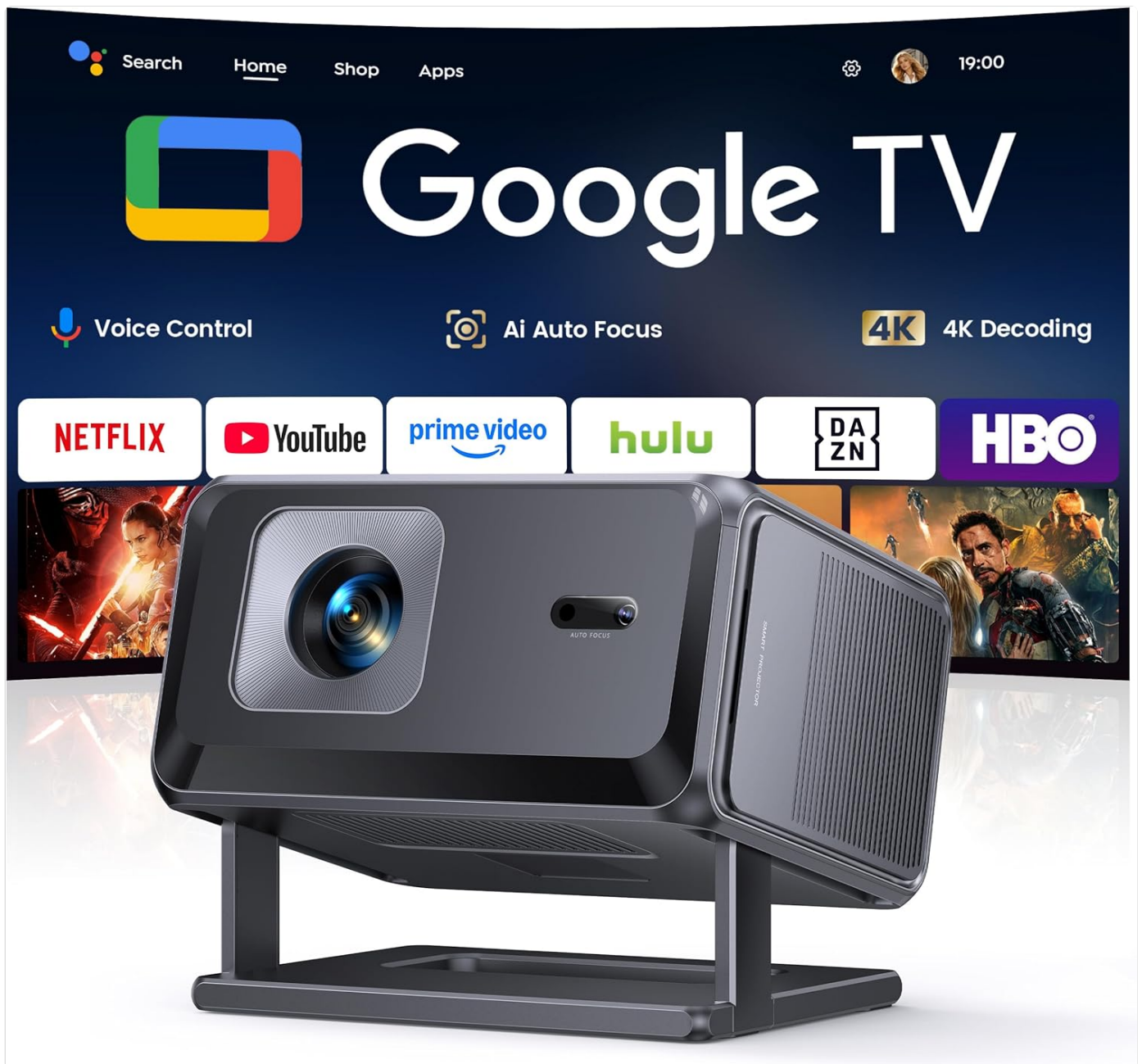
Figure 1: TOPTRO TP3 Projector main unit. This image shows the compact design of the projector with its lens and integrated stand.