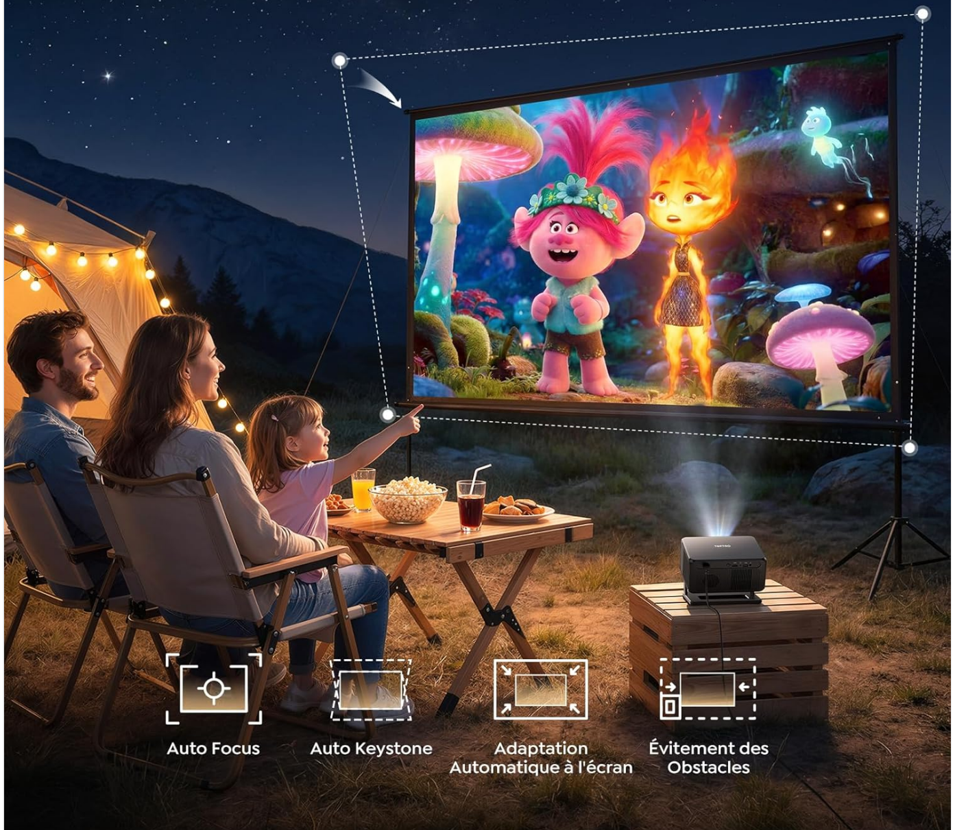
Figure 4: Visual representation of the AI intelligent image adjustment features, including auto focus, auto keystone correction, automatic screen adaptation, and obstacle avoidance.