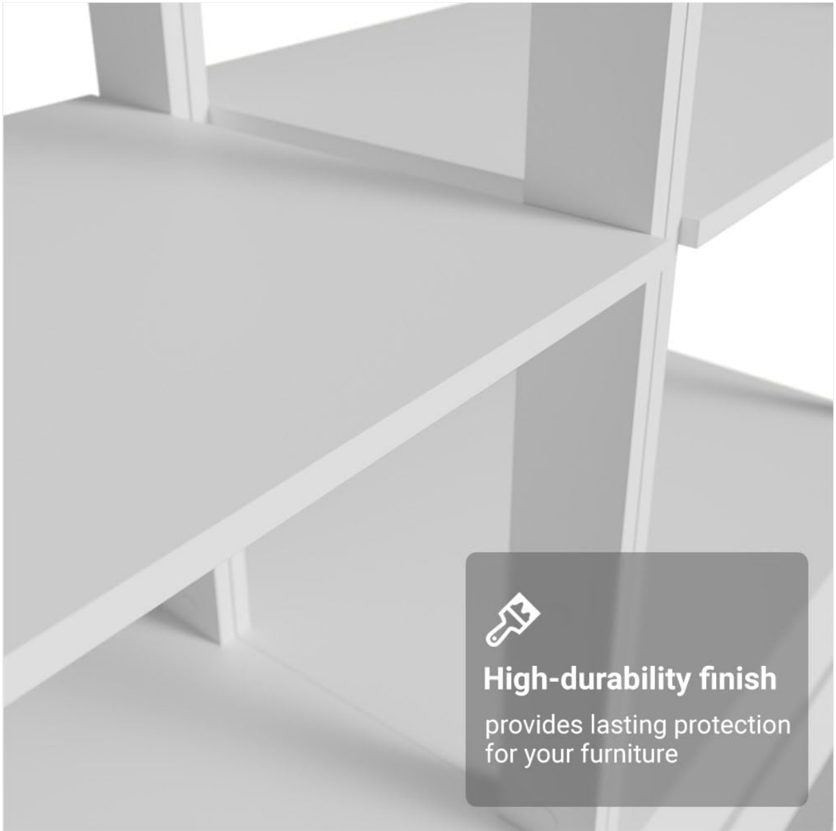
A close-up view highlighting the high-durability finish that protects the furniture.