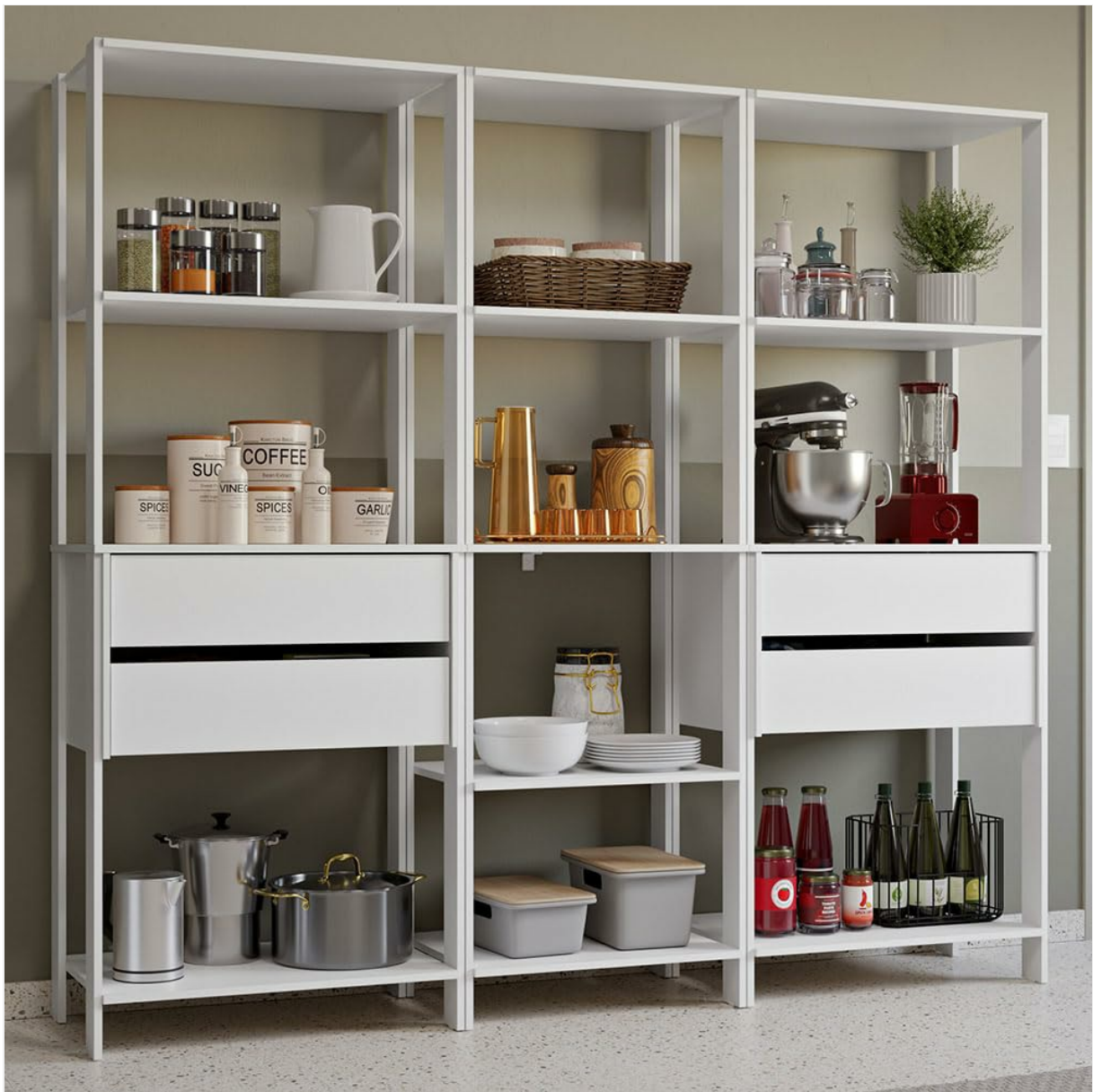
The Madesa Kitchen Pantry Storage Rack in White, featuring four drawers and open shelves.