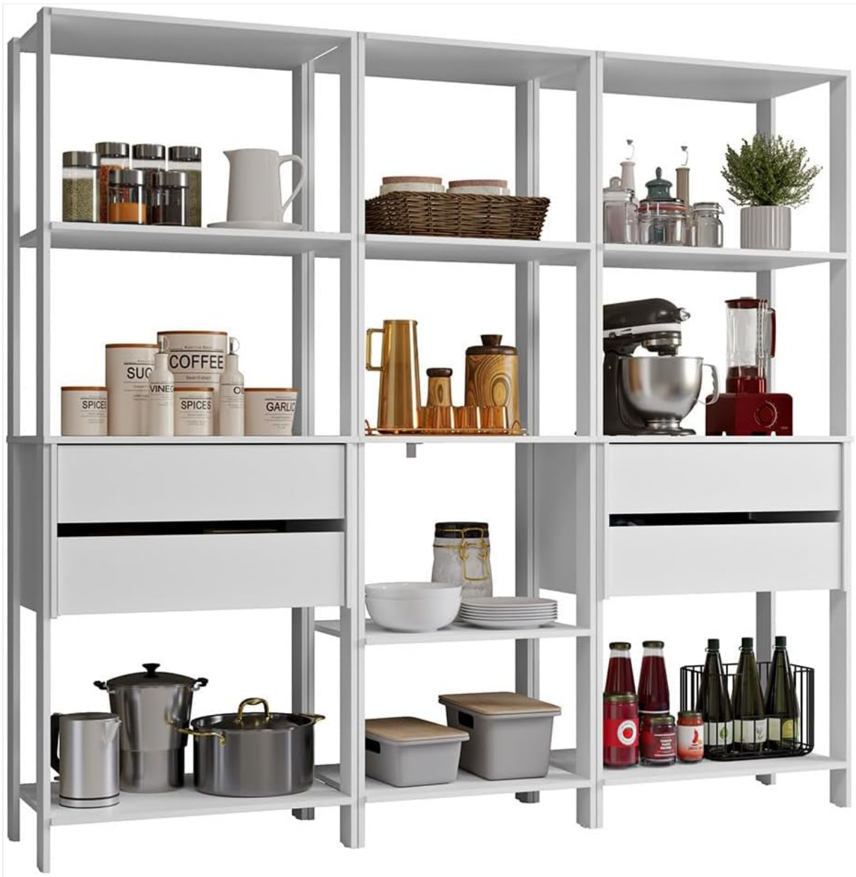
The pantry unit organized with kitchenware, demonstrating its storage capacity and functional design.