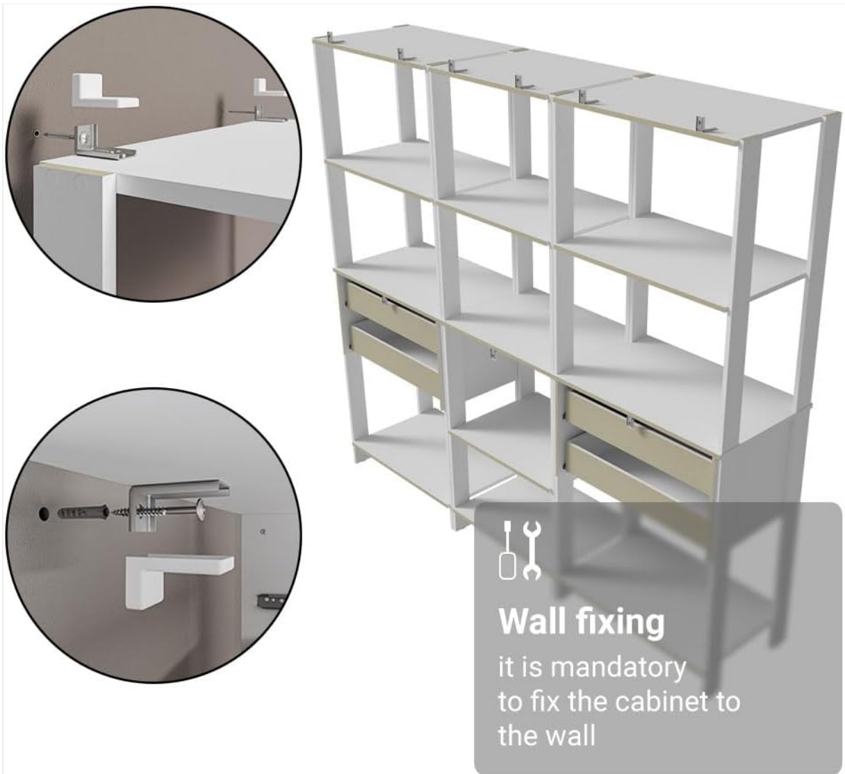
Illustration of the wall fixing mechanism, emphasizing the importance of securing the cabinet to the wall for stability.