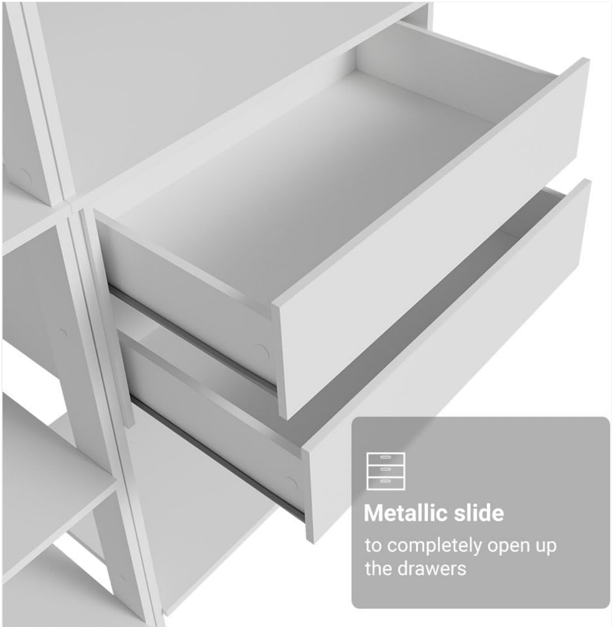
Detail of the smooth-gliding drawers with metallic slides, designed for full extension and easy access.