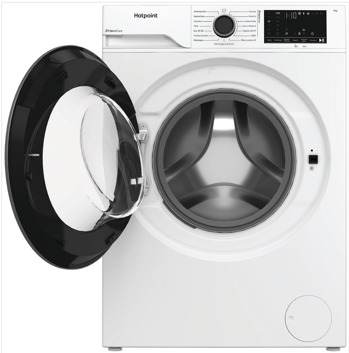
Figure 3: The washing machine with its front door open, revealing the stainless steel drum. This view is useful for demonstrating how to load laundry and inspect the drum.