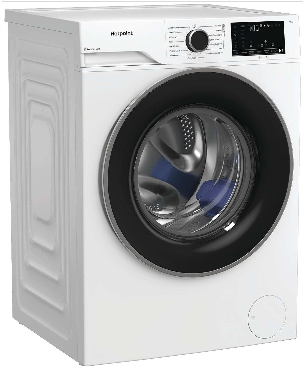
Figure 1: Front view of the Hotpoint HB 123 CARE IT washing machine. This image shows the overall design, including the control panel, detergent drawer, and large front-loading door, essential for understanding the appliance's layout during installation.

Carefully remove all packaging materials. Ensure all transit bolts, located at the rear of the machine, are removed before connecting to power or water. Keep the transit bolts for future transport of the appliance.