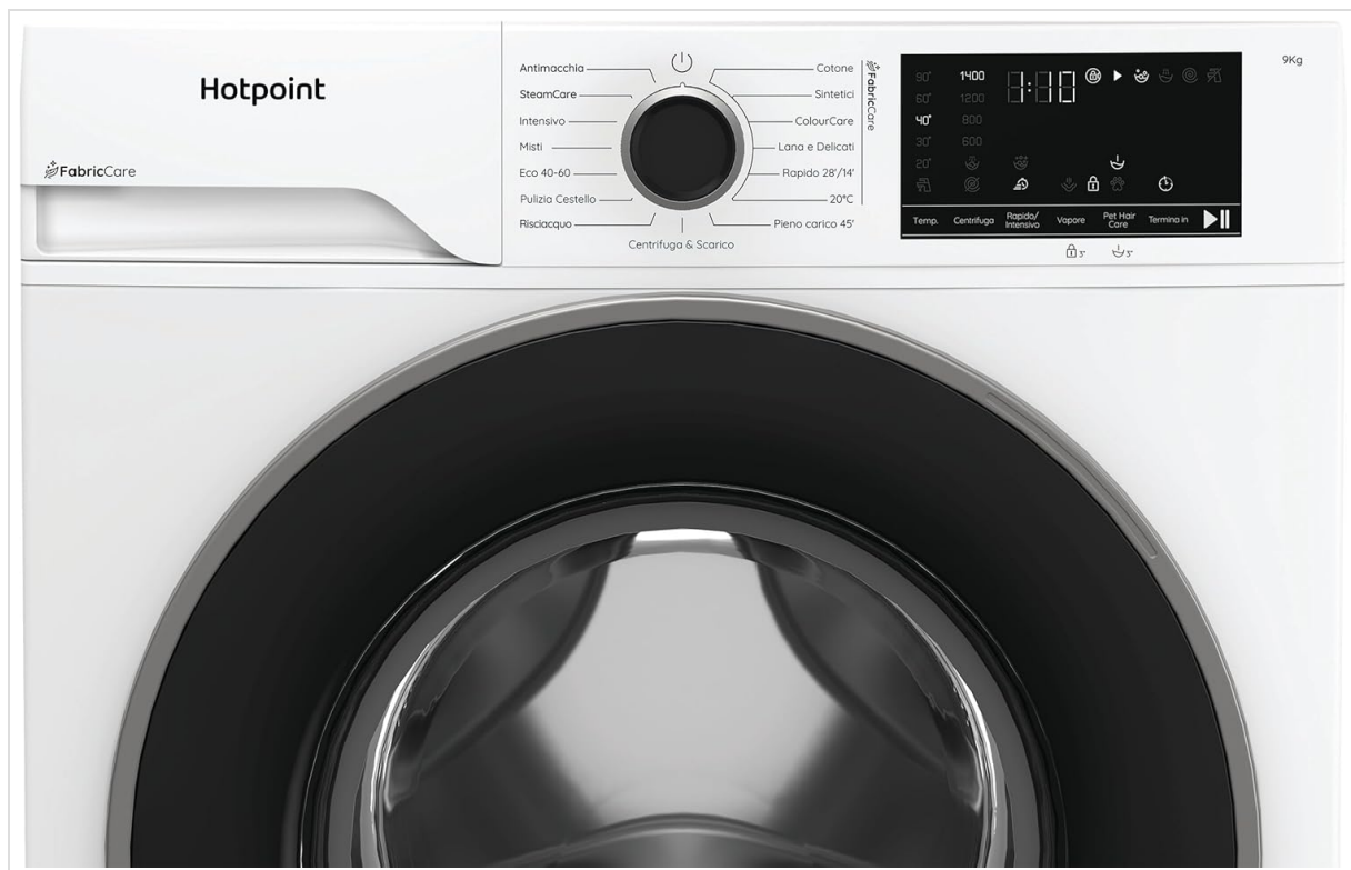
Figure 2: Close-up of the control panel, showing the program selection dial, touch buttons for various options (temperature, spin, steam, Pet Hair Care), and the digital display. This panel allows users to select and customize wash cycles.

The control panel features a central program dial for selecting wash cycles, and touch-sensitive buttons for adjusting temperature, spin speed, or activating special functions like SteamCare or PetHair Care. The digital display shows cycle time and status.