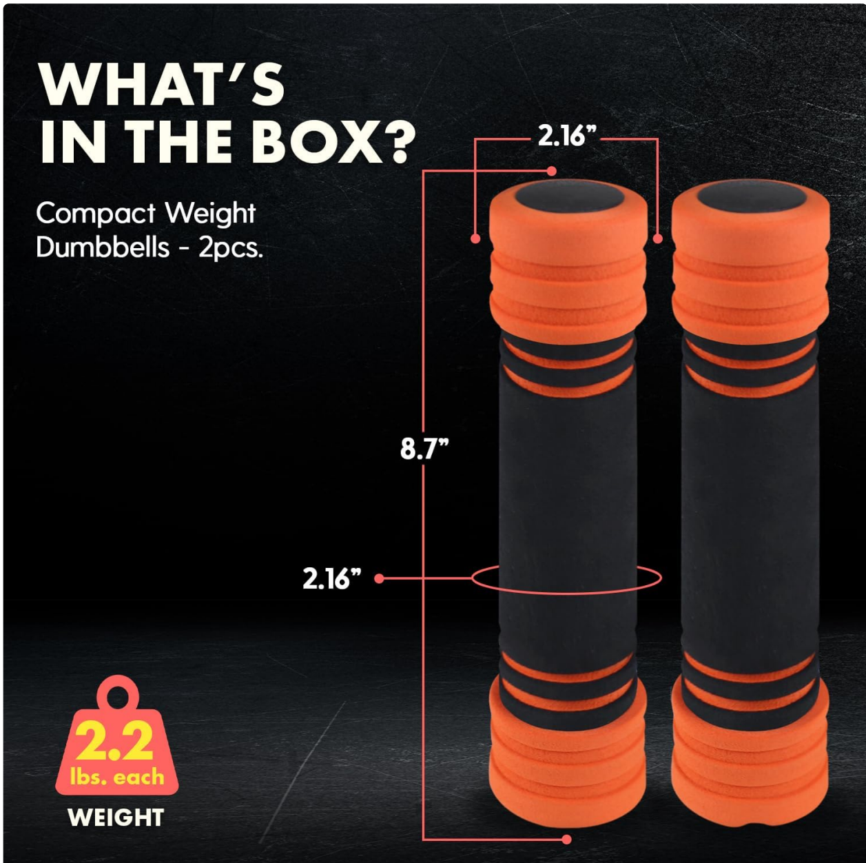
Illustration of the compact dumbbells and their approximate dimensions and weight per piece.