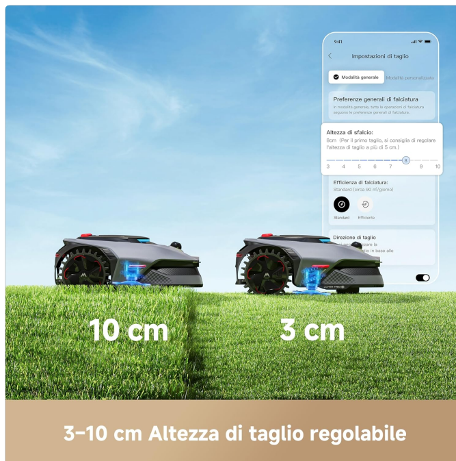
Image: The robot lawn mower demonstrating its adjustable cutting height feature, ranging from 3cm to 10cm.

Set your mowing preferences in the app in advance, such as mowing efficiency, mowing height, and mowing direction. The cutting height is adjustable from 3 cm to 10 cm. The UltraTrim™ blade disc is designed to move to the side when it reaches lawn edges, ensuring a cleaner cut. You can configure additional mowing preferences via the "More" settings in the app, or switch to "Custom Mode" to define individual mowing preferences for each zone.