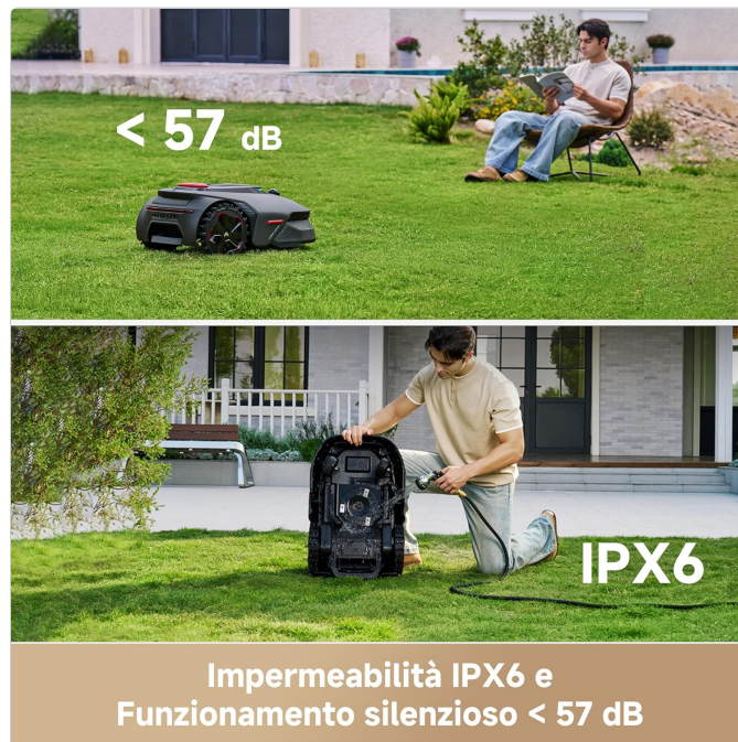
Image: A user cleaning the underside of the MOVA LiDAX Ultra 1600 Robot Lawn Mower with a hose, demonstrating its IPX6 waterproof rating.

Clean the robot regularly to ensure optimal performance and extend the robot's lifespan. Before cleaning, turn off the robot. Cover the LiDAR with its protective cover. Turn the robot upside down. When turning the robot over, be careful not to scratch the camera lens. Clean the housing, blade disc, and chassis with a hose. Do not use a high-pressure washer for cleaning. Do not use detergents for cleaning. Use a clean cloth to wipe the charging contacts on the robot and charging station. Use a lint-free cloth to carefully clean the LiDAR sensor. For optimal positioning and navigation, clean the front camera once every two weeks.