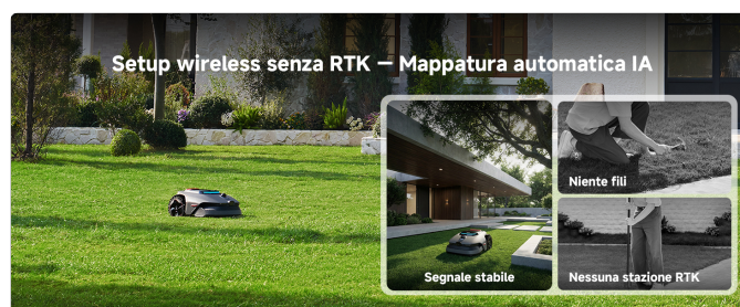
Image: The robot's wireless setup and automatic AI mapping using 360° LiDAR 3D.

Before mapping, ensure the robot's battery level is above 50%, the protective cover of the LiDAR is removed, the top cover is closed, and the robot is correctly docked in the charging station. In the app, tap "Start Mapping". The robot will check its status and calibrate. Guide the robot remotely to the edge of your lawn to map out the work area. Walk within 5m behind the robot during the mapping process. The robot can navigate slopes with an incline up to 45% (24°). For better mowing results, it is recommended to keep slopes below 25% (14°). For areas narrower than 60cm, set them as paths to allow the robot to pass through. If your lawn is more than 4cm higher than the adjacent ground, keep the robot at least 10cm away from the edge. If your lawn is level with the adjacent ground, the robot can cross the perimeter for optimal mowing results along the edges. Ensure turning angles are greater than 90°. Enable "Auto Boundary Detection" mode to map out the work area. We recommend following the robot during this process. If the robot fails to accurately detect boundaries, you can exit Auto Boundary Detection mode and switch to remote control. Make sure the robot's front camera is clean and unobstructed. When the robot returns to within 1m of the starting point, tap "Close Boundary" to complete the boundary setting. Alternatively, you can go to Device Page > Map > Edit to adjust the map after mapping is finished.