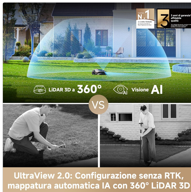
Image: The robot lawn mower showcasing its LiDAR 3D and AI Vision capabilities for automatic mapping.