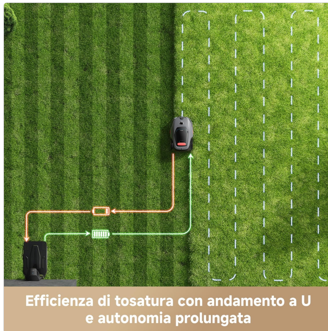
Image: The robot lawn mower executing an efficient U-path mowing pattern for comprehensive lawn coverage.