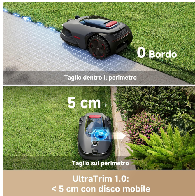
Image: The robot lawn mower utilizing its UltraTrim 1.0 feature for precise edge cutting, maintaining a 5cm distance from borders.