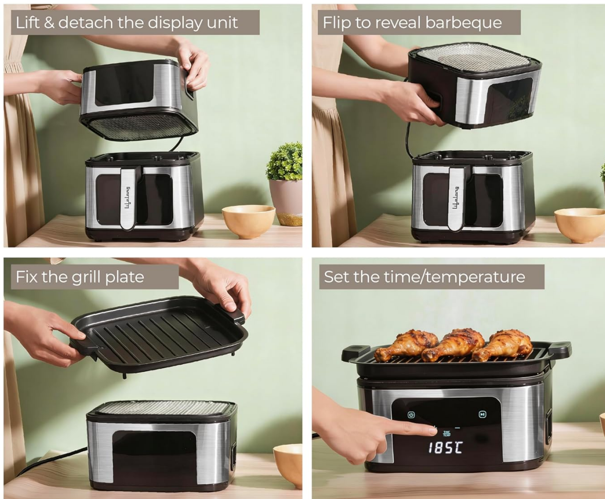
Image 5.1: A four-panel image demonstrating how to switch to grilling mode: 1. Lift & detach the display unit. 2. Flip to reveal barbeque. 3. Fix the grill plate. 4. Set the time/temperature.