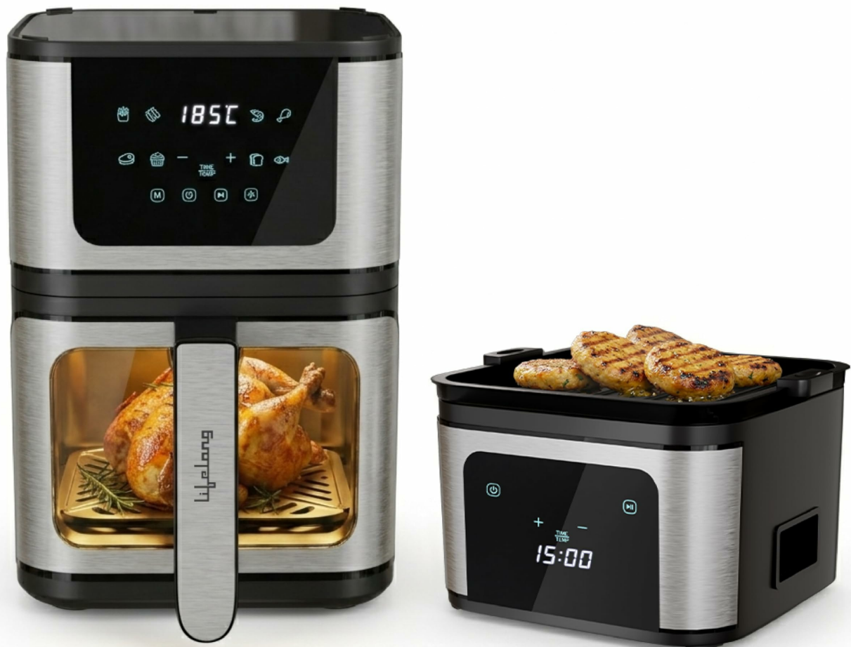
Image 1.1: The Lifelong BRIK 2-in-1 Air Fryer & Barbeque, showcasing its sleek silver and black design with a glass window displaying food inside.