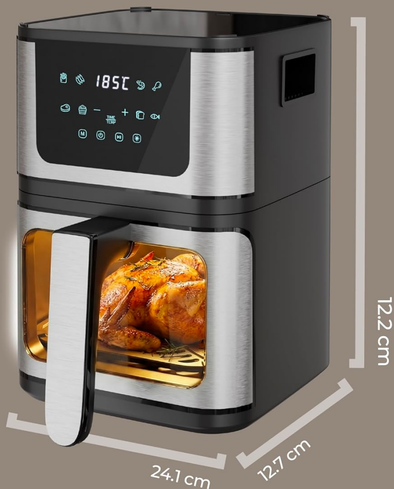
Image 8.1: The appliance with its 4.2L capacity highlighted, along with its dimensions: 24.1 cm (depth), 12.7 cm (width), and 12.2 cm (height).