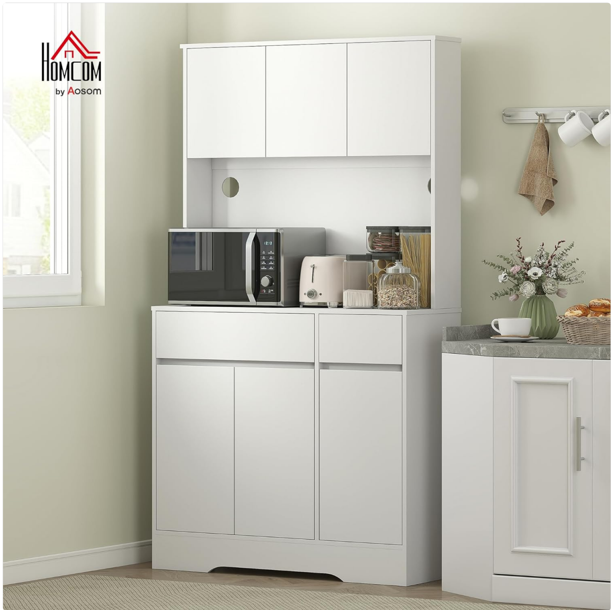
Image 1.1: The HOMCOM Tall Kitchen Sideboard in a typical kitchen environment.