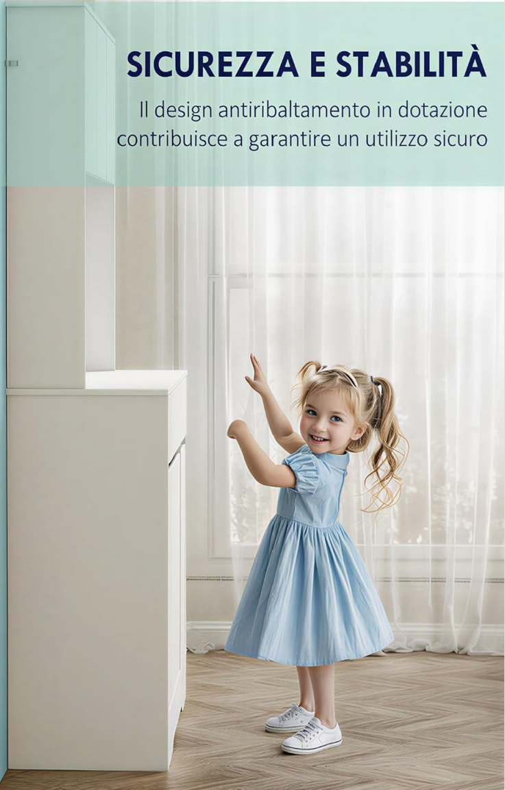
Image 2.1: Illustration of the anti-tipping mechanism and its importance for safety.