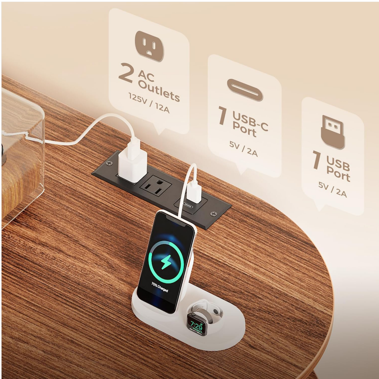
Image: Detailed view of the integrated power outlets, demonstrating their use for charging devices and powering audio equipment.