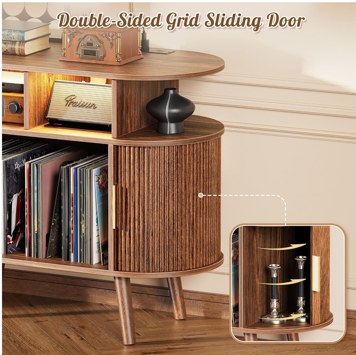
Image: Detail of the double-sided grid sliding door, revealing the enclosed storage space.