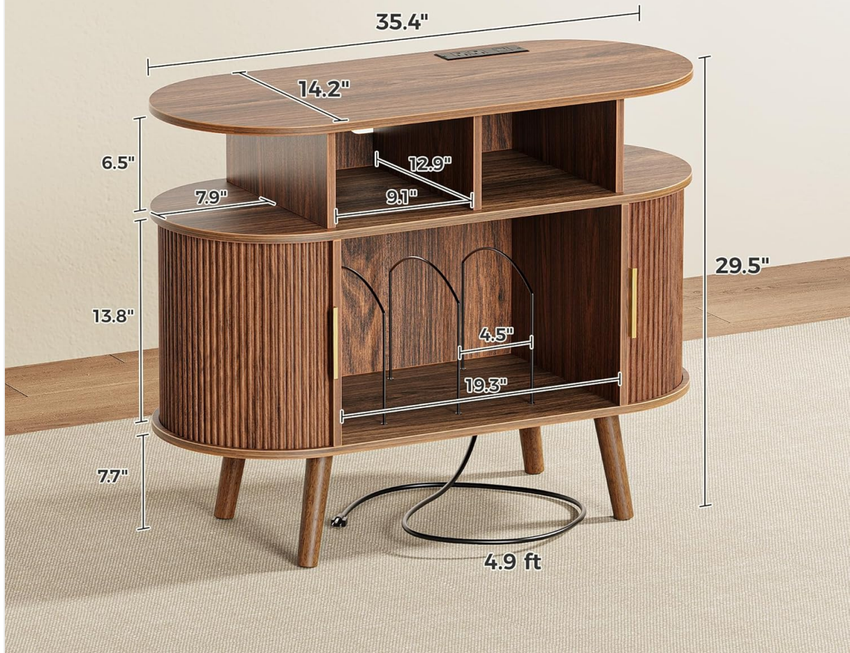
Image: Dimensional drawing of the record player stand, providing key measurements for planning placement.