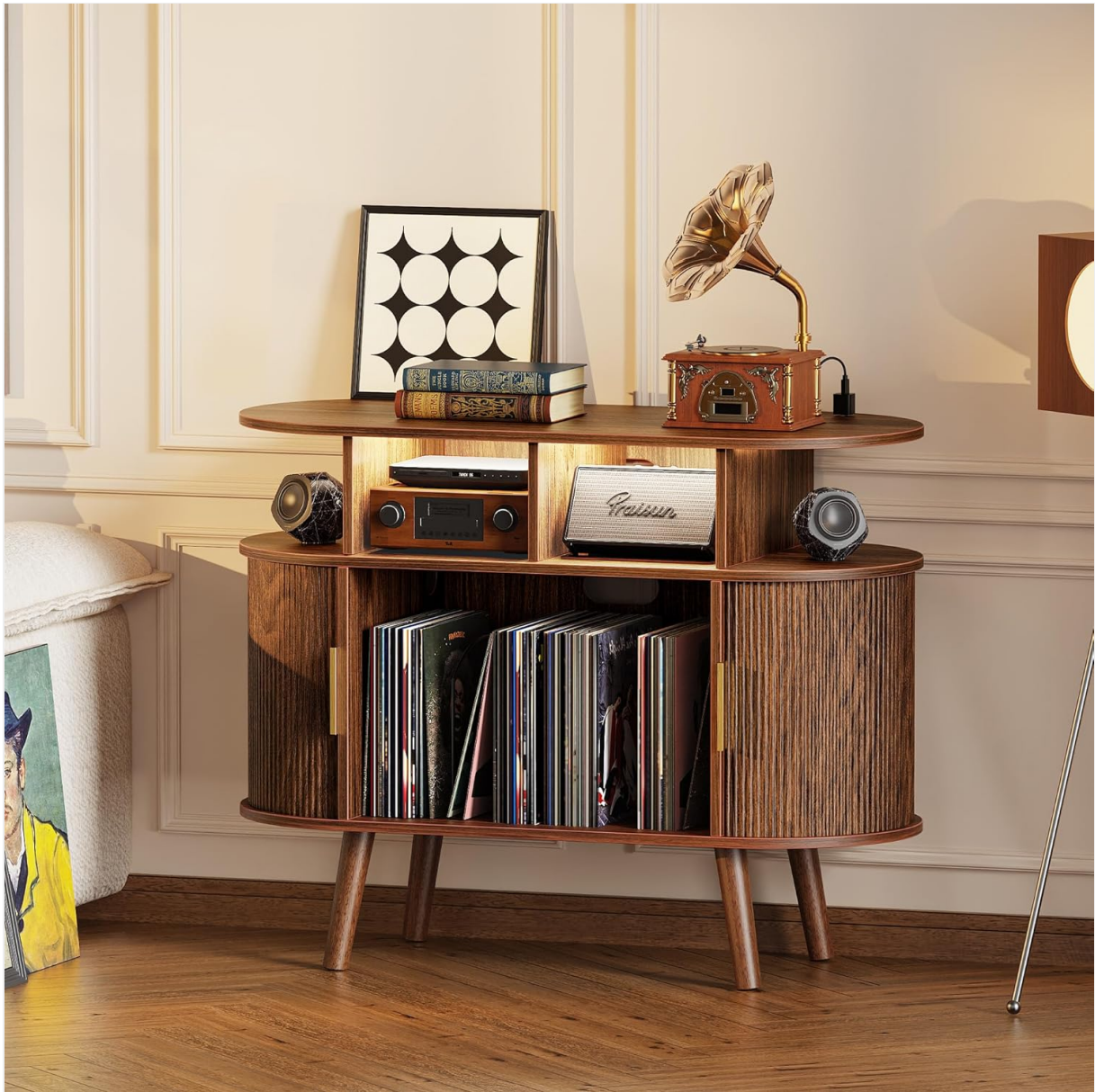
Image: The PRAISUN 35.4 Inch Record Player Stand, showcasing its design and functionality within a home environment.