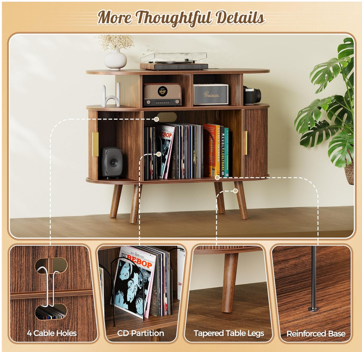
Image: Close-up illustrating the thoughtful details of the stand, such as cable management holes, tapered legs, and reinforced base for stability.