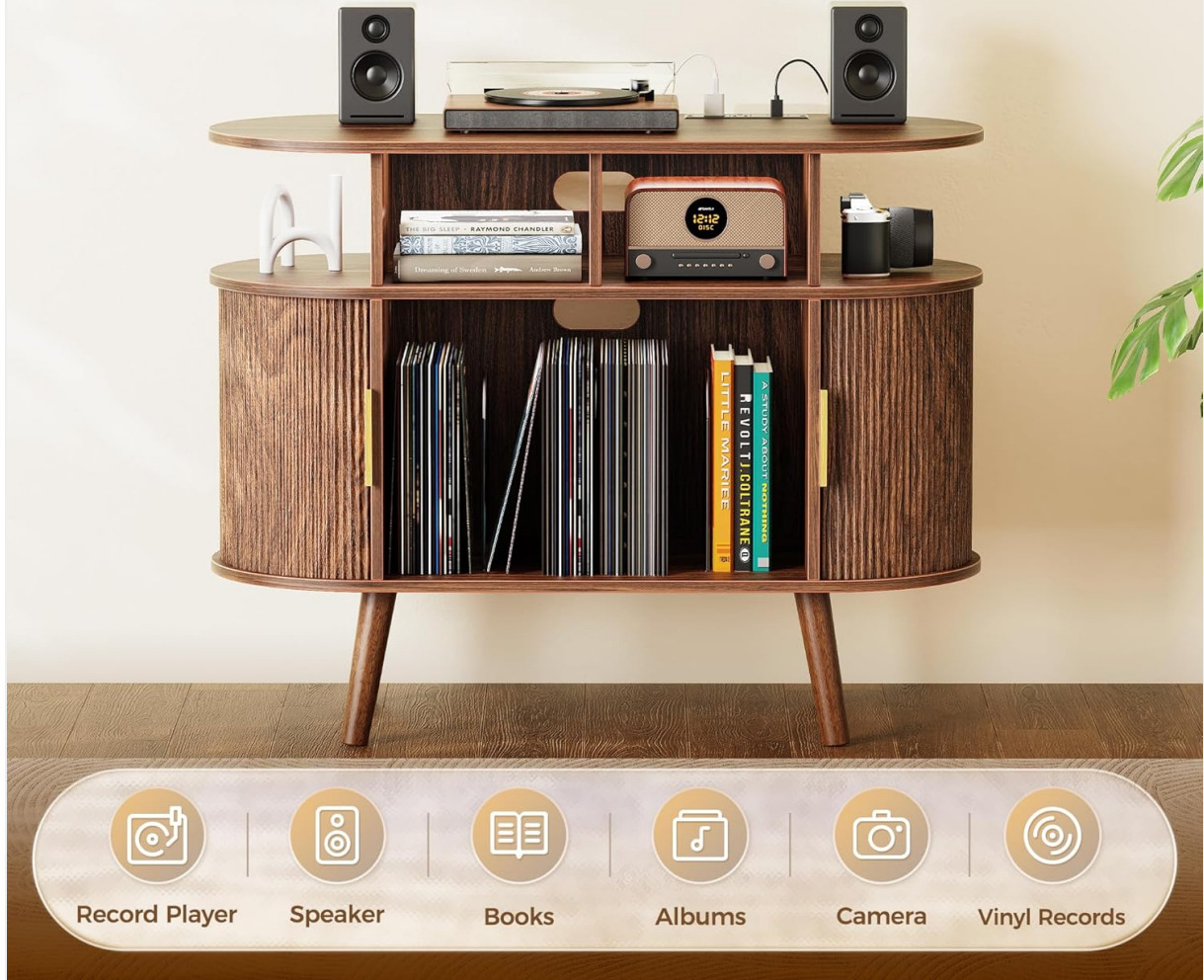
Image: Overview of the stand's multiple storage tiers, highlighting its capacity for various media and equipment.