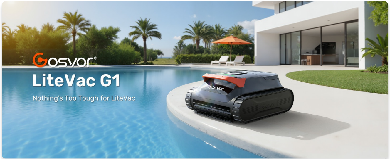
Image: The Gosvor LiteVac G1 operating in a clean swimming pool.