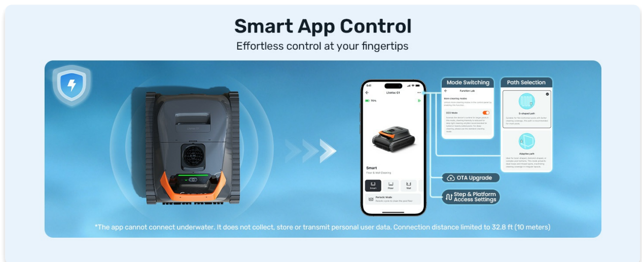
Image: The Gosvor app interface showing various control and setting options for the LiteVac G1.