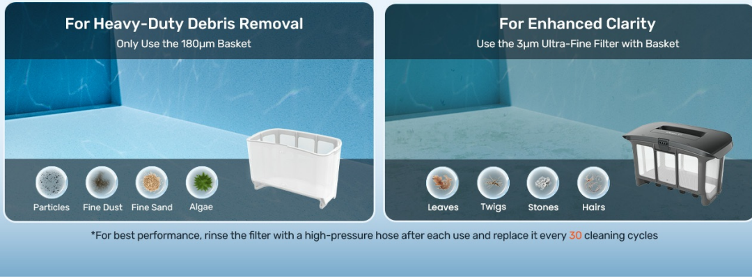
Image: Illustration of the Gosvor Double Filtration system with standard and ultra-fine filters.