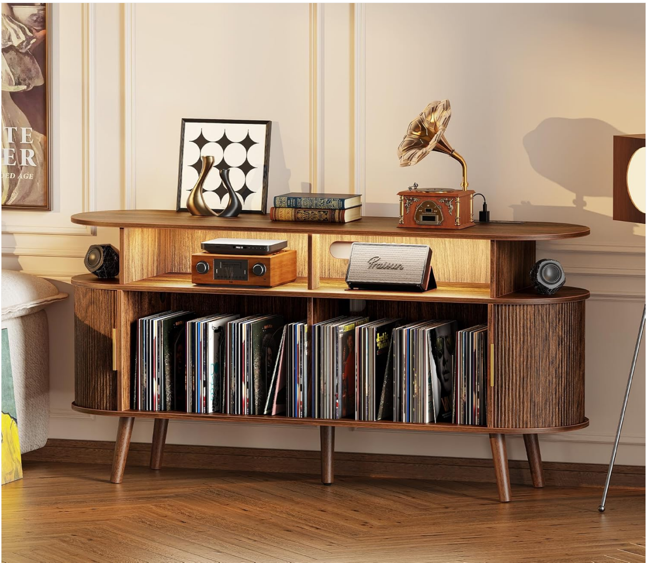
Figure 1: Front view of the PRAISUN 54-inch Record Player Stand.