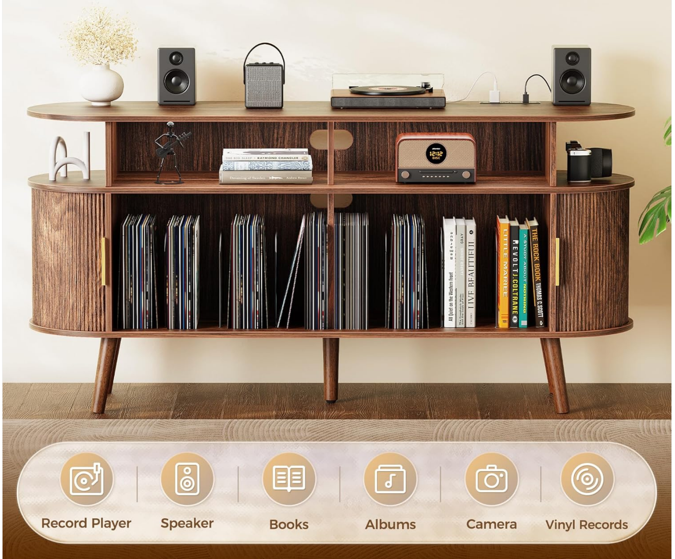
Figure 5: Overview of the stand's storage capabilities.