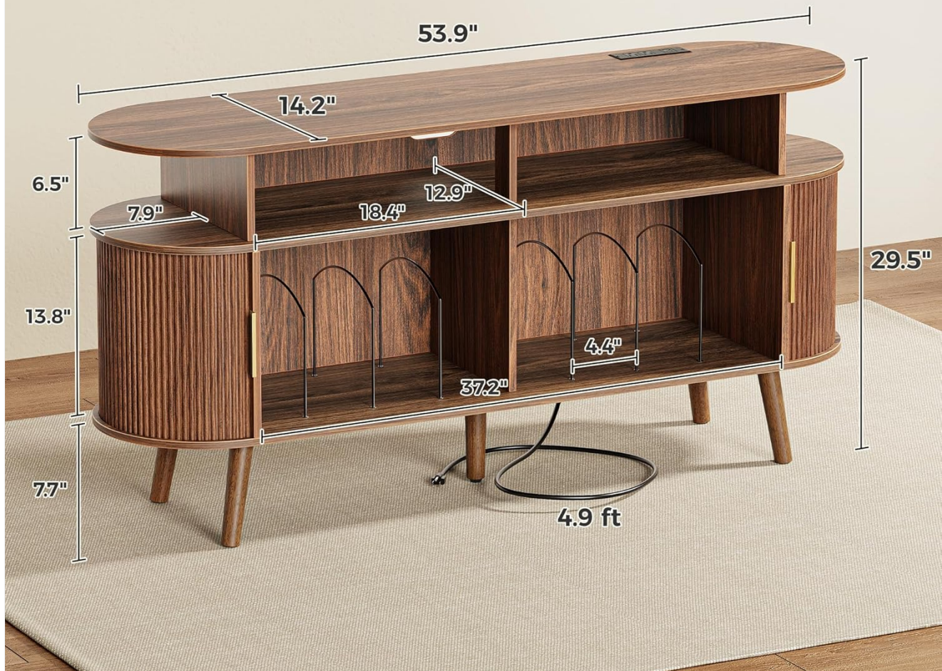
Figure 2: Product dimensions for planning placement and assembly.