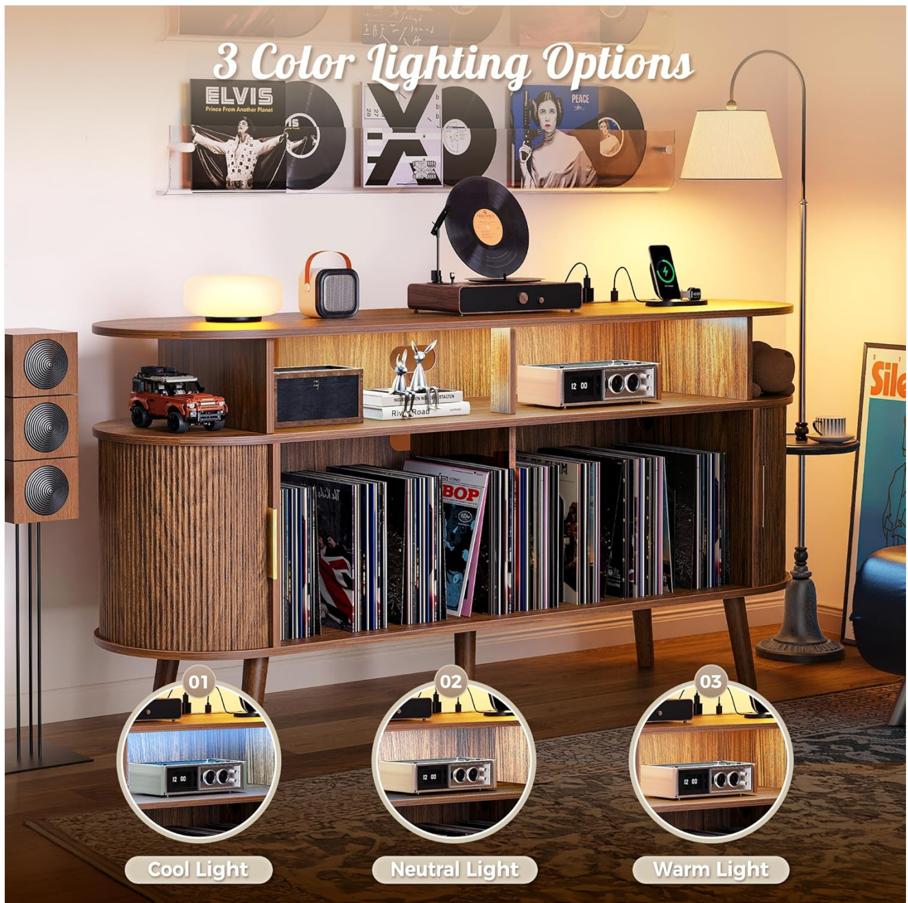
Figure 4: The three available LED lighting color options.