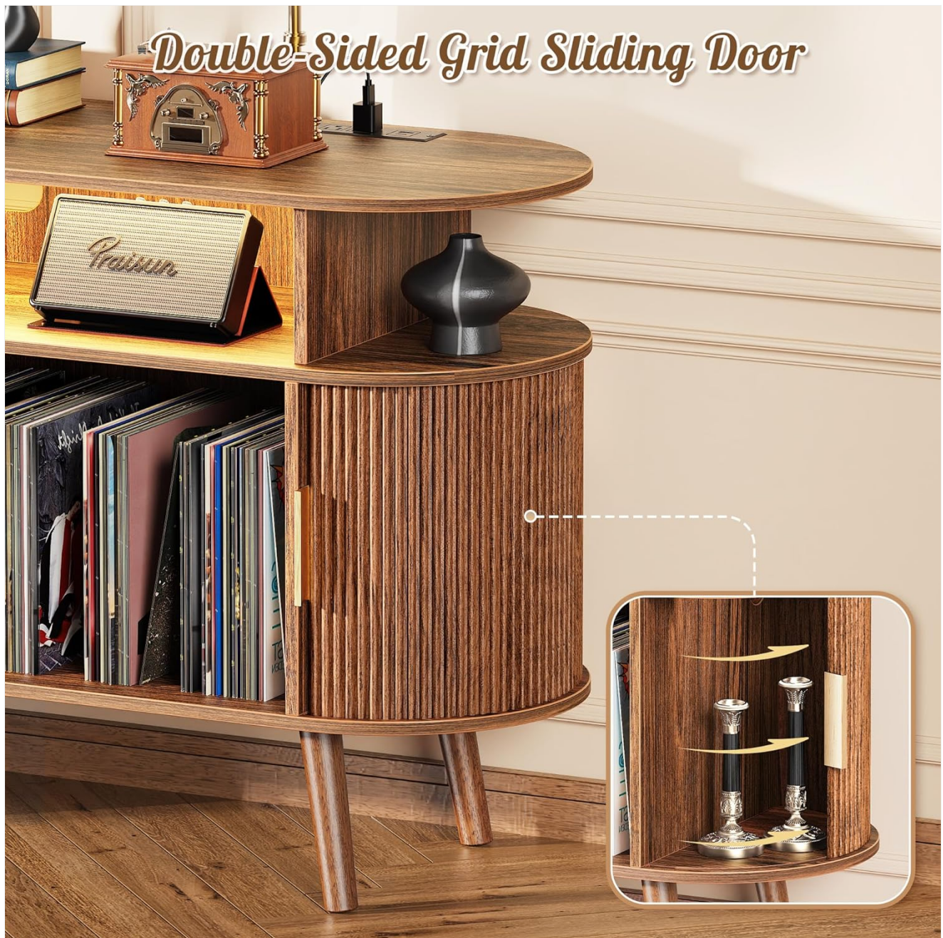
Figure 6: Detail of the double-sided grid sliding door and cabinet interior.