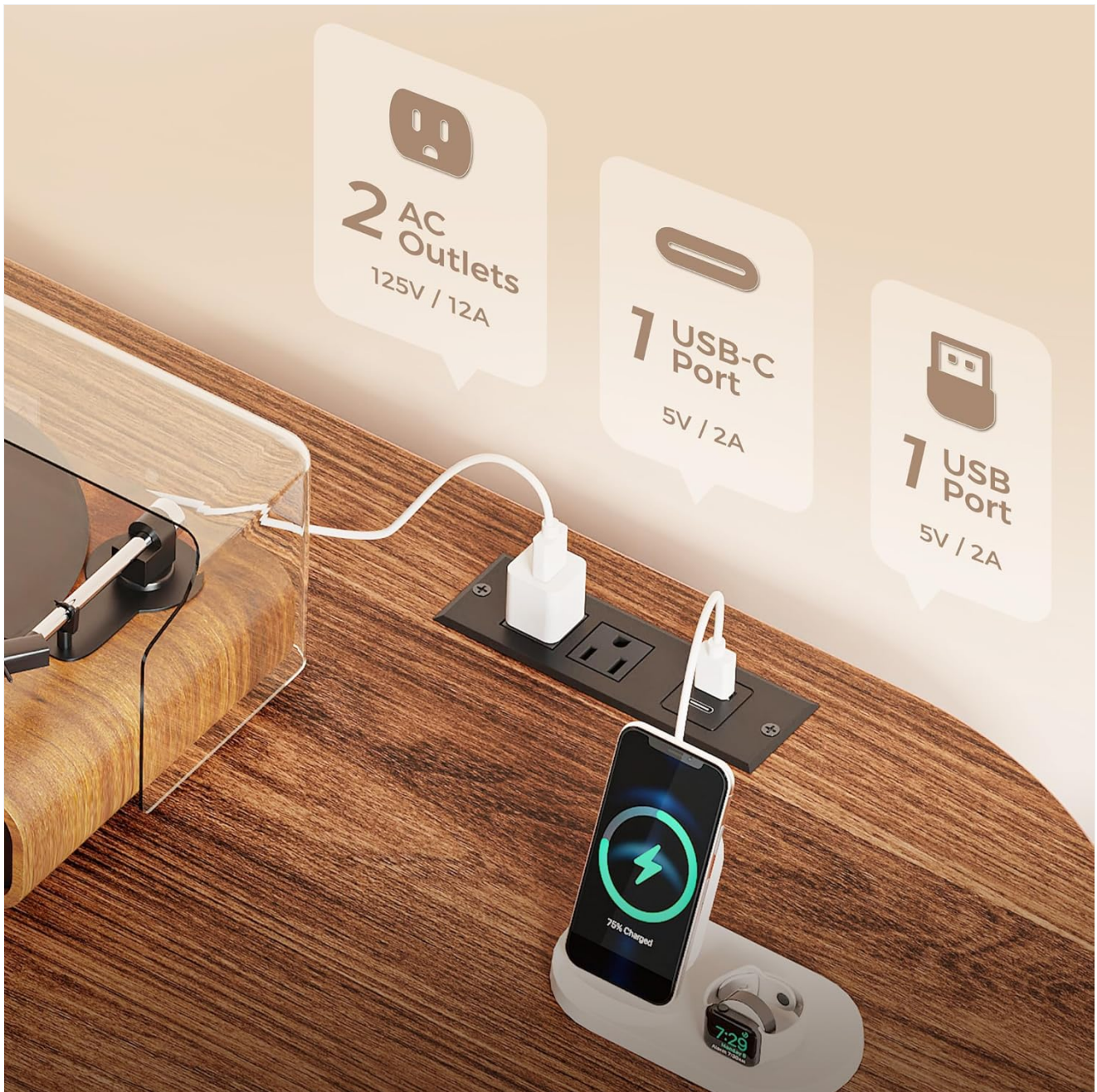
Figure 3: Detail of the built-in power outlets and USB ports.