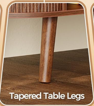
Tapered Table Legs