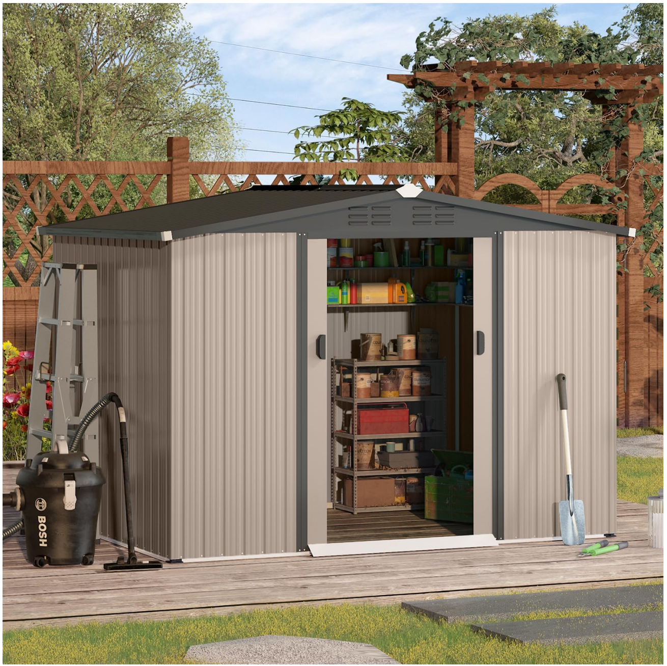
Figure 3.1: An example of the fully assembled U-MAX storage shed.

For additional guidance, U-MAX offers step-by-step video tutorials and remote assistance from their technical team. Contact customer support for access to these resources if needed.