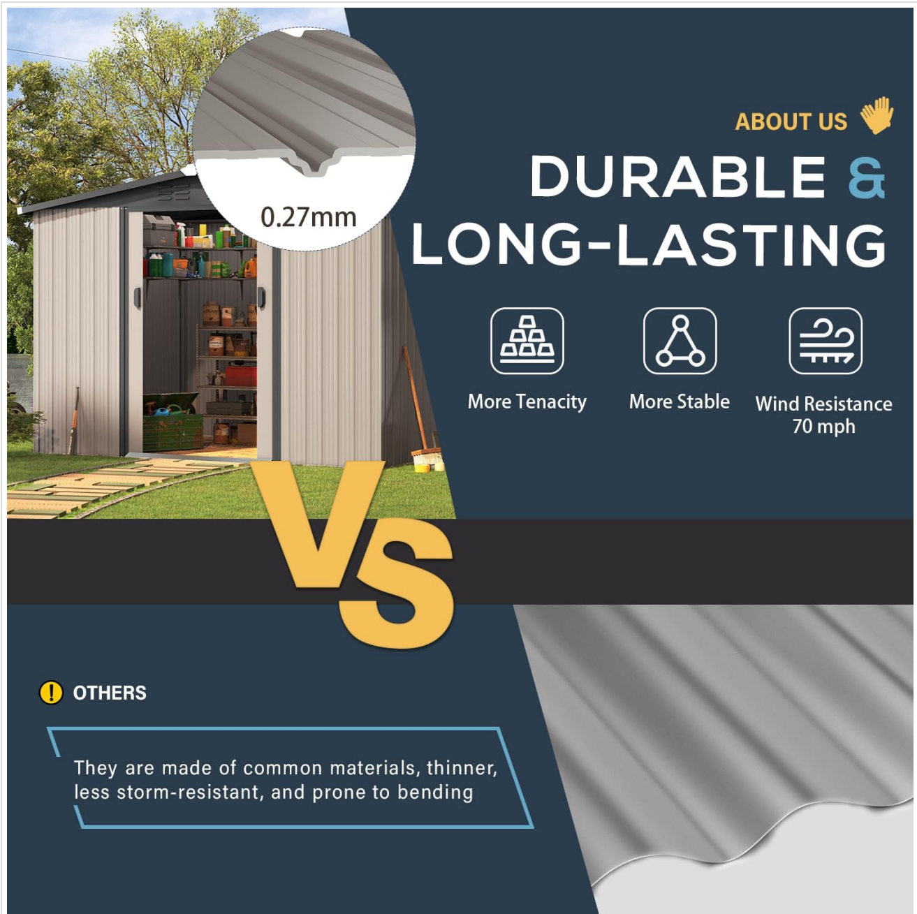
Figure 5.1: The shed's durable metal construction is designed for long-lasting performance.