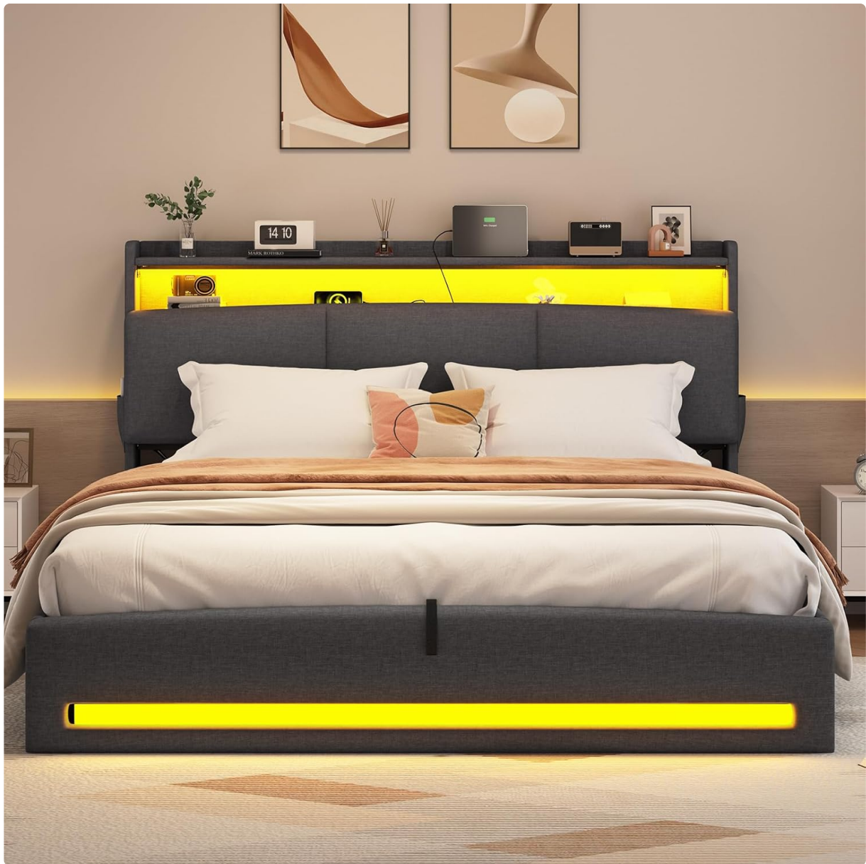
Image: The AOGLLATI storage bed with its LED lights set to a warm yellow color, providing a cozy atmosphere.