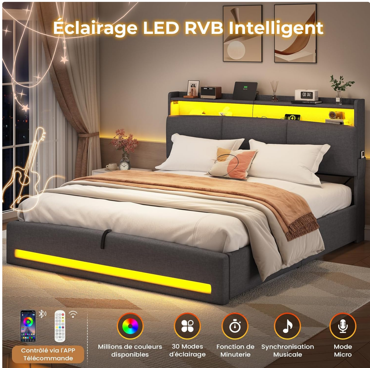
Image: The bed illuminated with intelligent RGB LED lighting, highlighting features like millions of colors, 30 lighting modes, timer function, music synchronization, and control via app/remote.