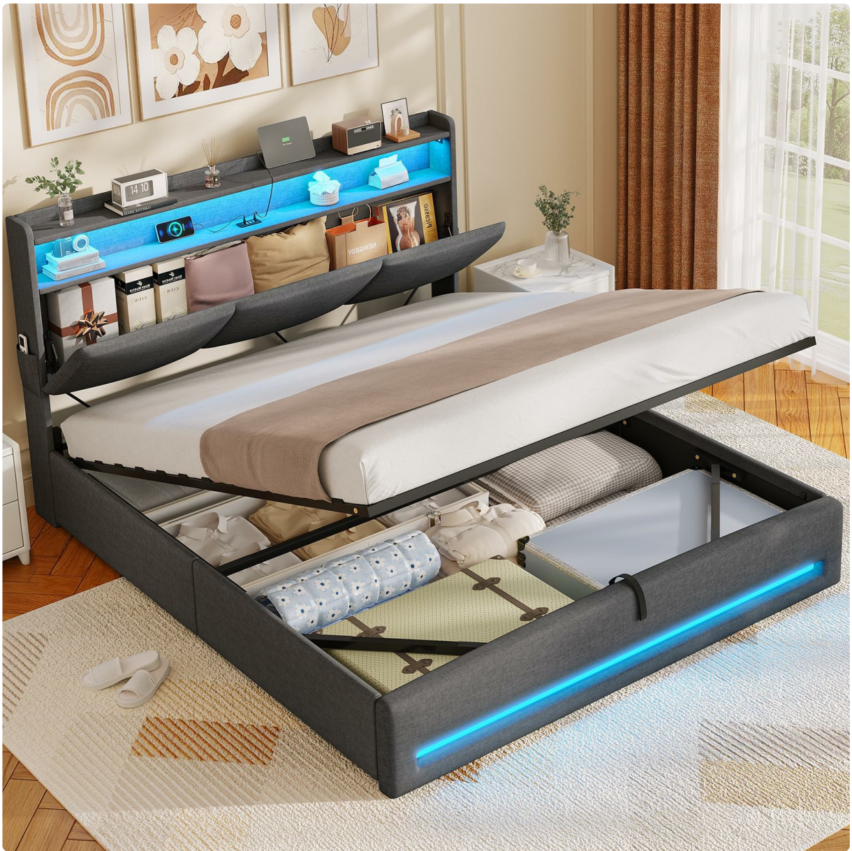
Image: The AOGLLATI 140x190cm storage bed in dark grey, showcasing its upholstered headboard, LED lighting, and overall design.