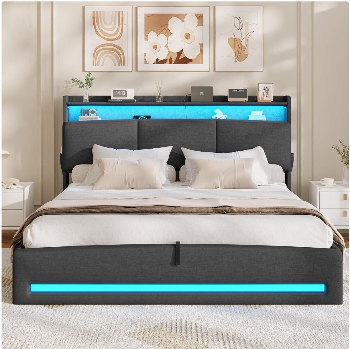
Image: The AOGLLATI storage bed with its LED lights set to a blue color, creating a calm ambiance.