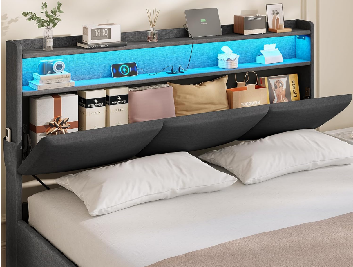
Image: The upholstered headboard featuring two open shelves for immediate access to items and a hidden compartment for discreet storage, illuminated by blue LED lights.