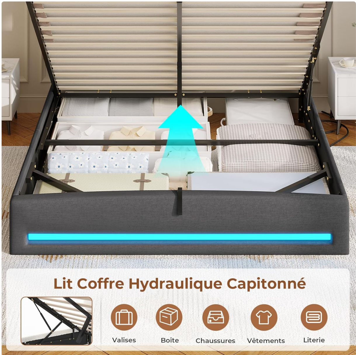
Image: The bed with its hydraulic lift mechanism raised, revealing a large storage area underneath suitable for various items.