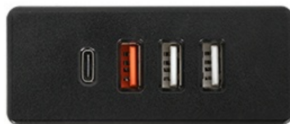
Image: A detailed shot of the USB-A and USB-C ports available on the integrated charging station.

Image: A close-up view of the practical charging station integrated into the headboard, featuring 3 USB-A ports and 1 USB-C port, with devices connected and charging.